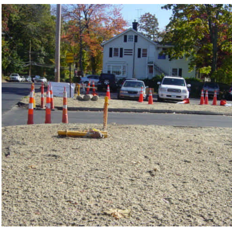
Restoration efforts have been completed near vault #28. The area remains hydroseeded. Monitor for grass cover.