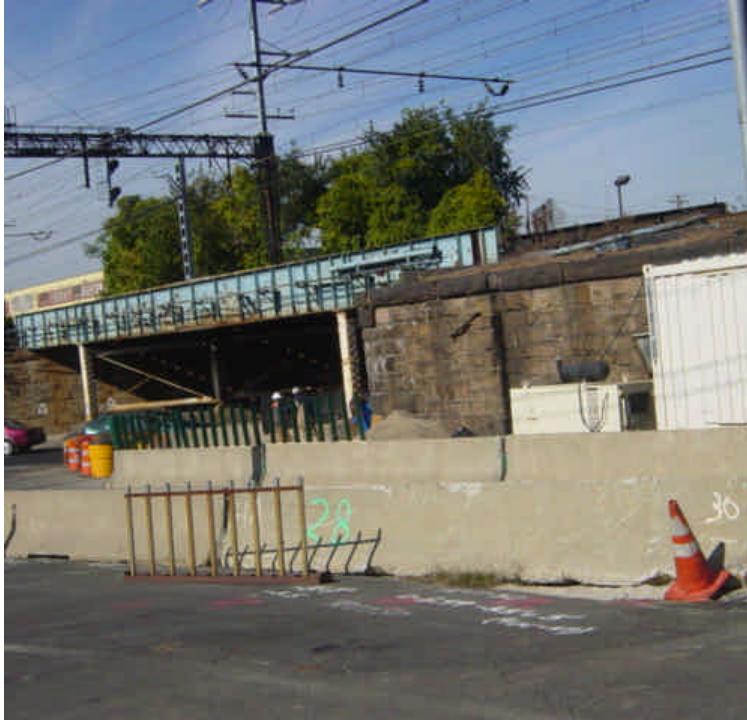
Bridge work, which is not project related, continues near sta. #719. However, the catch basin downgradient should be cleaned as part of the M/N project work.