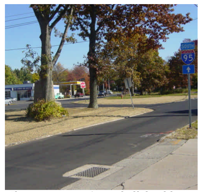
The area near sta. #463 remains restored and hydroseeded. Monitor for grass cover.