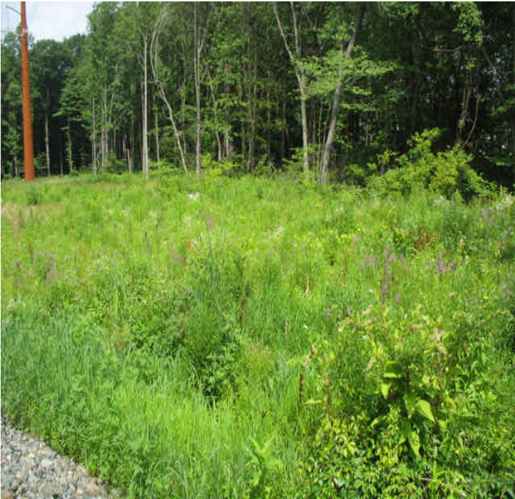
Wetland crossing at the edge of the receiving yard is stable with most native wetland species.