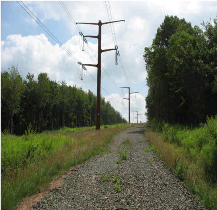
Grass cover noted along the ROW across from the receiving yard.