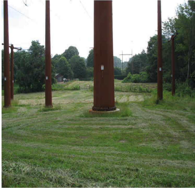
View of the 1A and 1B intersection off Little Lane. The field was fully restored and was being hayed.