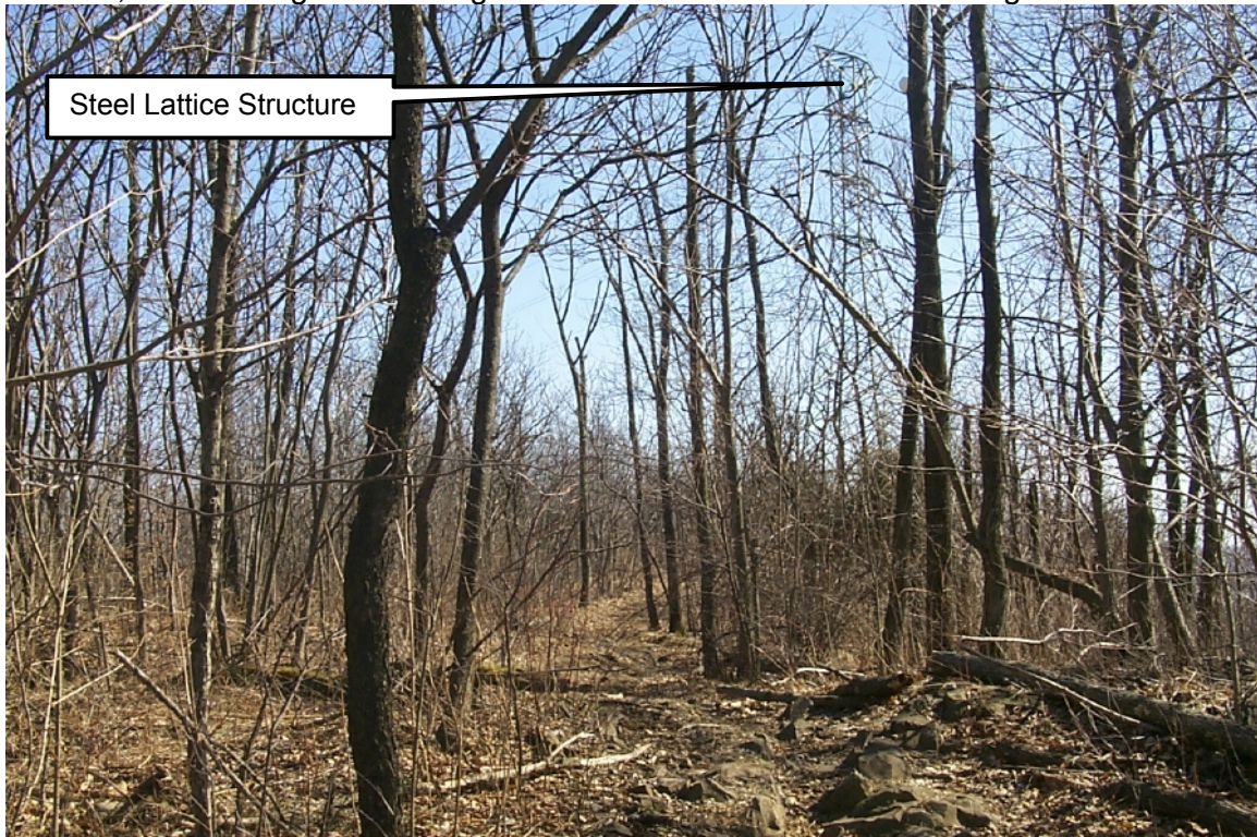
Photo 4, View Facing South along Mattabesett Trial on Besek Mt. Ridgeline

The companies' sightline study found the Mattabesett Trail traversing the length of the Besek Mountain ridgeline would not see the Project's crossing of the ridgeline, with the exception where the trail crosses the existing right-of-way. At points along the Mattabesett Trail 200 feet north and south of the existing maintained right-of-way where the Project will be constructed (approximately 0.04 miles), the companies' staff could not see the ridgeline, and could hardly identify the existing steel lattice structure, because trees obscured the view (see Photos 4 and 5). At distances further away from the existing right-of-way the steel lattice structure became more obstructed and invisible.