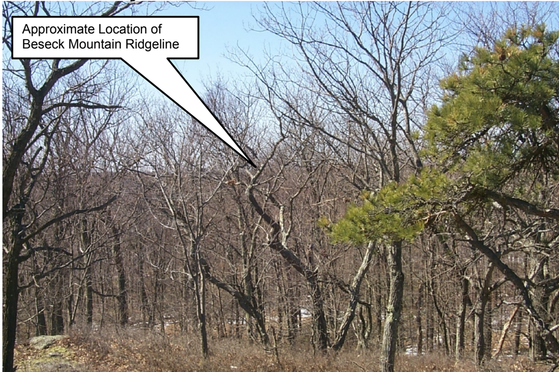
Photo 1, View Facing West from Bear Hill towards Beseck Mountain

The companies identified Bear Hill, near Cockaponset State Forest in Middletown, as the highest point along the Mattabesett Trail with a potentially unobstructed view of the Beseck Mountain ridgeline crossing. The companies' staff could not see the Beseck Mountain ridgeline crossing from this point (see Photo 1), because trees obscured the view. This view point is approximately 8.5 miles from the Beseck Mountain ridgeline crossing.