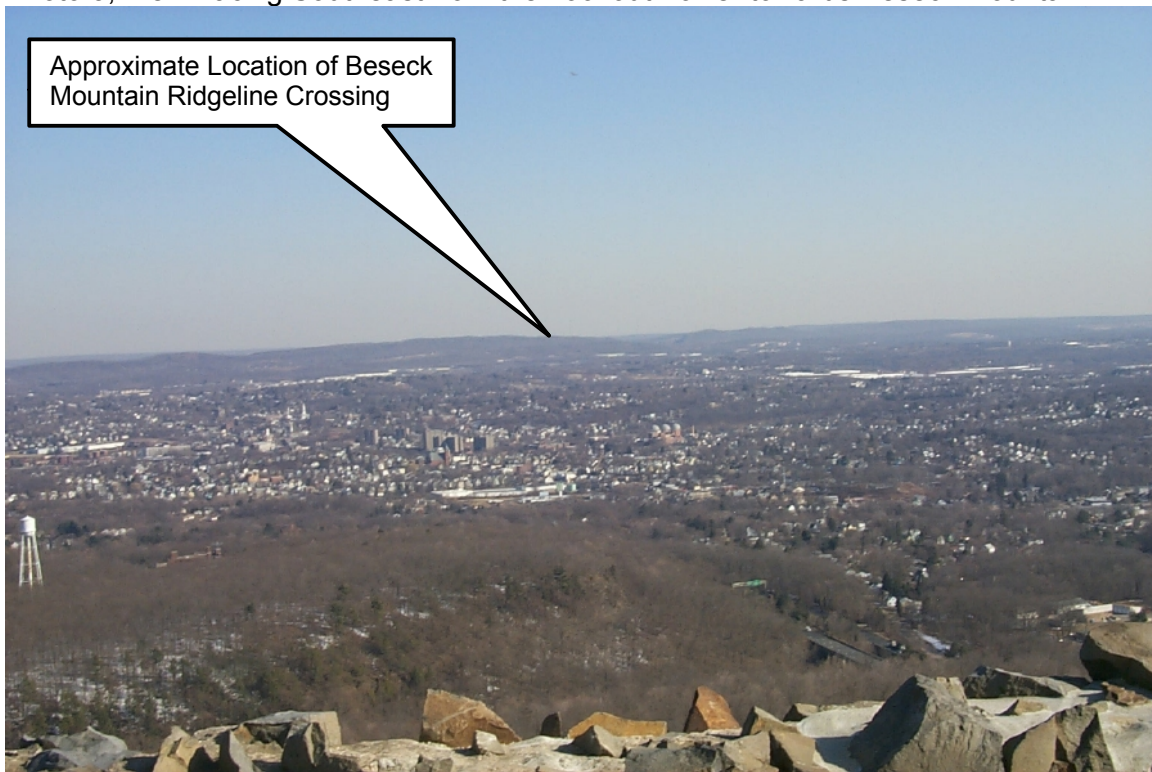
Photo 3, View Facing Southeast from the Lookout Tower towards Beseck Mountain

The companies identified the Lookout Tower, on Meriden Mountain in Meriden, as the highest point along the Metacomet Trail with a potentially unobstructed view of the Beseck Mountain ridgeline crossing. The companies' staff could identify the Beseck Mountain ridgeline from this point (see Photo 3), but could not identify the Project's crossing from this distance (approximately 6.7 miles).