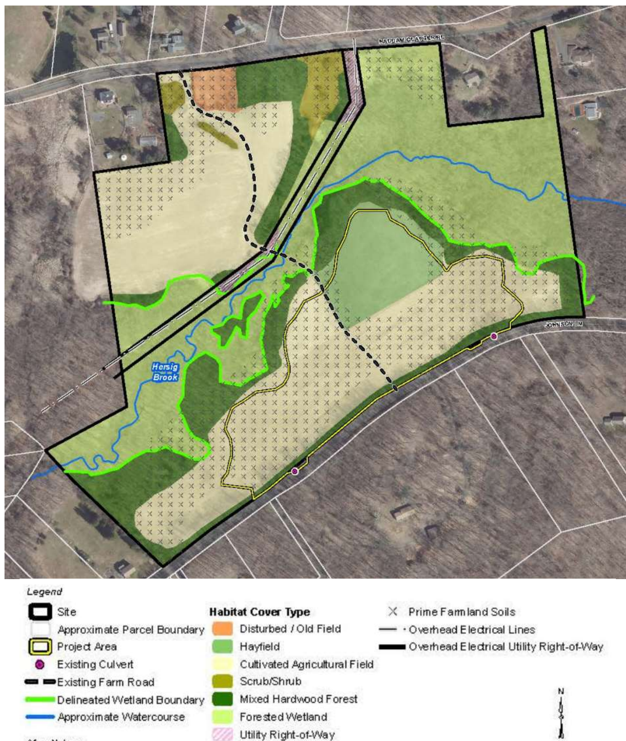
Figure 2 – Existing Conditions