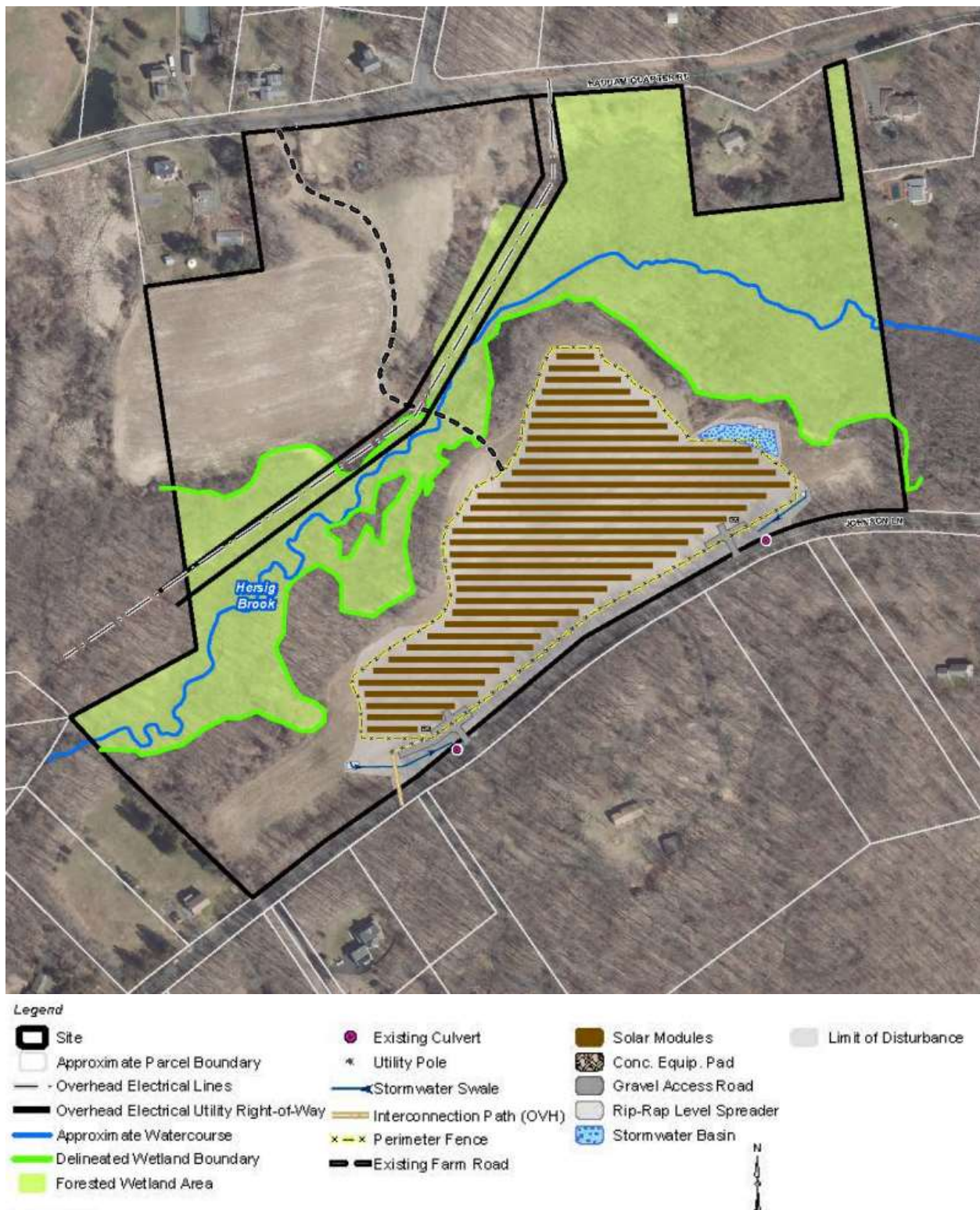
Figure 3 – Proposed Site Layout