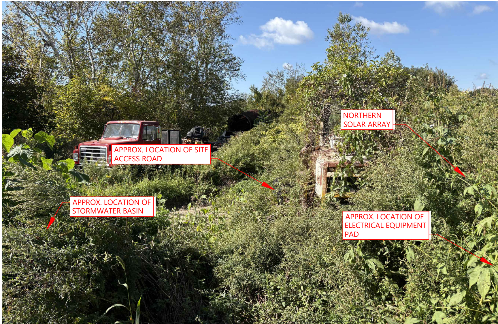
Photo 4 View West to Site Electrical/ Storm Features