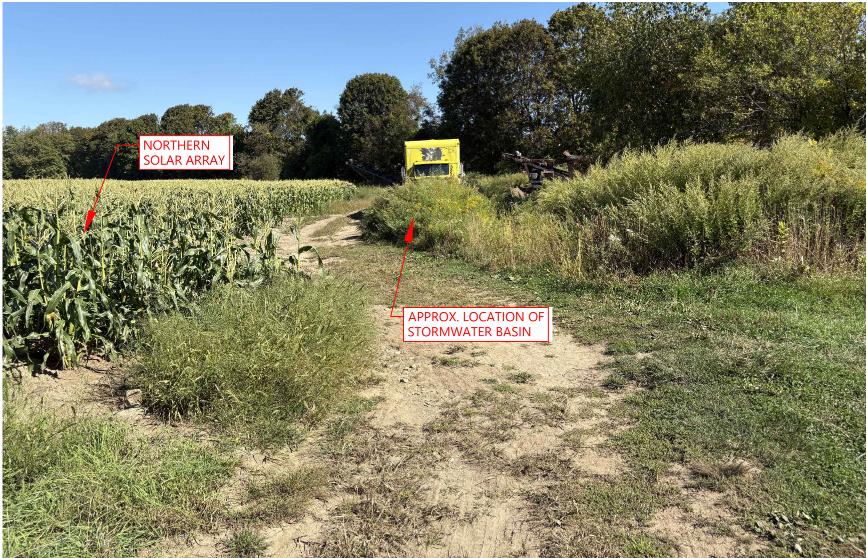
Photo 8 View East towards 1 of 2 Central Stormwater Basins