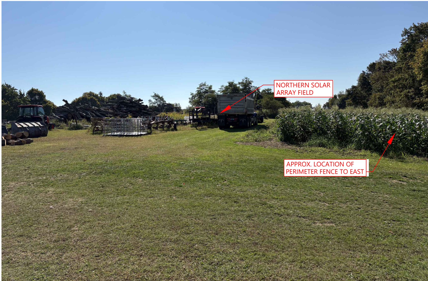
Photo 6 View South towards Northern Array Field