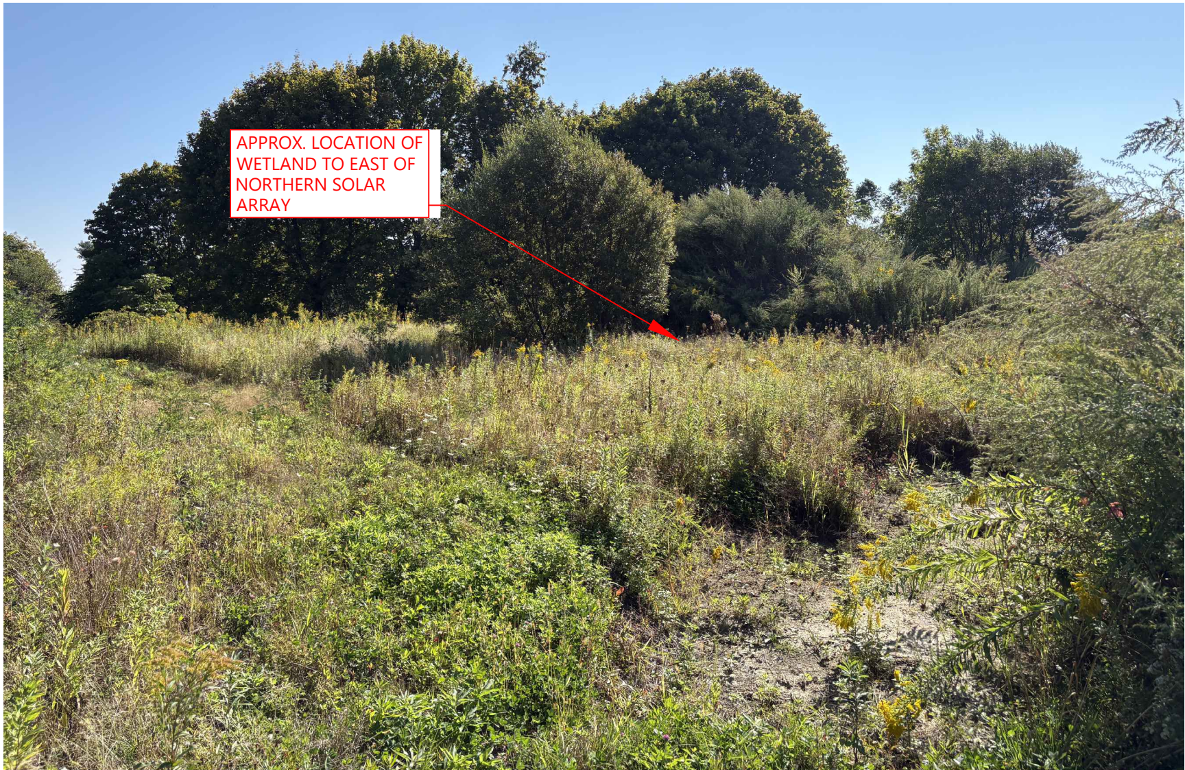
Photo 5 View South towards Adjacent Wetland