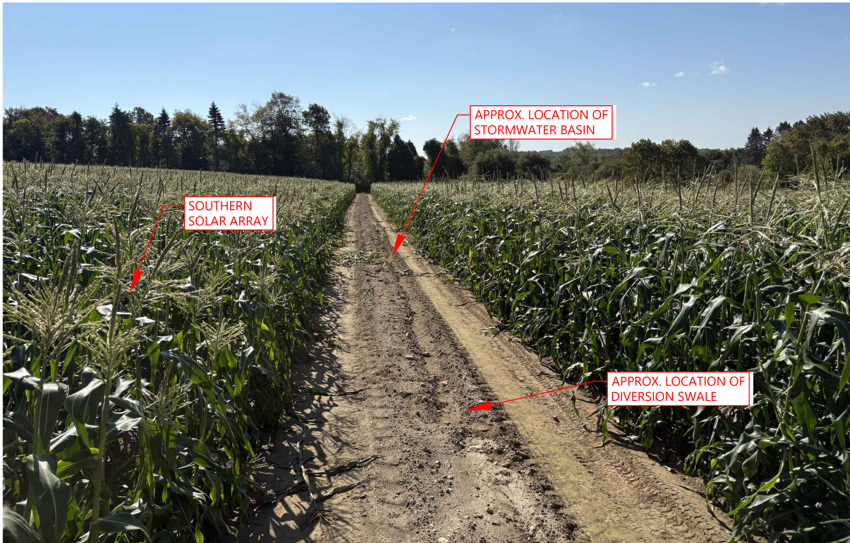
Photo 9 View South towards Southwestern Storm Basin