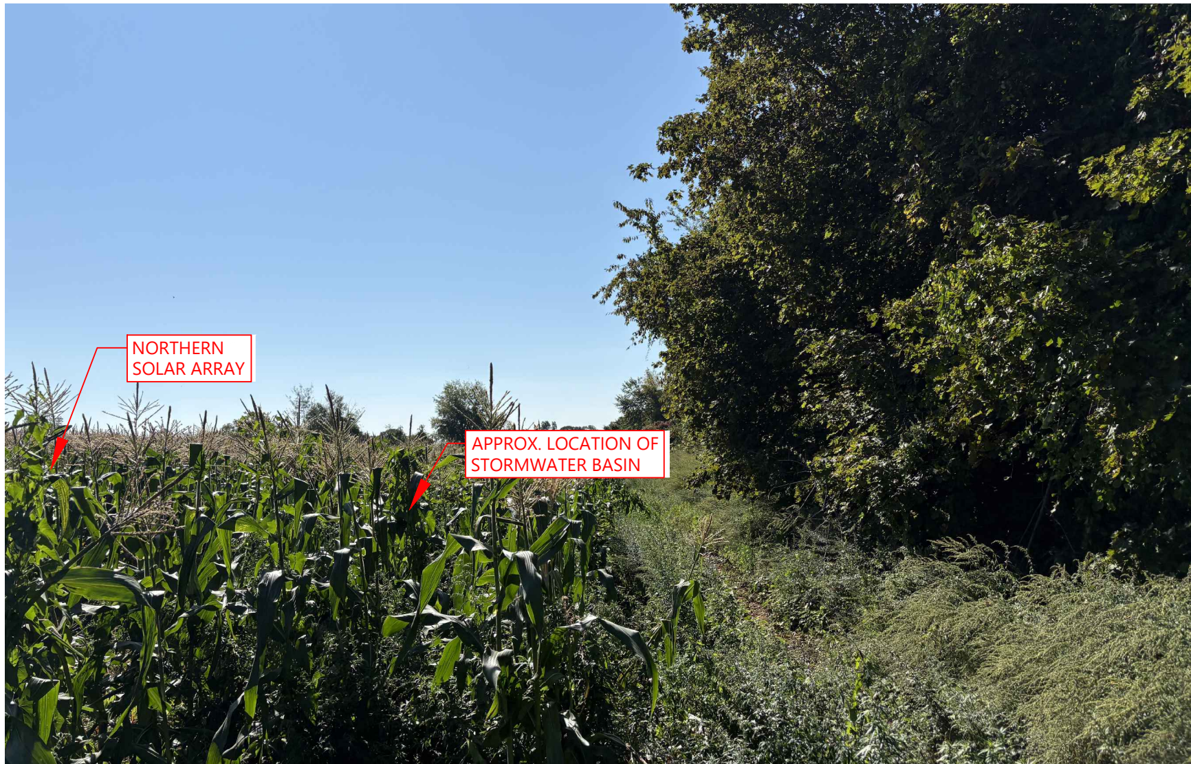
Photo 7 View South to Western Stormwater Basin