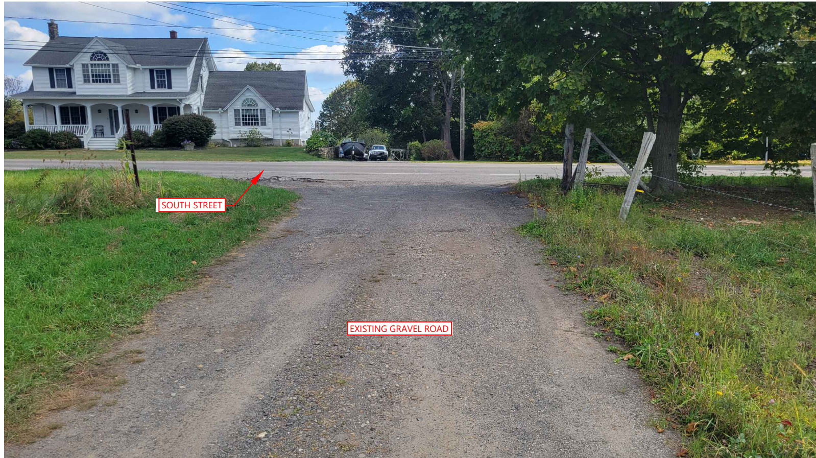
Photo 1 View East to South Street