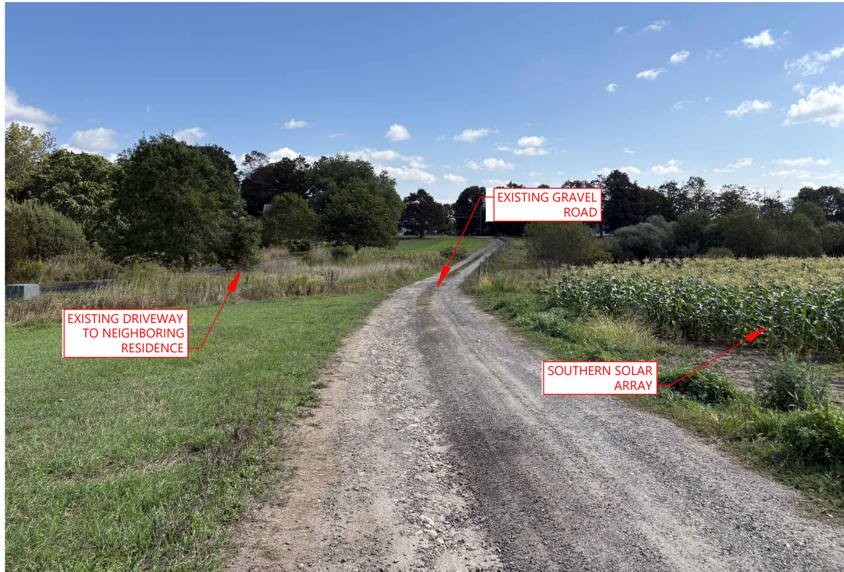
Photo 2 View East down Site Access Road