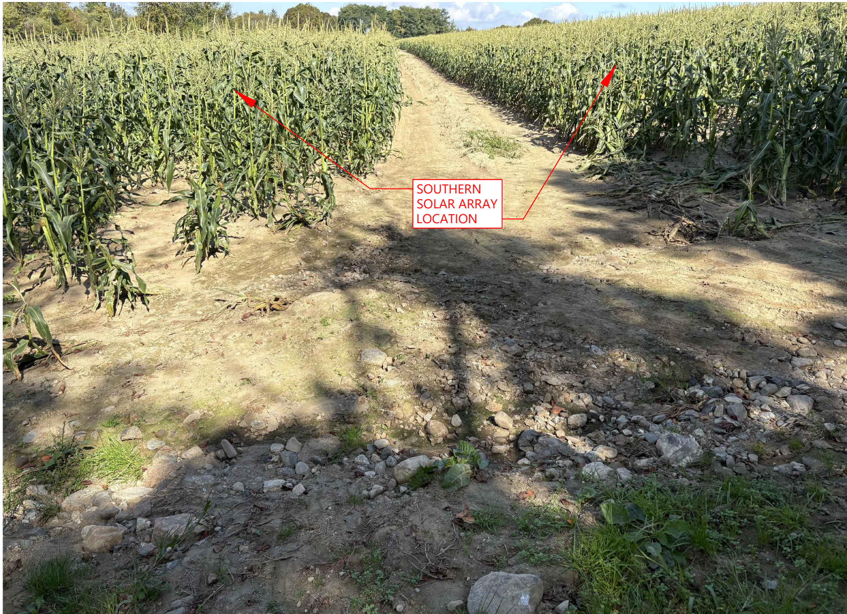
Photo 10 View North to Array from Southern Site Limit