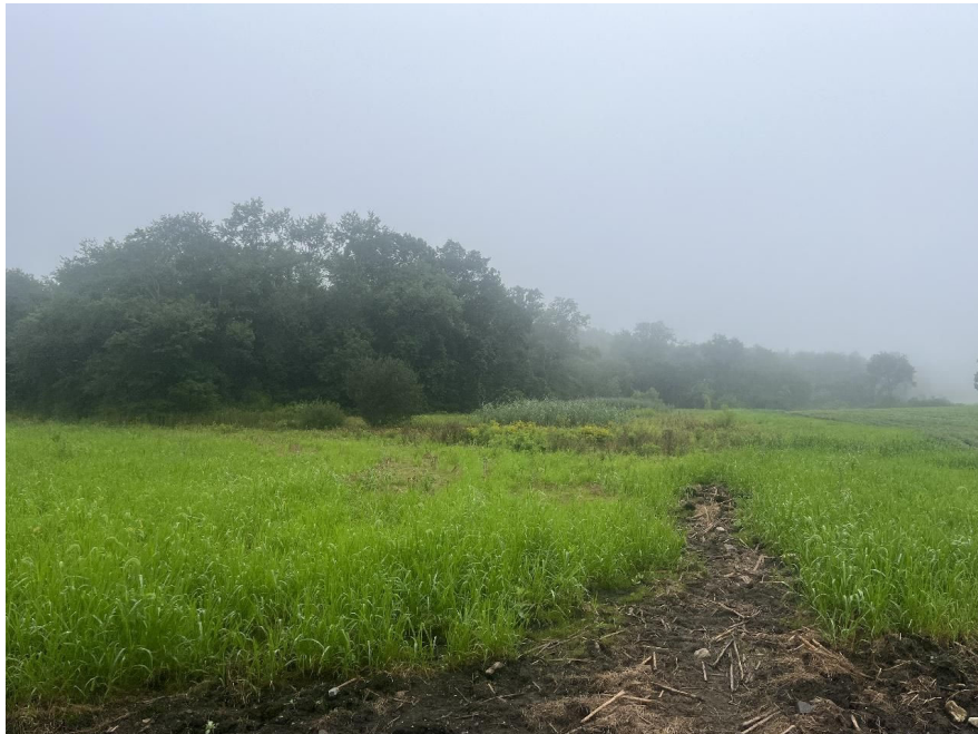
Photo ID: 7359 Image Direction: view northwest Date Taken: August 9, 2024 7:37 AM Latitude: 41.69312778 Longitude: -72.09187222 Notes: View of Approximate Wetland Delineation to the North of the Southern Array Field.