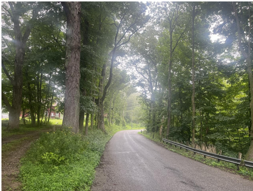
Photo ID: 7354 Date Taken: August 9, 2024 7:32 AM Image Direction: view southeast Latitude: 41.69111389 Longitude: -72.08905833 Notes: View of Roadway to the North of the Existing Property Entrance.