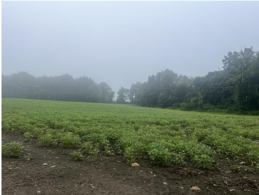
Photo ID: 7362 Date Taken: August 9, 2024 7:37 AM Image Direction: view east Latitude: 41.69313889 Longitude: -72.09188056 Notes: Typical View of Central Array Field.

Project No. 24412 Address Gager Hill Rd, Scotland, CT, 06280, USA Project Name Gager Hill - Main Report Project Area Photographs