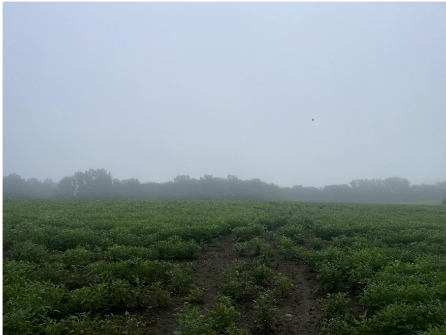
Photo ID: 7366 Date Taken: August 9, 2024 7:42 AM Image Direction: view south Latitude: 41.69358889 Notes: Typical View of Central Array Field. Longitude: -72.09442778