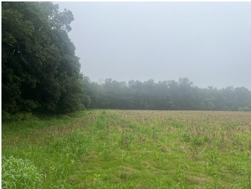
Photo ID: 7383 Date Taken: August 9, 2024 7:49 AM Image Direction: view west Latitude: 41.69236111 Longitude: -72.09849444 Notes: Typical View of Southwestern Farmland to remain undisturbed.