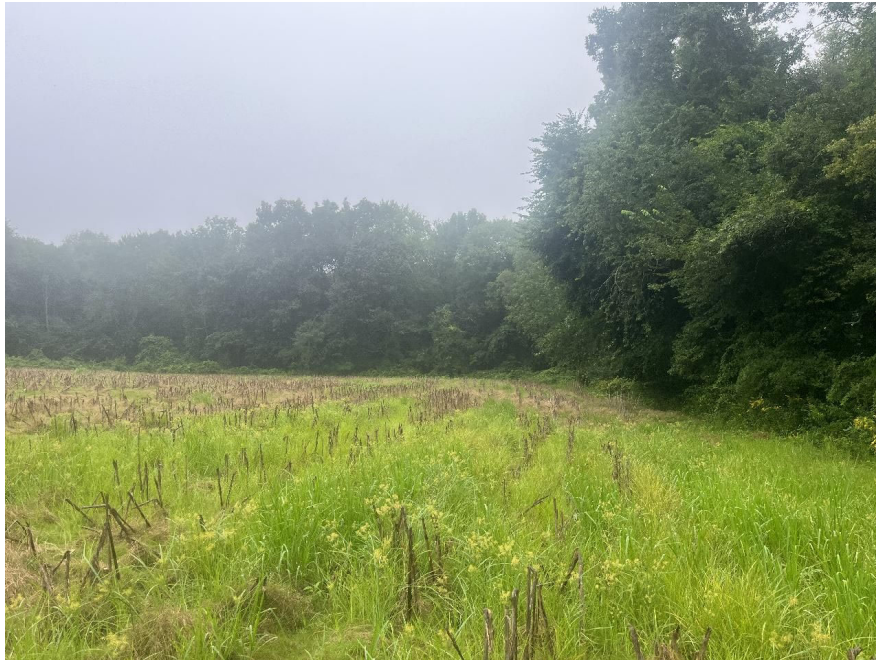
Photo ID: 7386 Date Taken: August 9, 2024 7:50 AM Image Direction: view northeast Latitude: 41.69236389 Longitude: -72.09848056 Notes: Typical View of Southwestern Farmland to remain undisturbed.

Project No. 24412 Address Gager Hill Rd, Scotland, CT, 06280, USA Project Name Gager Hill - Southwest Portion Report Project Area Photographs