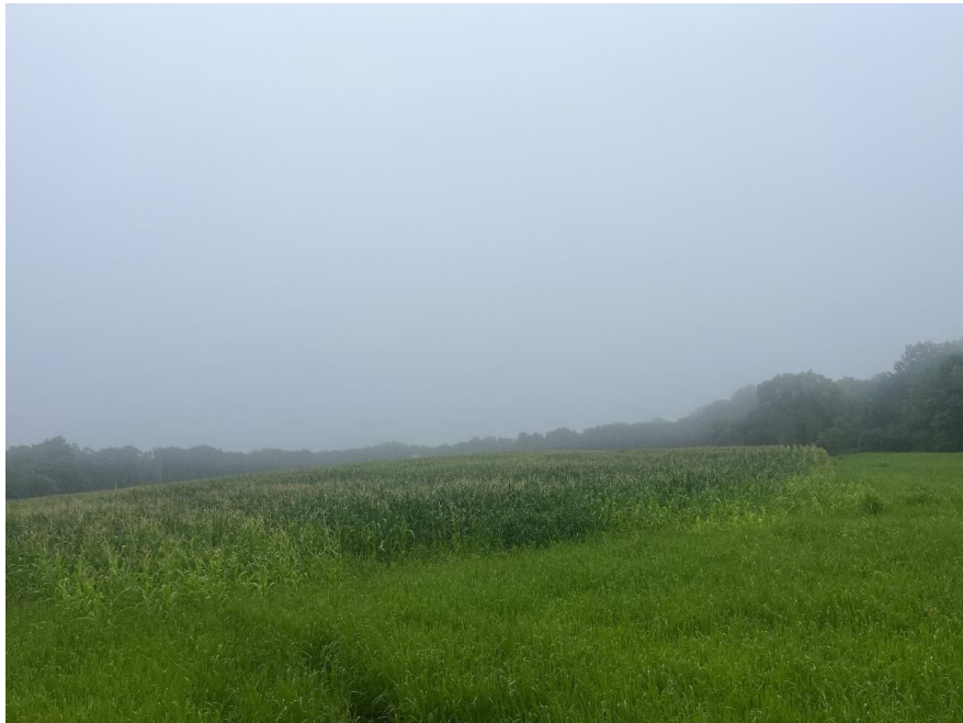
Photo ID: 7361 Date Taken: August 9, 2024 7:37 AM Image Direction: view west Latitude: 41.69311944 Longitude: -72.09186667 Notes: Typical View of Central Array Field.

Photo ID: 7360 Date Taken: August 9, 2024 7:37 AM Image Direction: view west Latitude: 41.69311389 Longitude: -72.09187222 Notes: Typical View of Southern Array Field.