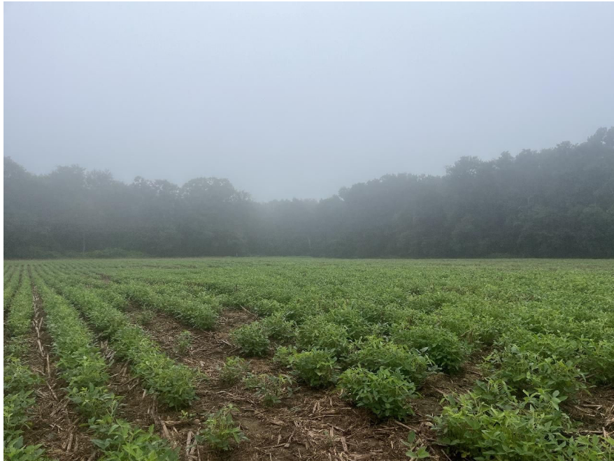
Photo ID: 7377 Date Taken: August 9, 2024 7:46 AM Image Direction: view northeast Latitude: 41.69367222 Longitude: -72.09706944 Notes: Typical View of Existing Farmland within proposed Western Array Field.

Project No. 24412 Address Gager Hill Rd, Scotland, CT, 06280, USA Project Name Gager Hill - Northwest Portion Report Project Area Photographs