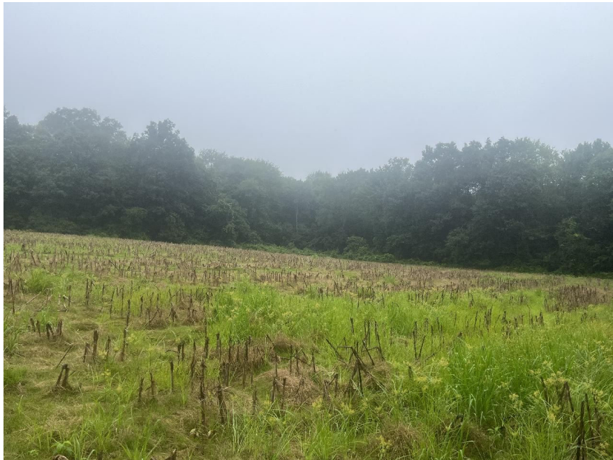
Photo ID: 7385 Date Taken: August 9, 2024 7:50 AM Image Direction: view northeast Latitude: 41.69236389 Longitude: -72.09848889 Notes: Typical View of Southwestern Farmland to remain undisturbed.