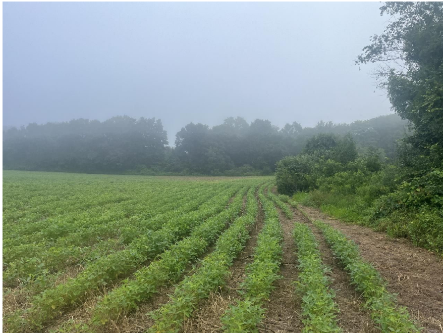
Photo ID: 7376 Date Taken: August 9, 2024 7:43 AM Image Direction: view east Latitude: 41.69355 Longitude: -72.09471111 Notes: Typical View of Existing Farmland within proposed Western Array Field.