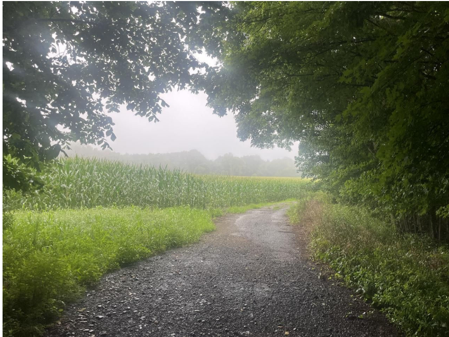
Photo ID: 7356 Date Taken: August 9, 2024 7:32 AM Image Direction: view north Latitude: 41.69108611 Longitude: -72.08918056 Notes: View of Existing Entrance to Property.

Project No. 24412 Address Gager Hill Rd, Scotland, CT, 06280, USA Project Name Gager Hill - Main Report Project Area Photographs