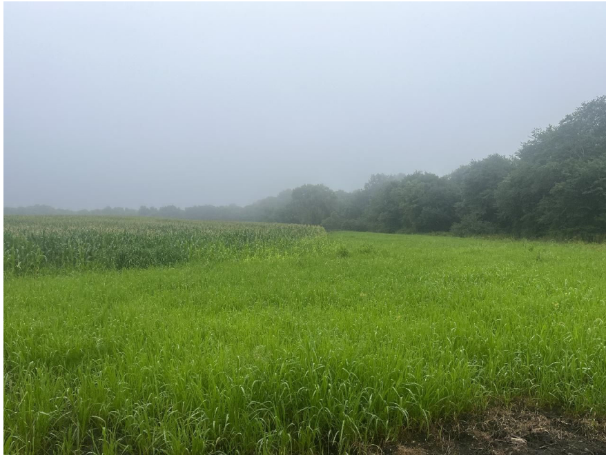
Photo ID: 7360 Date Taken: August 9, 2024 7:37 AM Image Direction: view west Latitude: 41.69311389 Longitude: -72.09187222 Notes: Typical View of Southern Array Field.

Project No. 24412 Address Gager Hill Rd, Scotland, CT, 06280, USA Project Name Gager Hill - Main Report Project Area Photographs