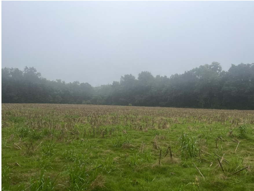
Photo ID: 7384 Date Taken: August 9, 2024 7:49 AM Image Direction: view northwest Latitude: 41.69236111 Longitude: -72.09848056 Notes: Typical View of Southwestern Farmland to remain undisturbed.

Project No. 24412 Address Gager Hill Rd, Scotland, CT, 06280, USA Project Name Gager Hill - Southwest Portion Report Project Area Photographs