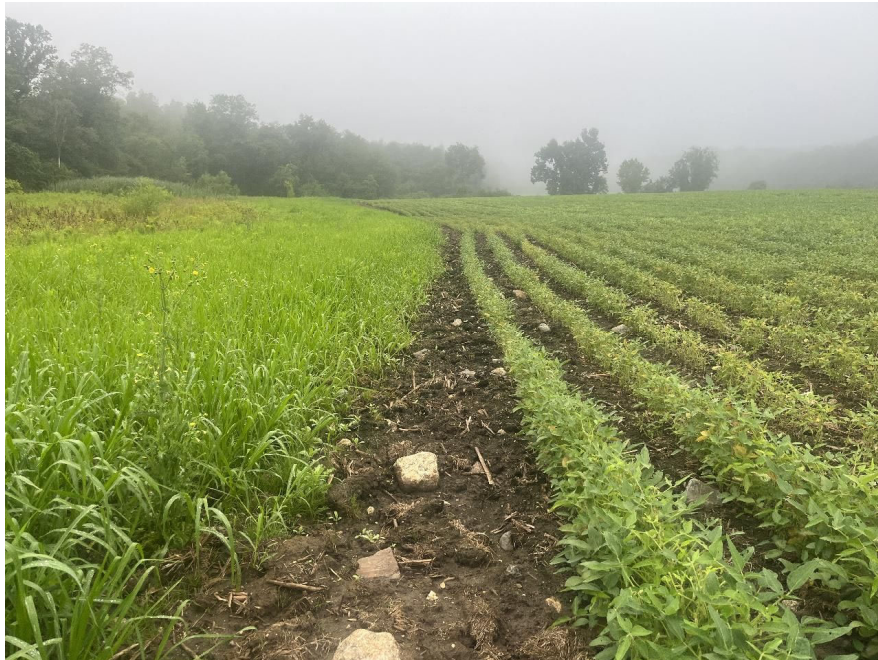
Photo ID: 7365 Date Taken: August 9, 2024 7:39 AM Image Direction: view north Latitude: 41.69315 Notes: Typical View of Central Array Field. Longitude: -72.09220833

Project No. 24412 Address Gager Hill Rd, Scotland, CT, 06280, USA Project Name Gager Hill - Main Report Project Area Photographs