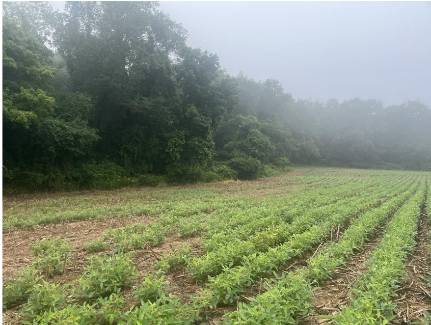
Photo ID: 7379 Date Taken: August 9, 2024 7:46 AM Image Direction: view northwest Latitude: 41.69366389 Longitude: -72.09707778 Notes: View of Southern Treeline outside of Western Array Field.

Project No. 24412 Address Gager Hill Rd, Scotland, CT, 06280, USA Project Name Gager Hill - Northwest Portion Report Project Area Photographs