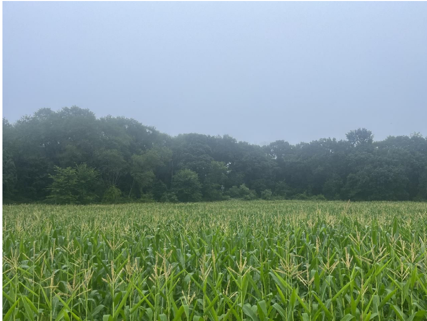
Photo ID: 7358 Image Direction: view southeast Date Taken: August 9, 2024 7:36 AM Latitude: 41.69279444 Longitude: -72.09129444 Notes: Typical View of Southern Array Field.

Project No. 24412 Address Gager Hill Rd, Scotland, CT, 06280, USA Project Name Gager Hill - Main Report Project Area Photographs