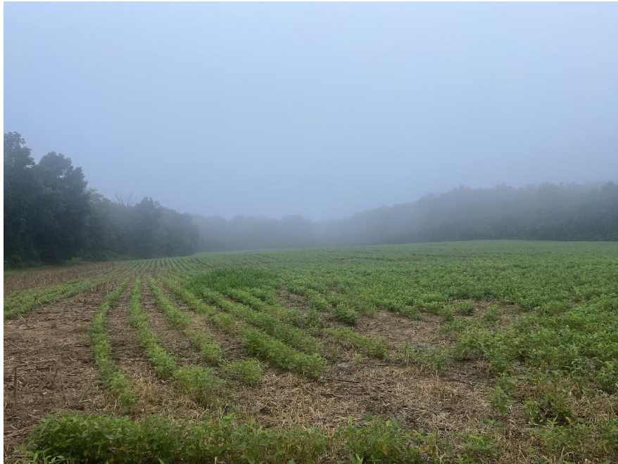
Photo ID: 7375 Date Taken: August 9, 2024 7:43 AM Image Direction: view north Latitude: 41.69355278 Longitude: -72.09471944 Notes: Typical View of Existing Farmland within proposed Western Array Field.

Project No. 24412 Address Gager Hill Rd, Scotland, CT, 06280, USA Project Name Gager Hill - Northwest Portion Report Project Area Photographs