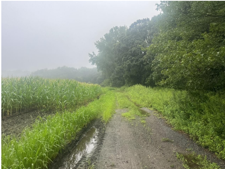
Photo ID: 7357 Date Taken: August 9, 2024 7:33 AM Image Direction: view east Latitude: 41.69144444 Longitude: -72.08979167 Notes: Typical View of Existing Gravel Access/Vehicular Pathway