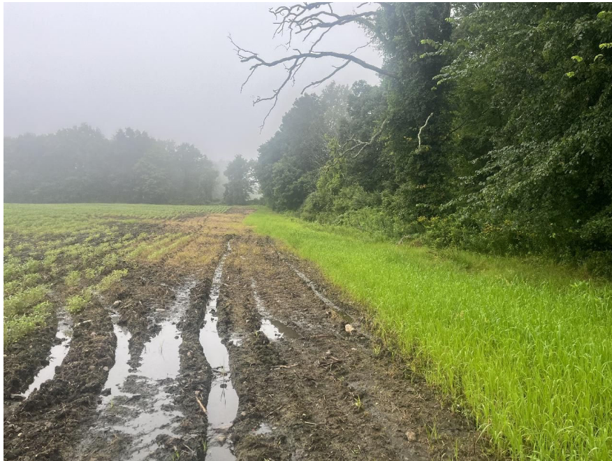
Photo ID: 7364 Date Taken: August 9, 2024 7:38 AM Image Direction: view east Latitude: 41.69353611 Longitude: -72.09148333 Notes: View of Treeline along the approximate Eastern Property by the Central Array Field.