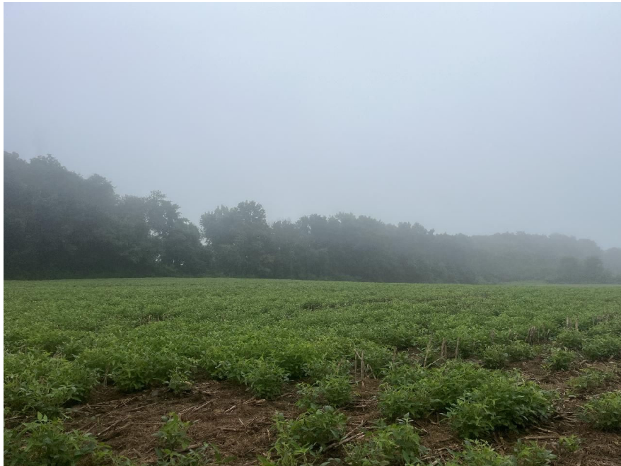
Photo ID: 7378 Date Taken: August 9, 2024 7:46 AM Image Direction: view southeast Latitude: 41.69366944 Longitude: -72.09706944 Notes: Typical View of Existing Farmland within proposed Western Array Field.