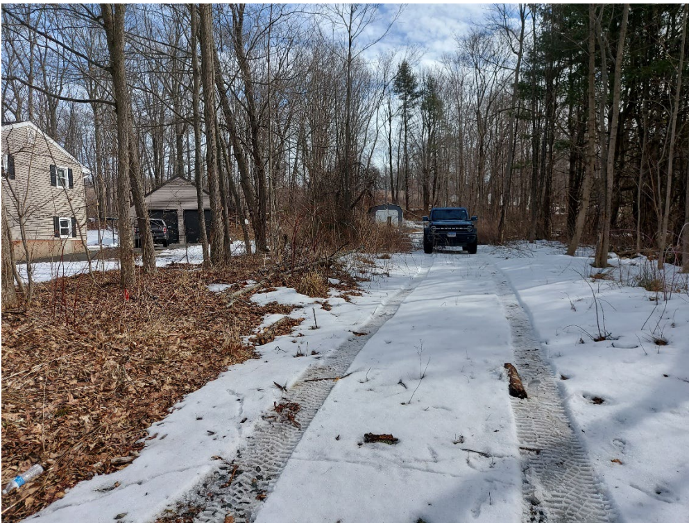
Location 1: Maple Road Looking East at Existing Access Drive