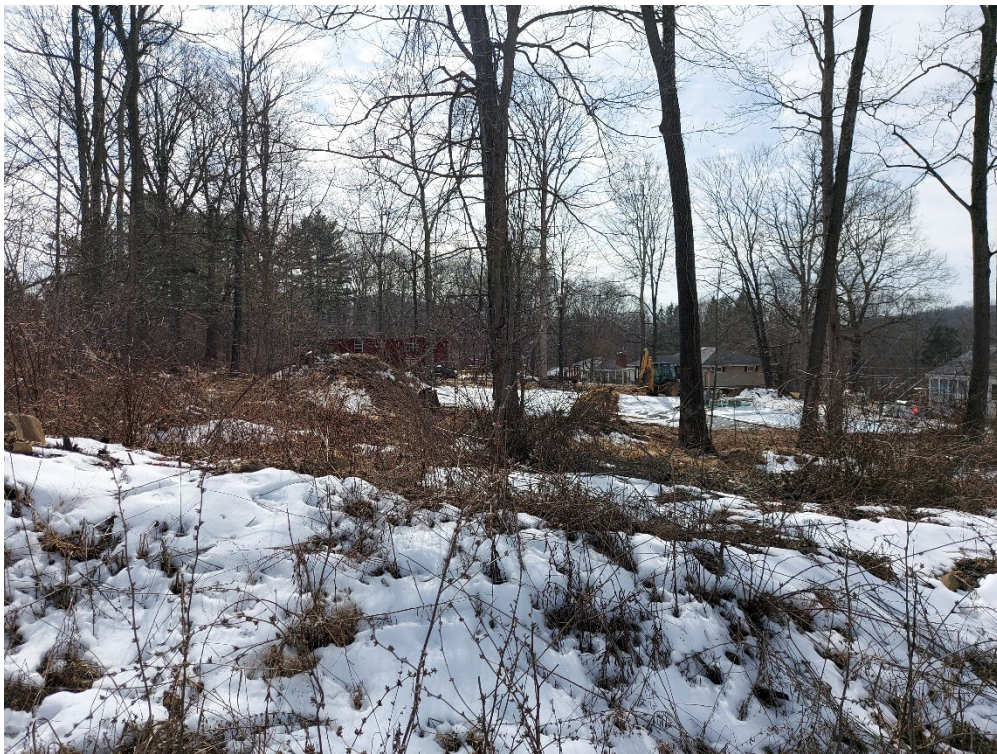
Location 2: Southern End of Stormwater Basin #1A Looking South