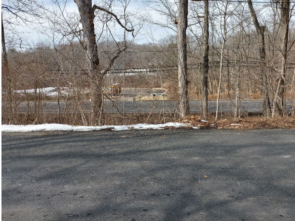
Location 1: Maple Road Looking Northwest At Proposed Interconnection Area on Foxon Road