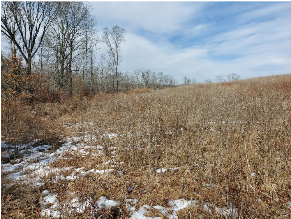
Location 4: Southern End of Stormwater Basin #2 Looking North