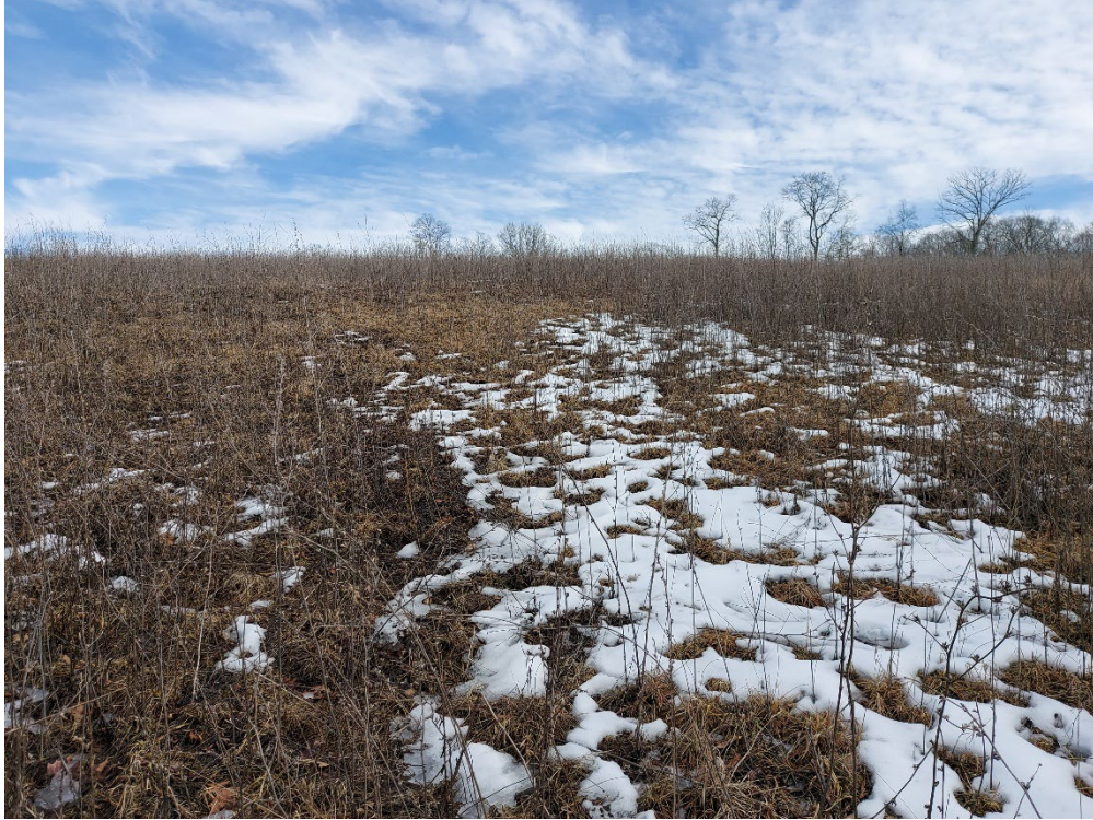
Location 12: Approximate Center of Array Looking Southwest