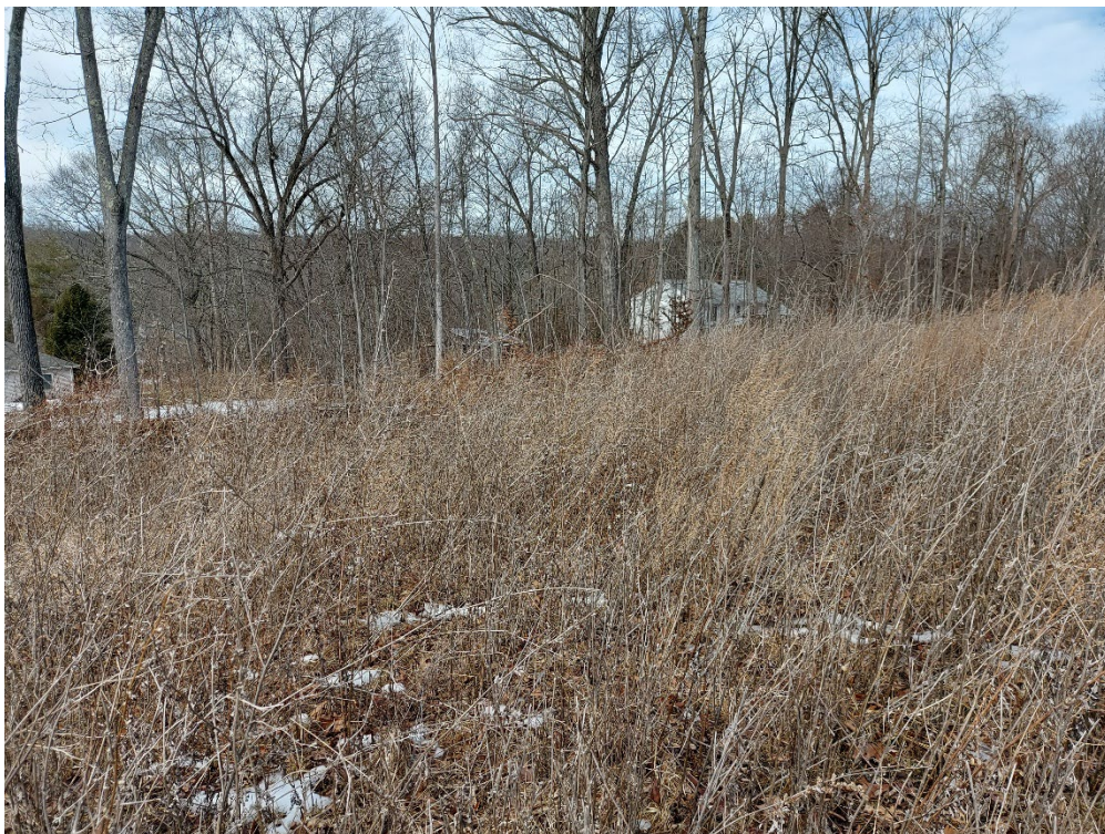
Location 9: Northwest Corner of Array Looking West Toward Foxon Road