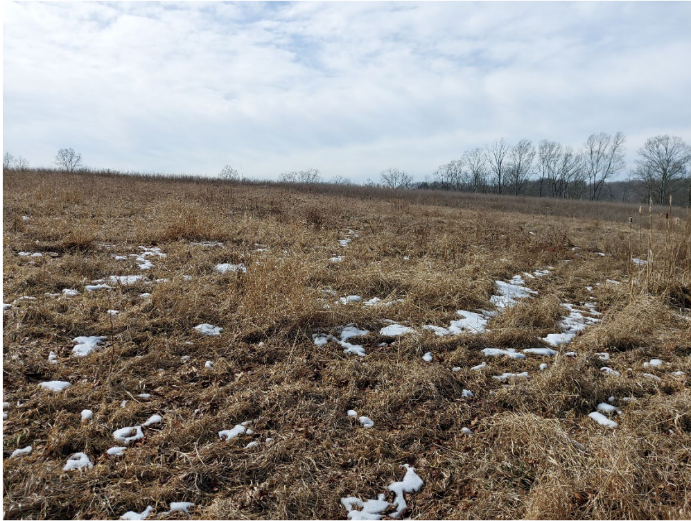
Location 8: Northeast Corner of Array Looking Southwest Toward Array