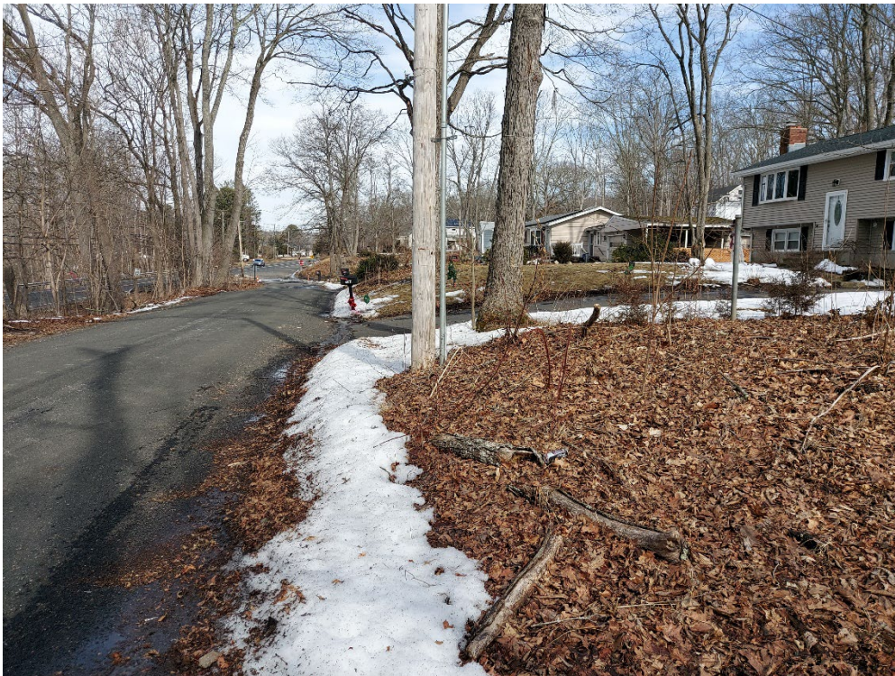
Location 1: Maple Road Looking at North Bound Lane