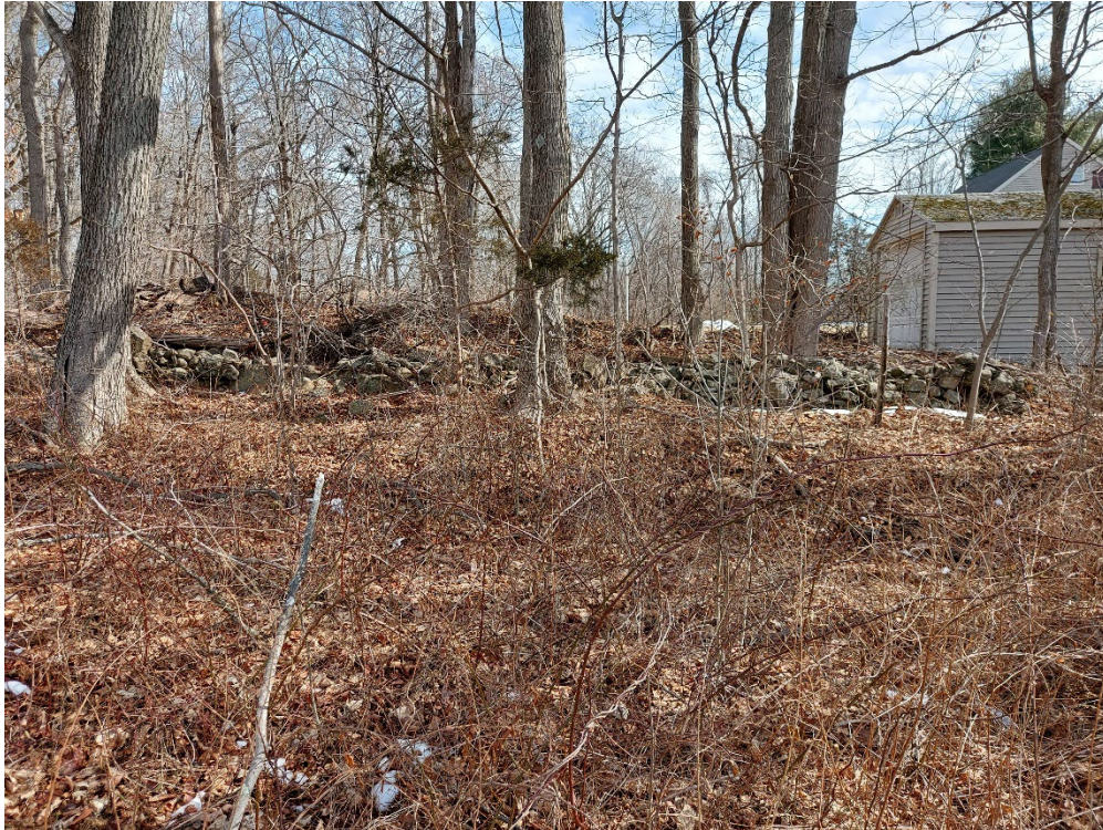
Location 6: Edge of Existing Clearing Limits Looking East