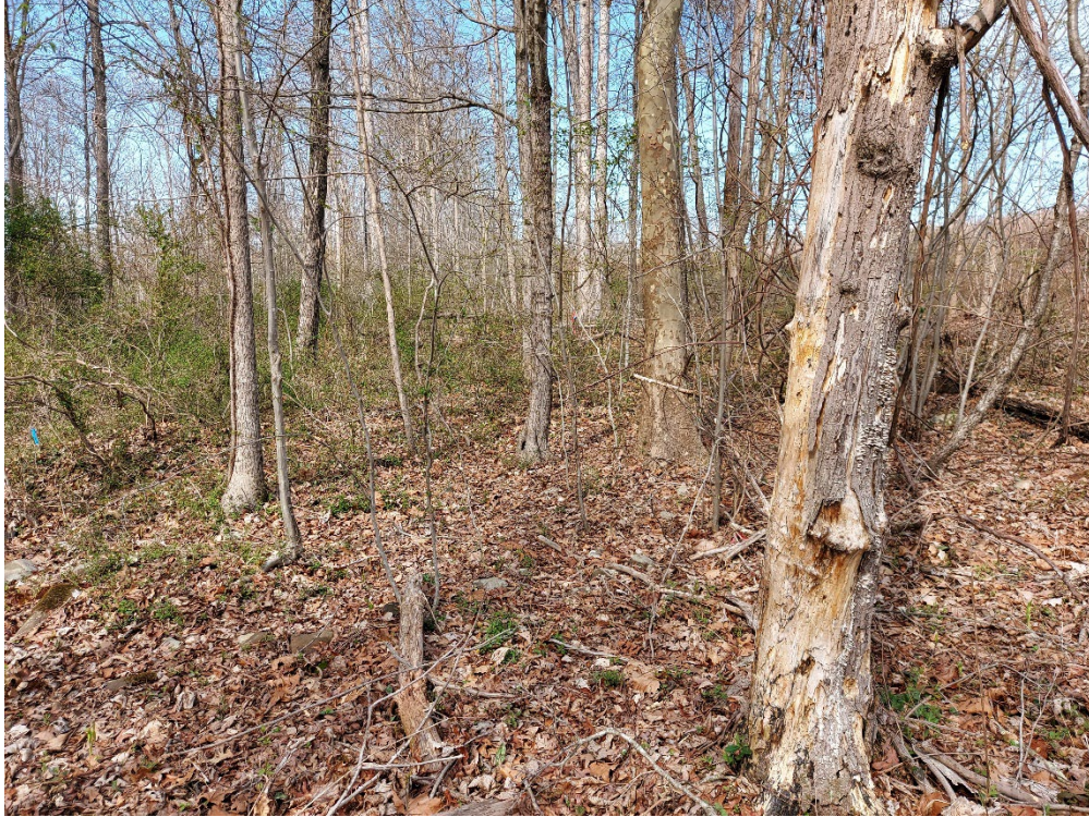
Location 14: Looking North Toward Wetland