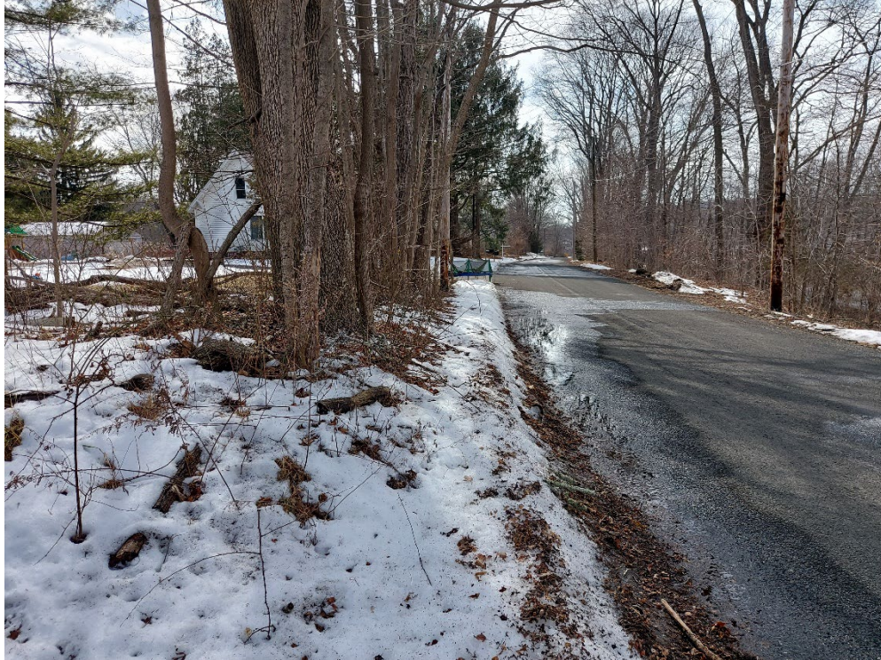
Location 1: Maple Road Looking at South Bound Lane