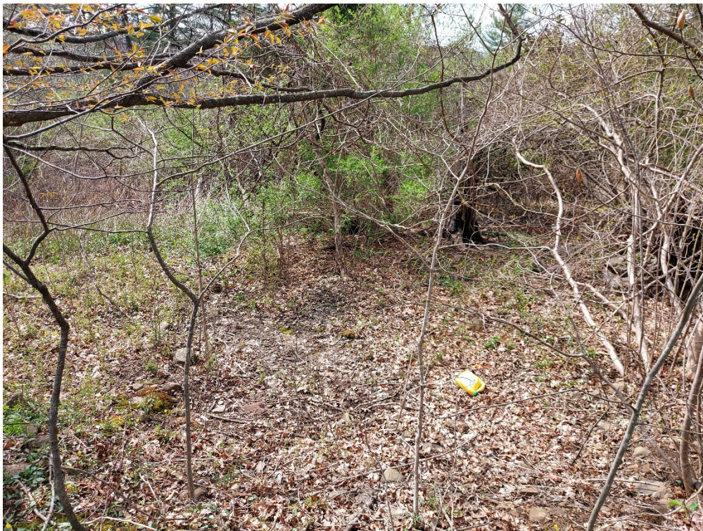
Location 13: Looking West Toward Wetland