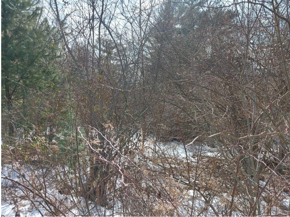
Location 4: Southern End of Stormwater Basin #2 Looking Southeast