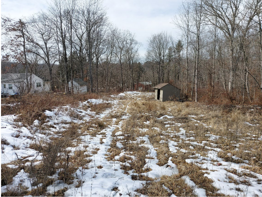
Location 3: Approximate Equipment Pad Area Looking West