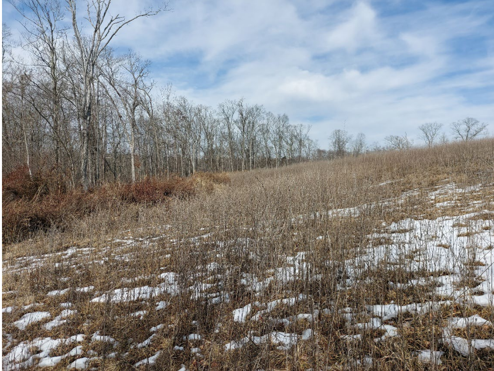
Location 2: Southern End of Stormwater Basin #1A Looking North