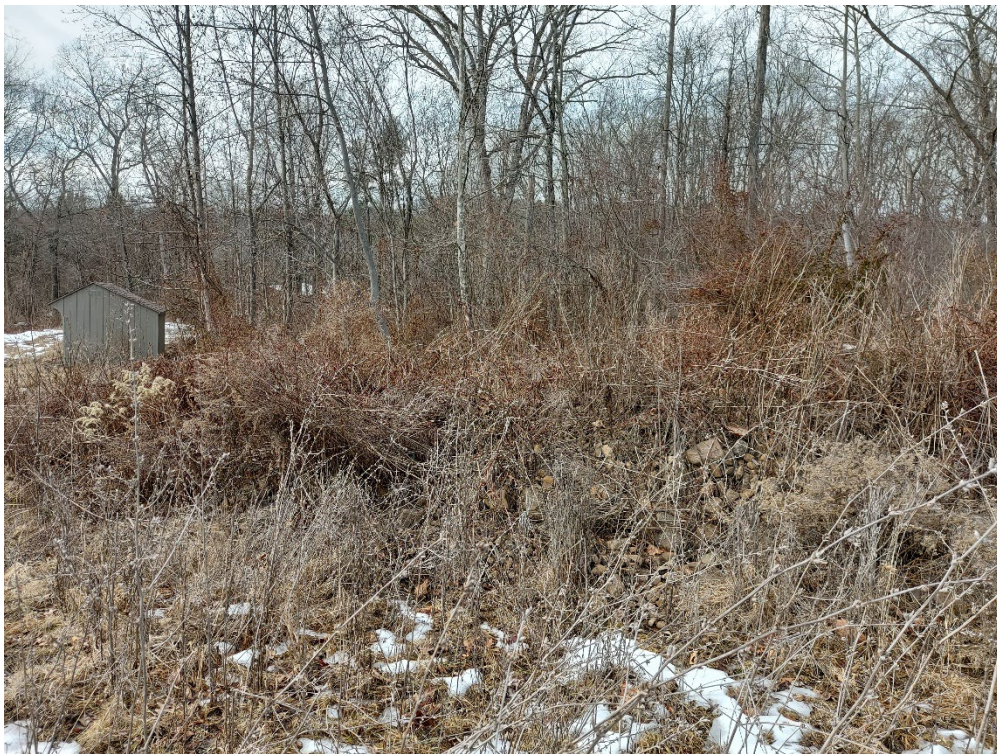
Location 11: Northern End of Stormwater Basin #1A Looking Toward Wetland