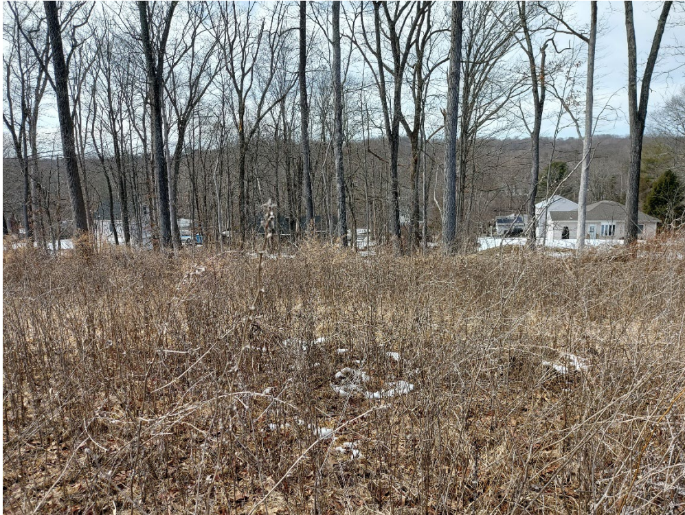
Location 10: Northern End of Stormwater Basin #1B Looking North