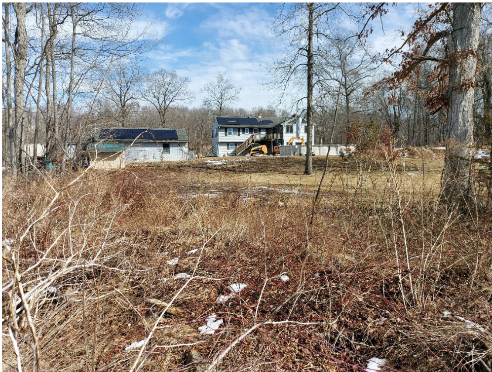
Location 7: Eastern Property Line at Approximate Topographic High Point Looking East