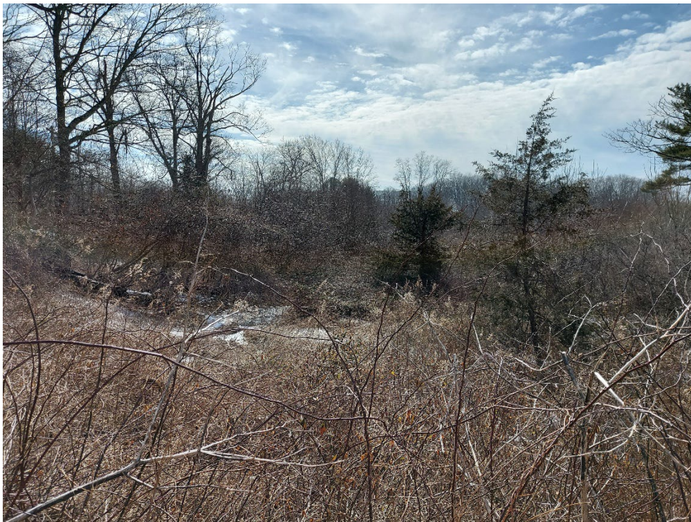
Location 5: Southern End of Array looking Southwest Toward West Pond Road