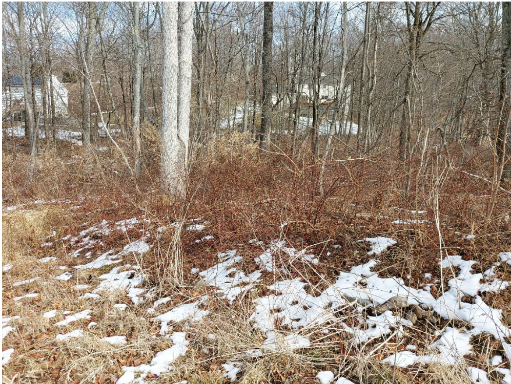
Location 8: Northeast Corner of Array Looking East