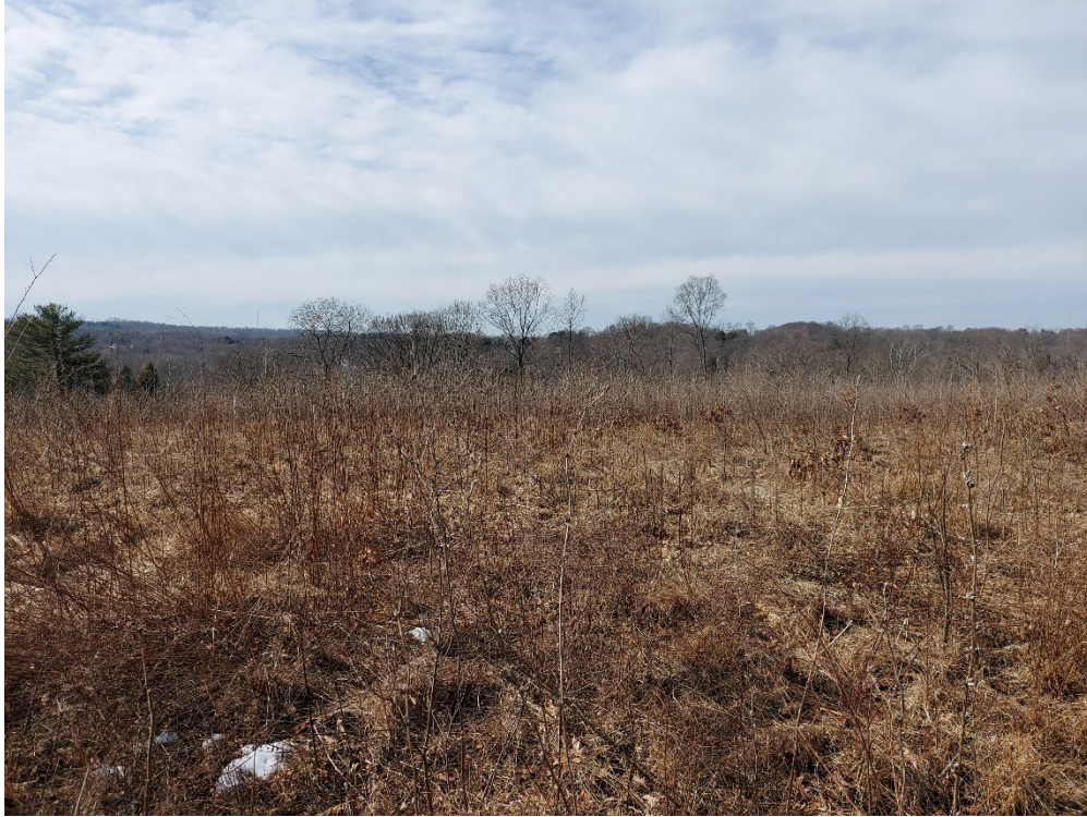
Location 7: Eastern Property Line at Approximate Topographic High Point Looking West Toward Array