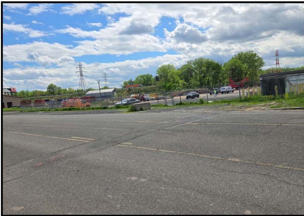
Site view from Brainard Road (southeast corner of the Project Site)