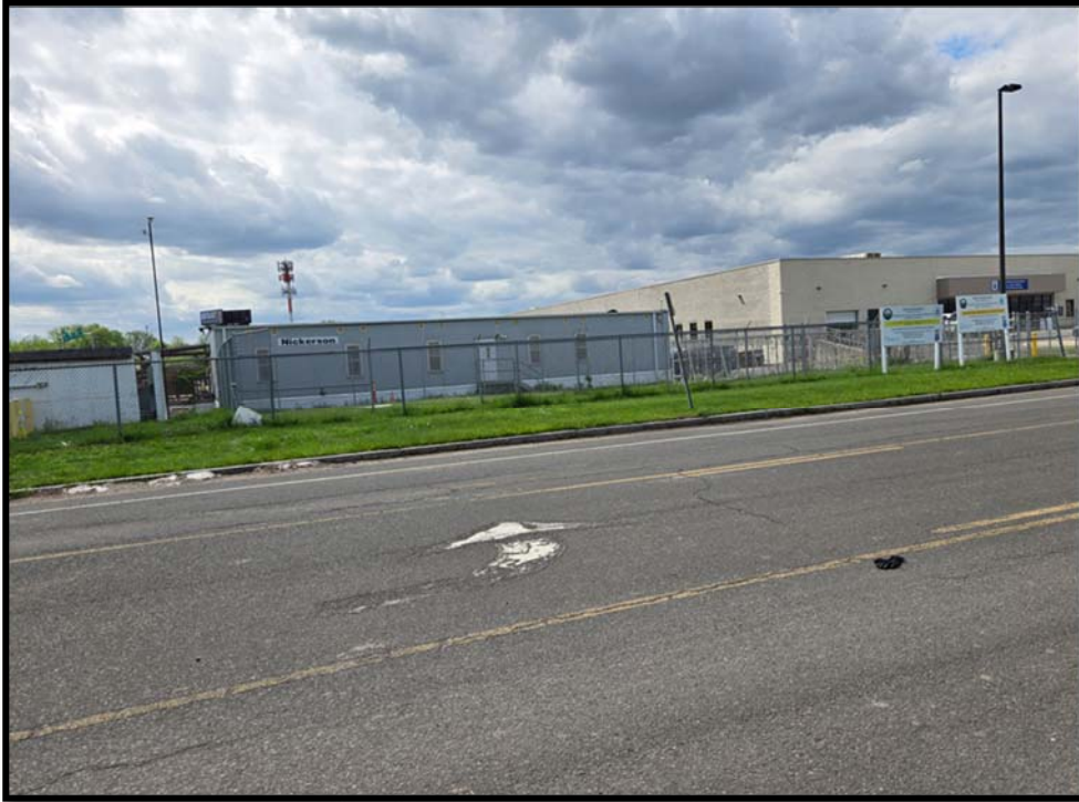
Site view from Brainard Road (northeast corner of the Project Site)