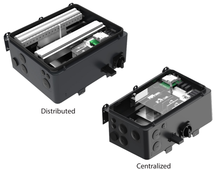
Enhanced DC Wire Boxes