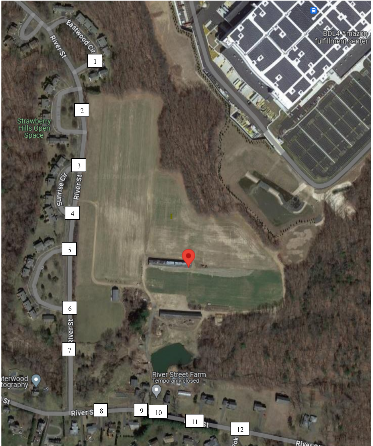
PHOTO LOCATION PLAN