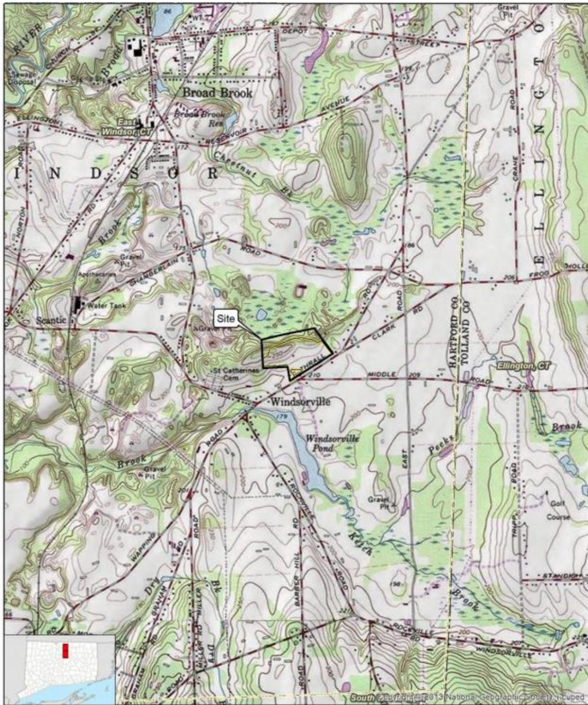
Figure 1 – Site Location