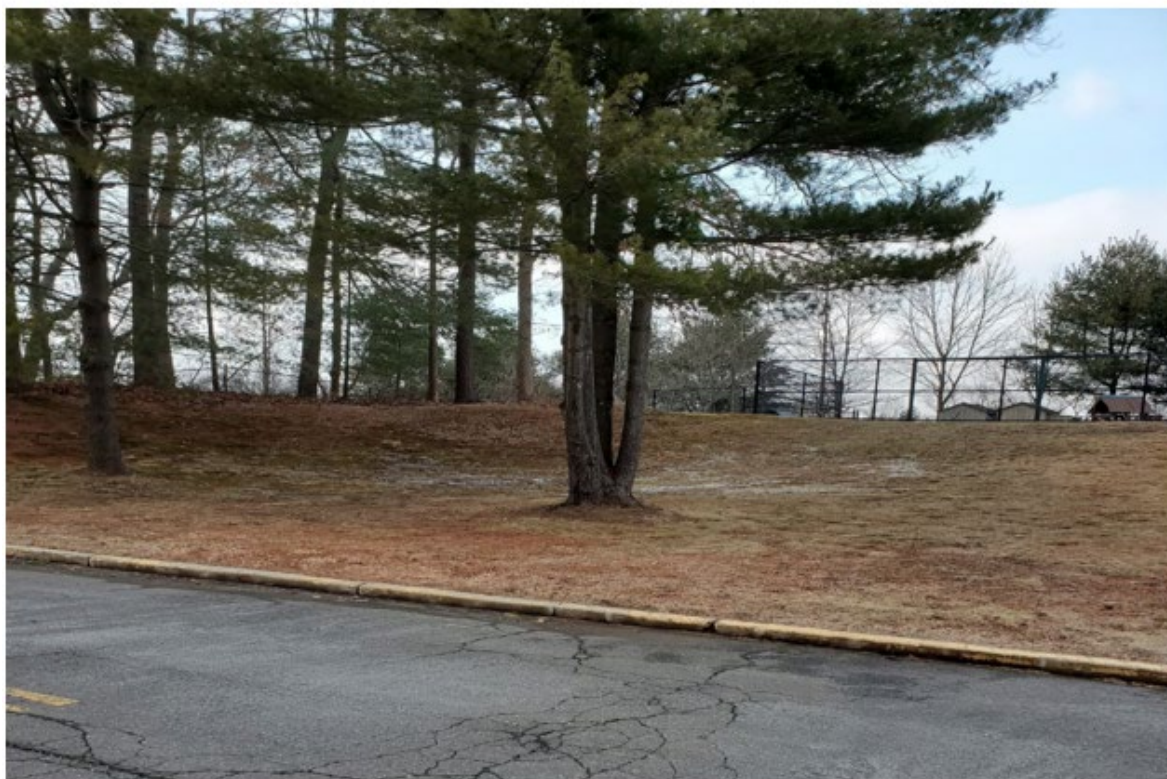
Looking north toward Facility location