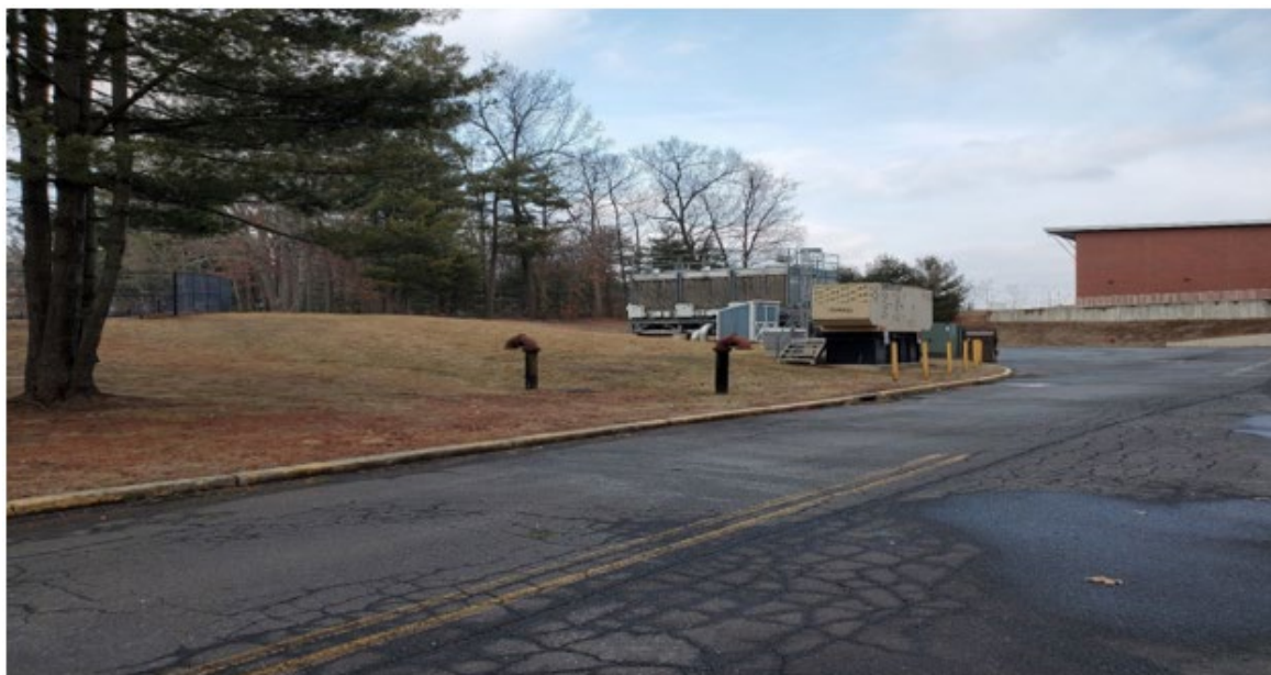
Looking east; Facility location at left