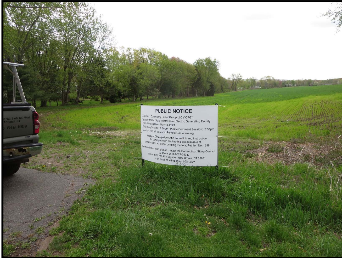
24 Middle Road in Ellington, Connecticut (at the northeast corner of the Project site)