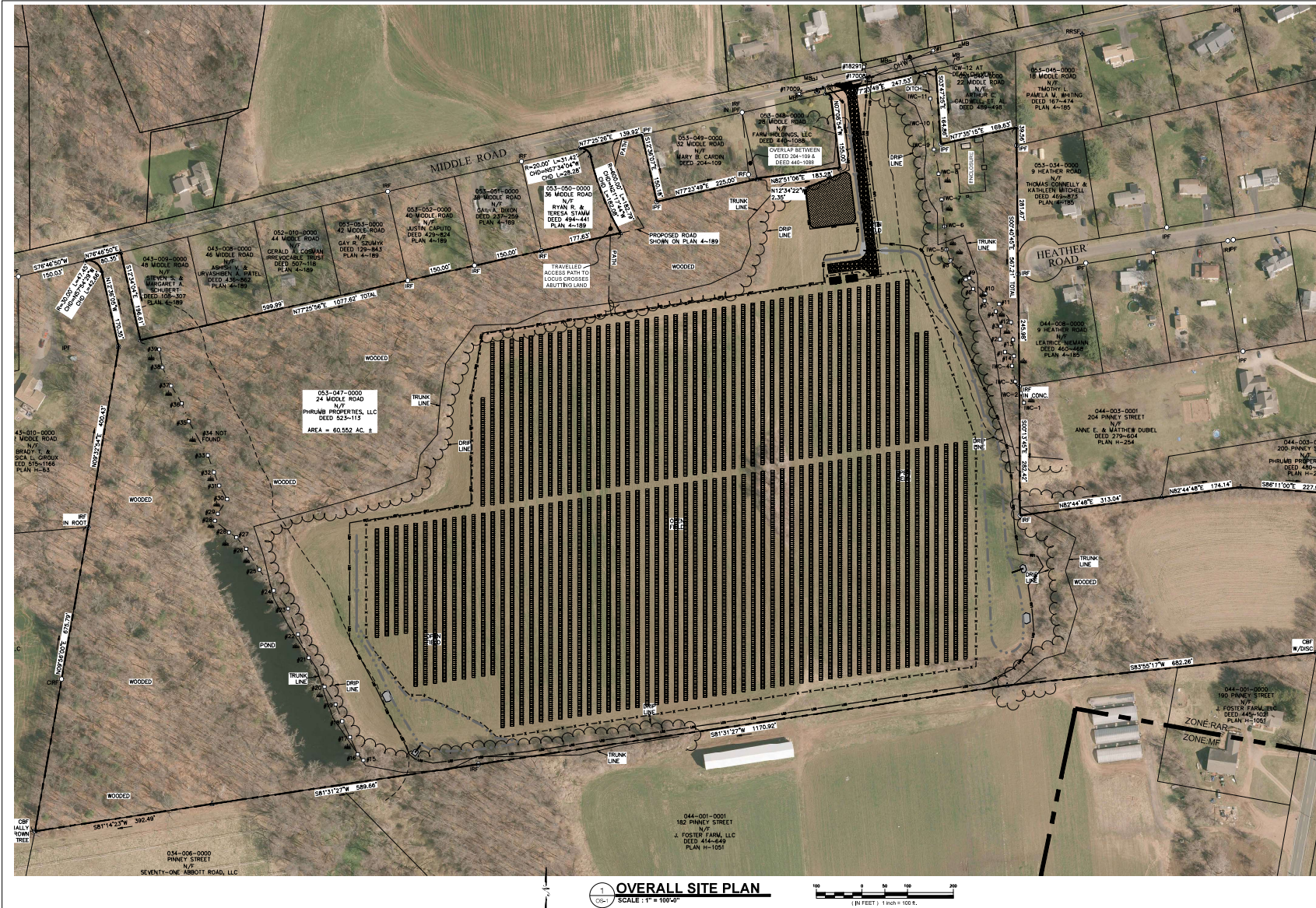
OVERALL SITE PLAN SCALE: 1" = 100'-0"

COMMUNITY POWER GROUP 5636 CONNECTICUT AVE #42729 WASHINGTON, DC 20015 (202) 844-6423