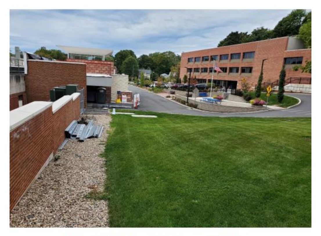
Looking west toward Goodwin Street; Facility location in foreground