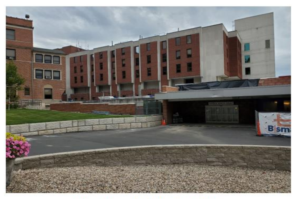
Looking southeast toward Facility location at left of photo