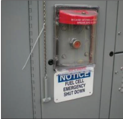
Figure 1: Emergency Power Off Button