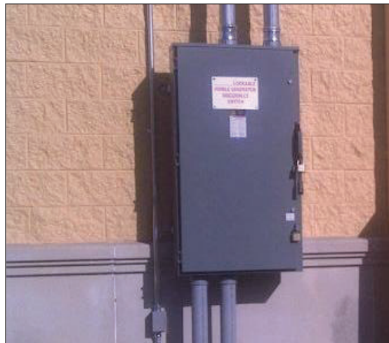
Figure 2: Electrical Disconnect