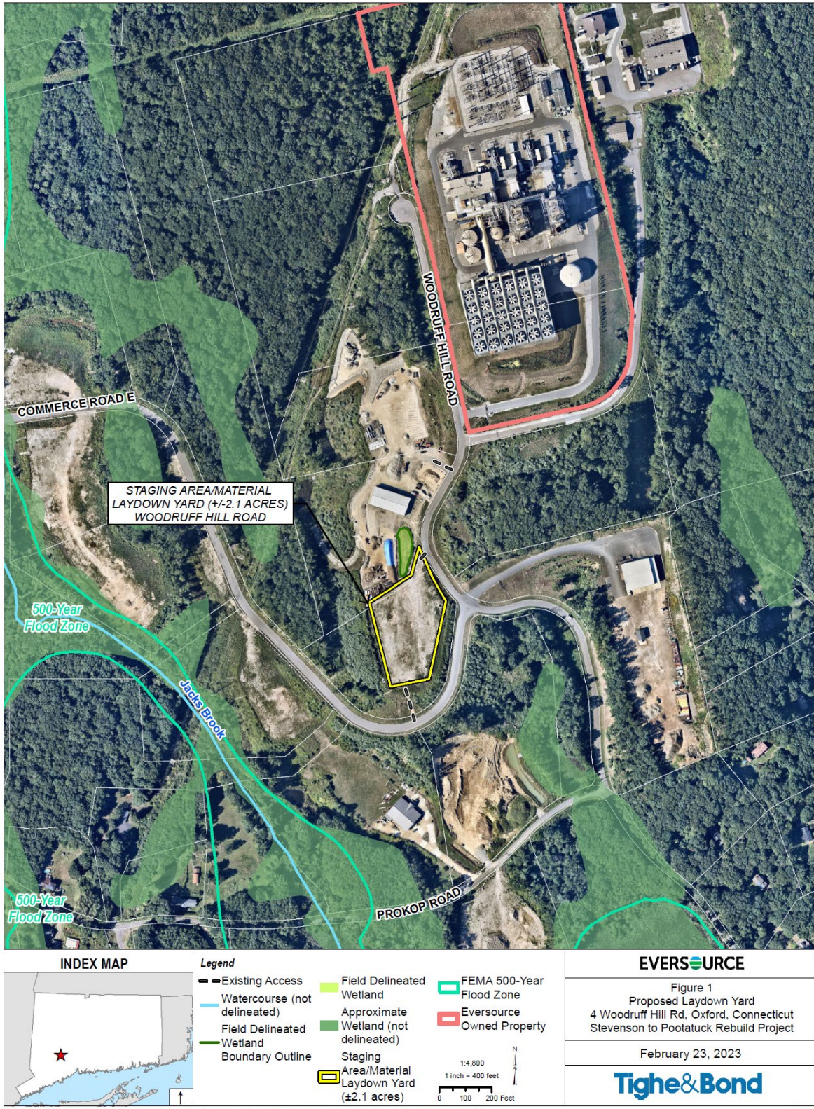
Figure 1: Staging Area/Laydown Yard, 4 Woodruff Hill Road in Oxford (approximately 2 acres)