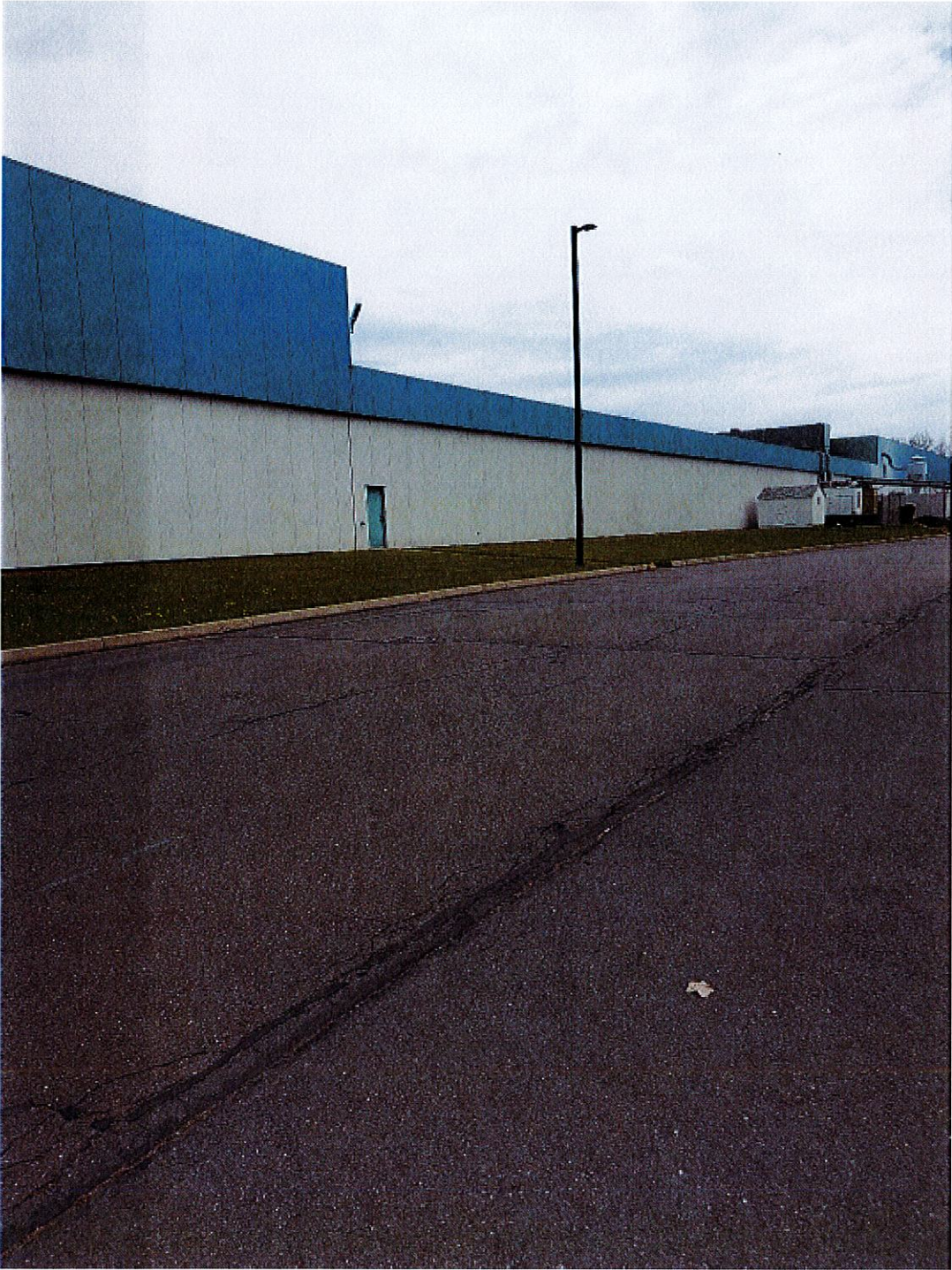
Looking northeast toward Facility location