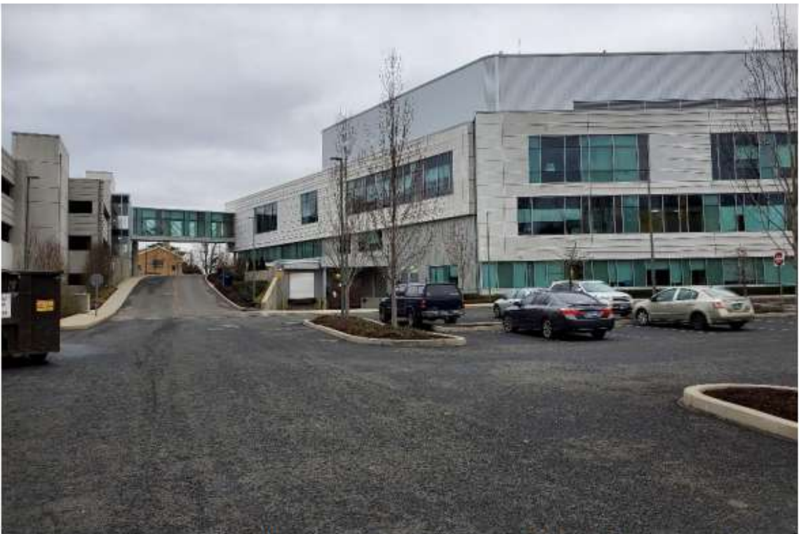
Looking west toward Facility location at center of photo (to right of trees); building in background.