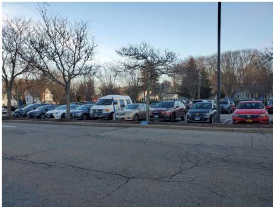
Looking toward Site from front of Emergency Department entrance