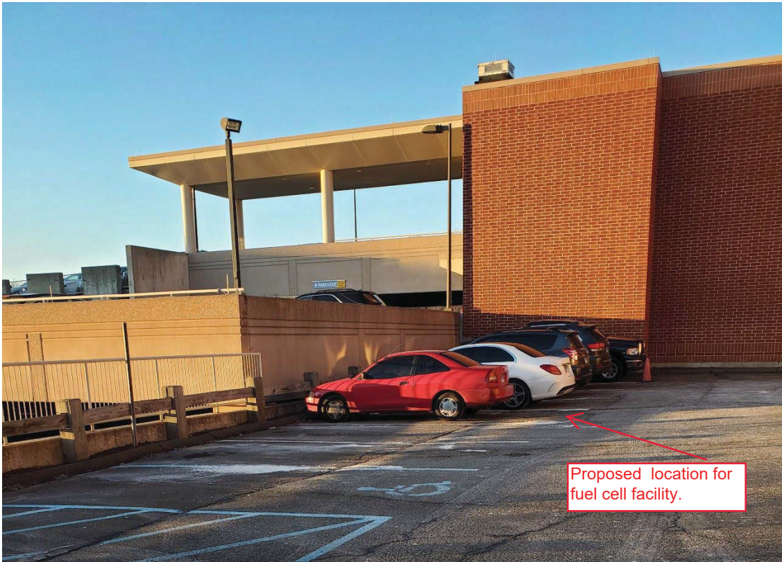
Proposed location for fuel cell facility.