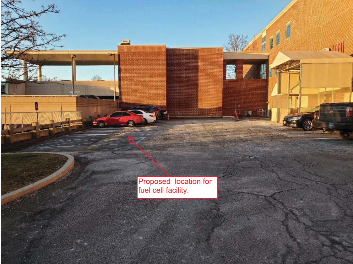
Proposed location for fuel cell facility.