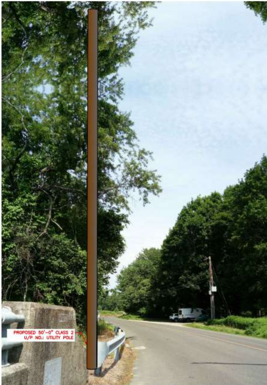
Figure 3. Simulation of the proposed facility with Existing conditions.