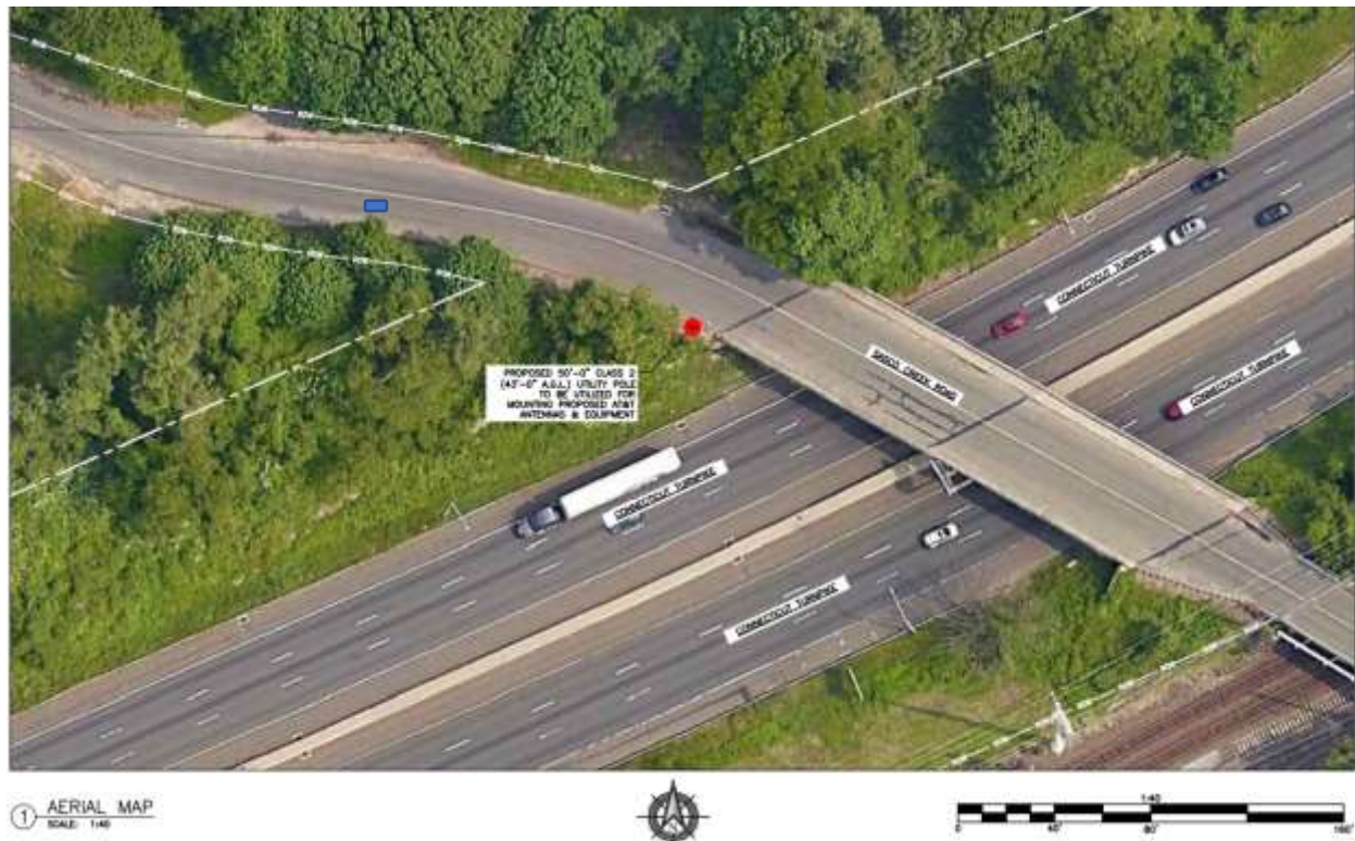
Figure 1. Aerial view of the Proposed site location.