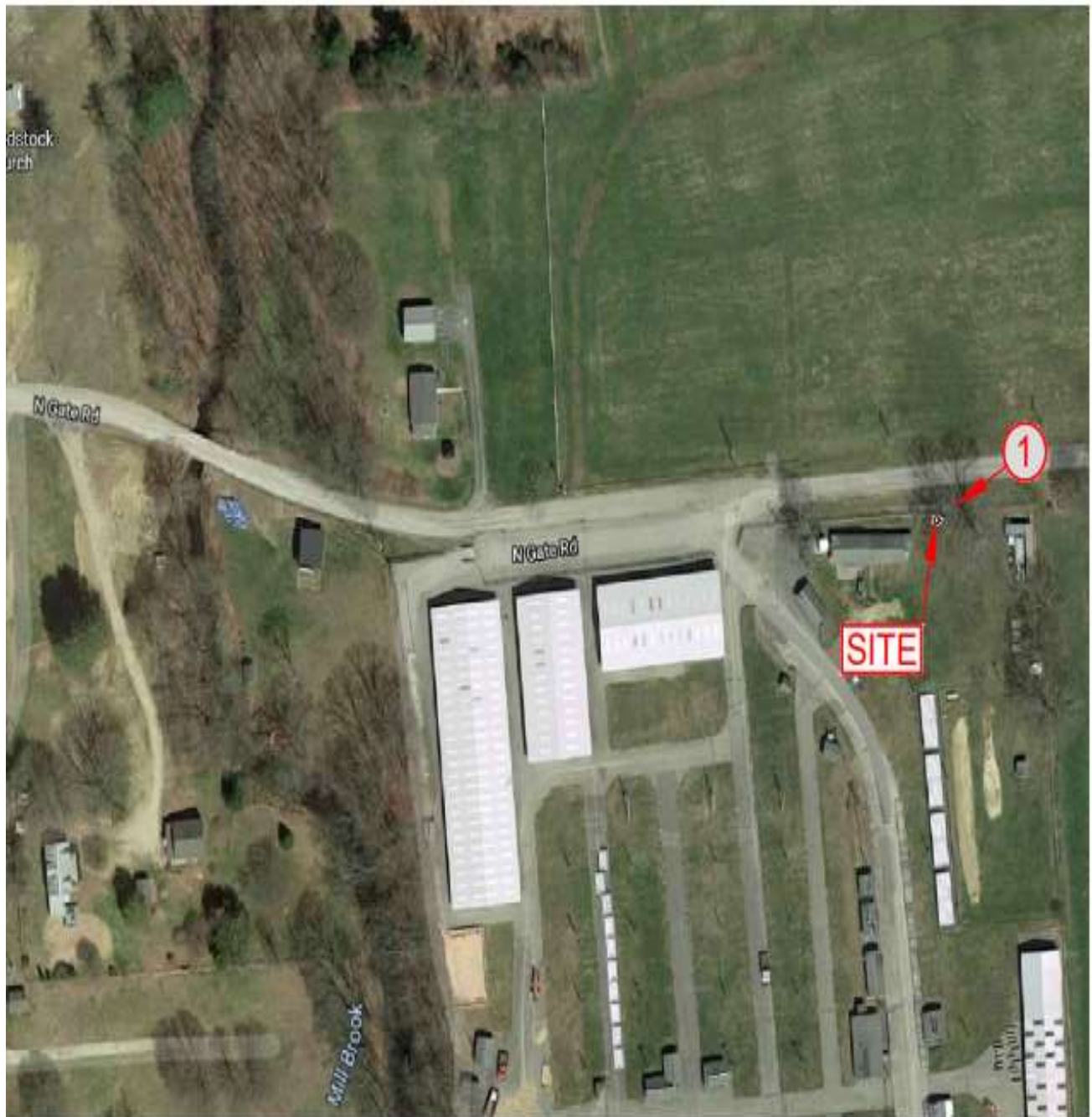
Figure 1. Proposed Site Location