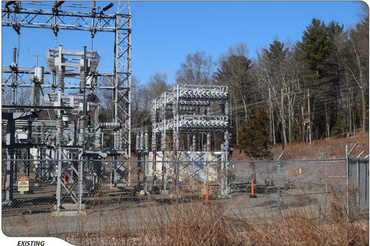
Figure 2. View of existing location.