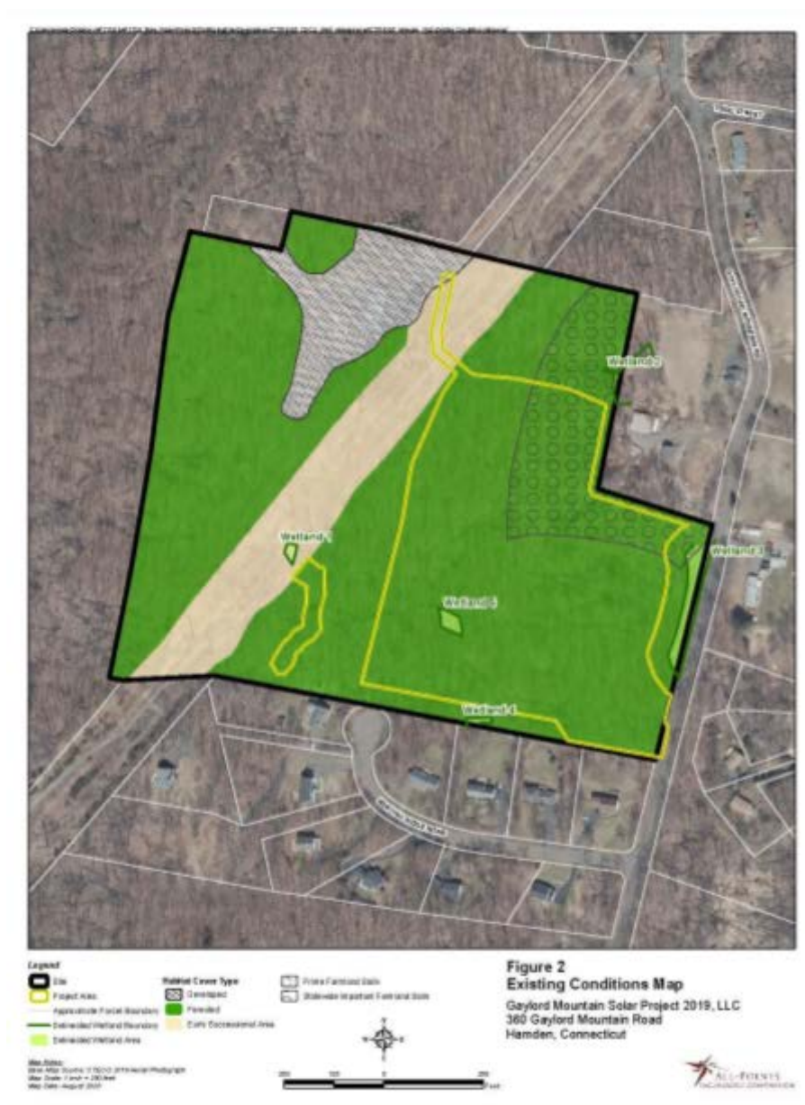
Figure 2. Existing Conditions