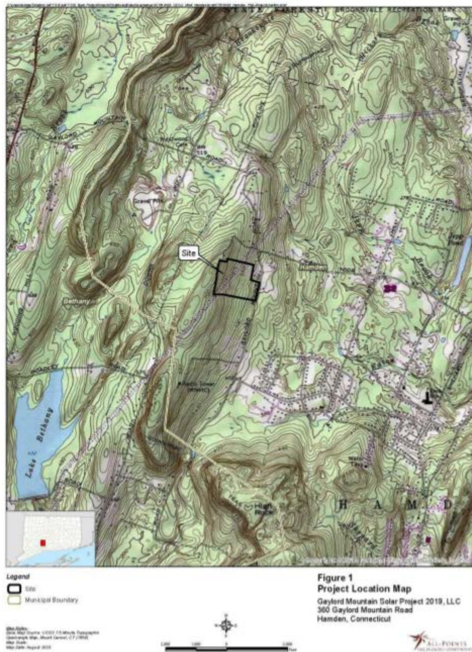
Figure 1. Proposed Project Location