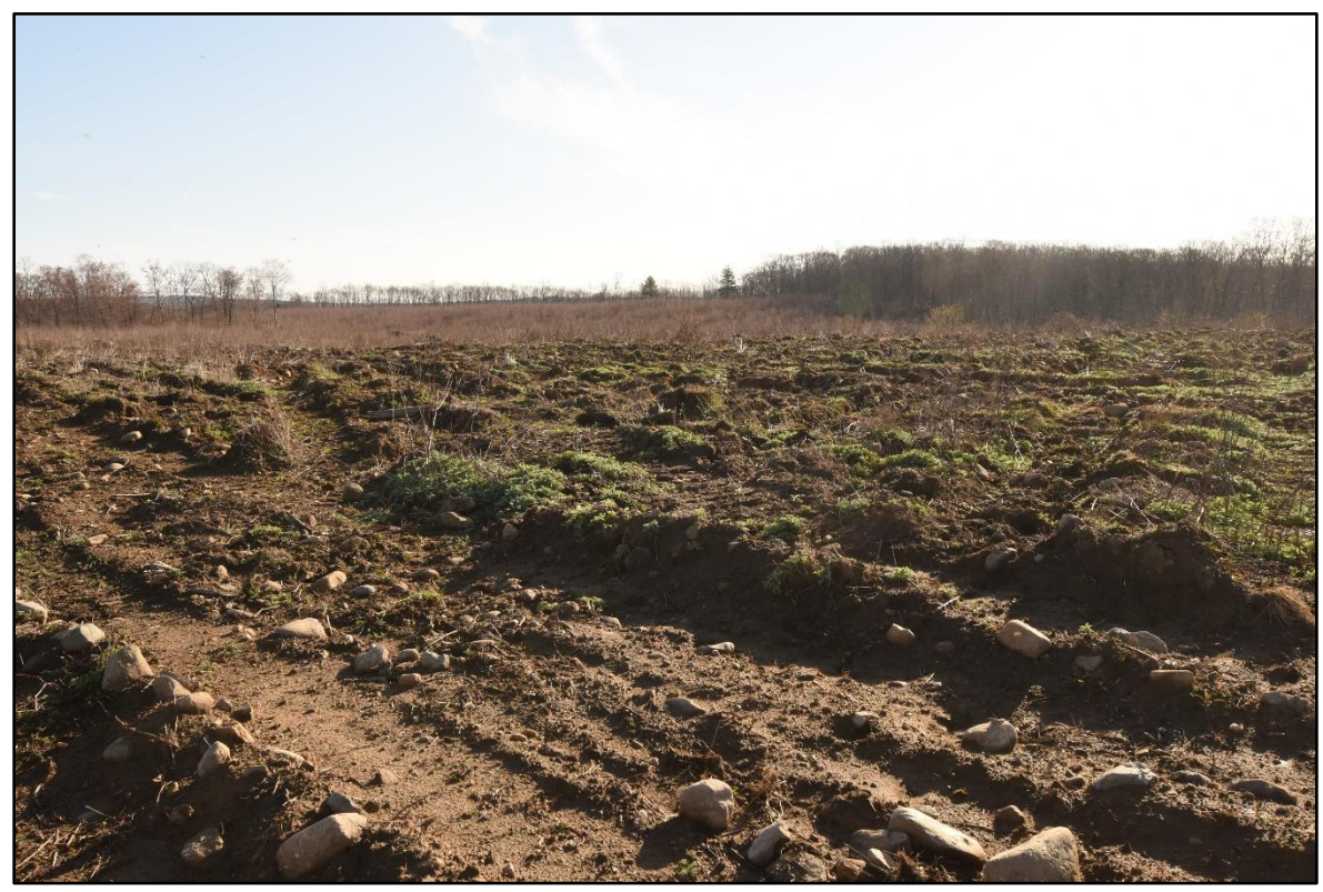
Photo B. Looking northeast approximately midway through cleared conservation easement.