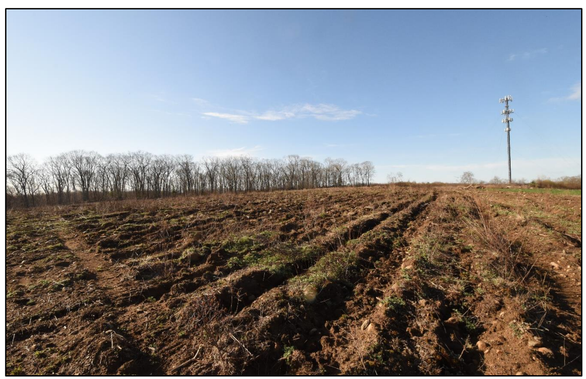
Photo A. Looking southeast approximately midway through cleared conservation easement.