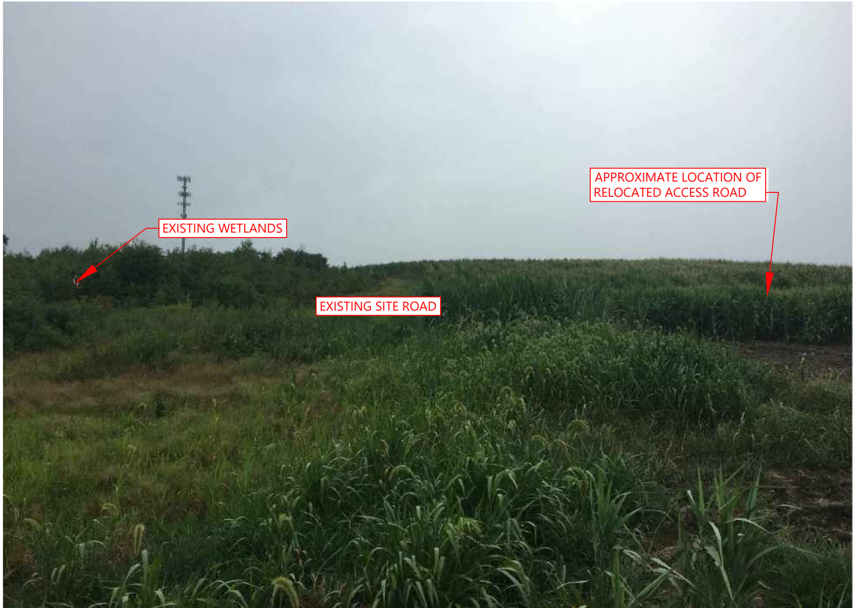
Photo 3 Relocated Site Entrance