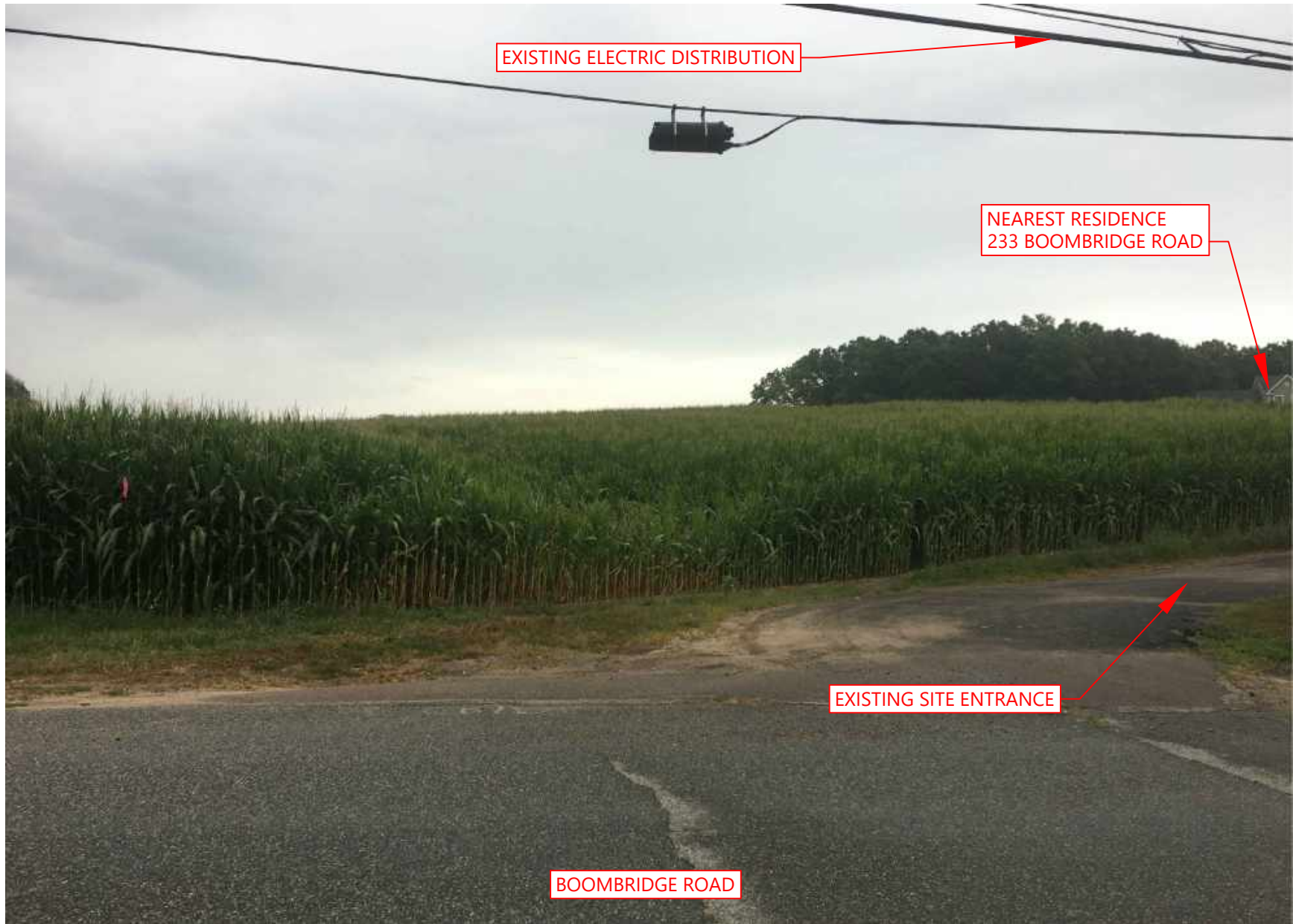
Photo 1 Boombridge Road Site Entrance