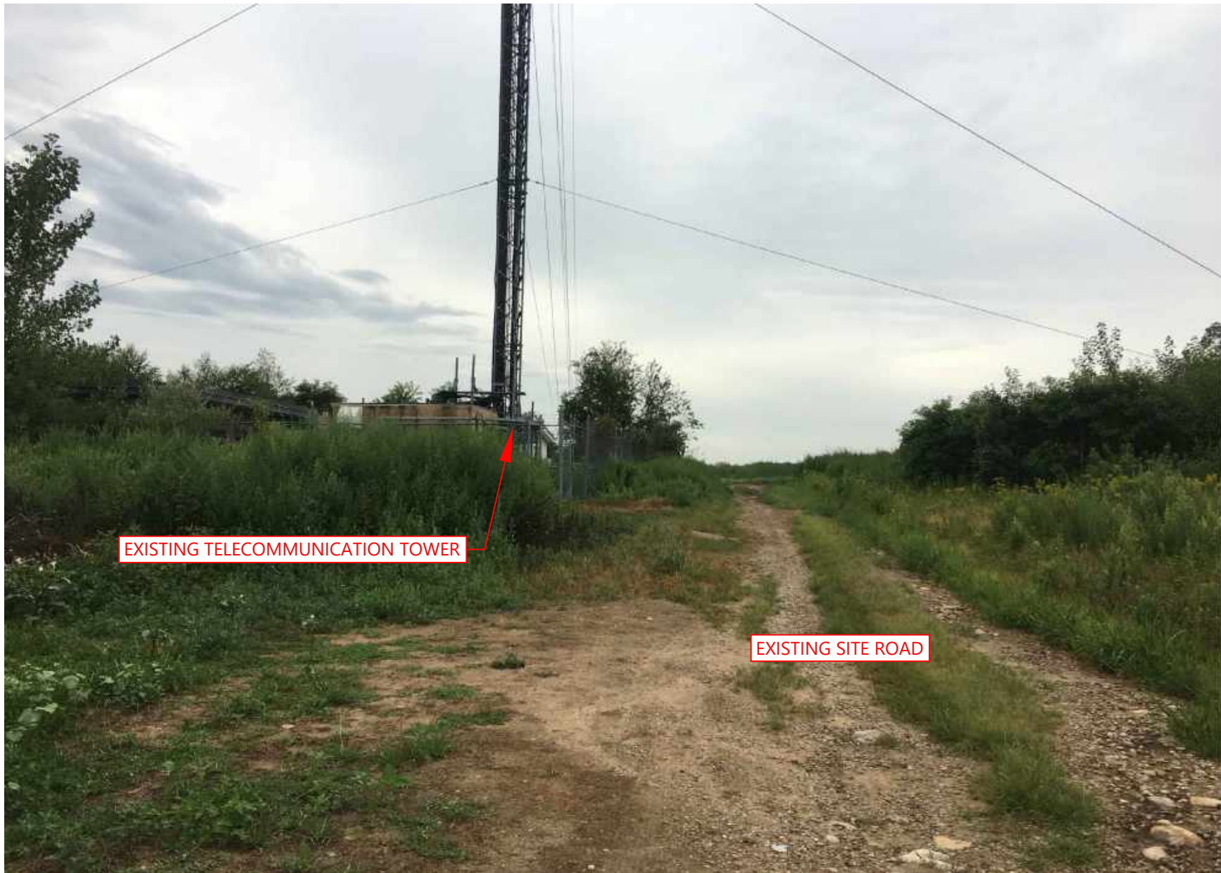
Photo 2 Existing Farm Road To Site Looking North