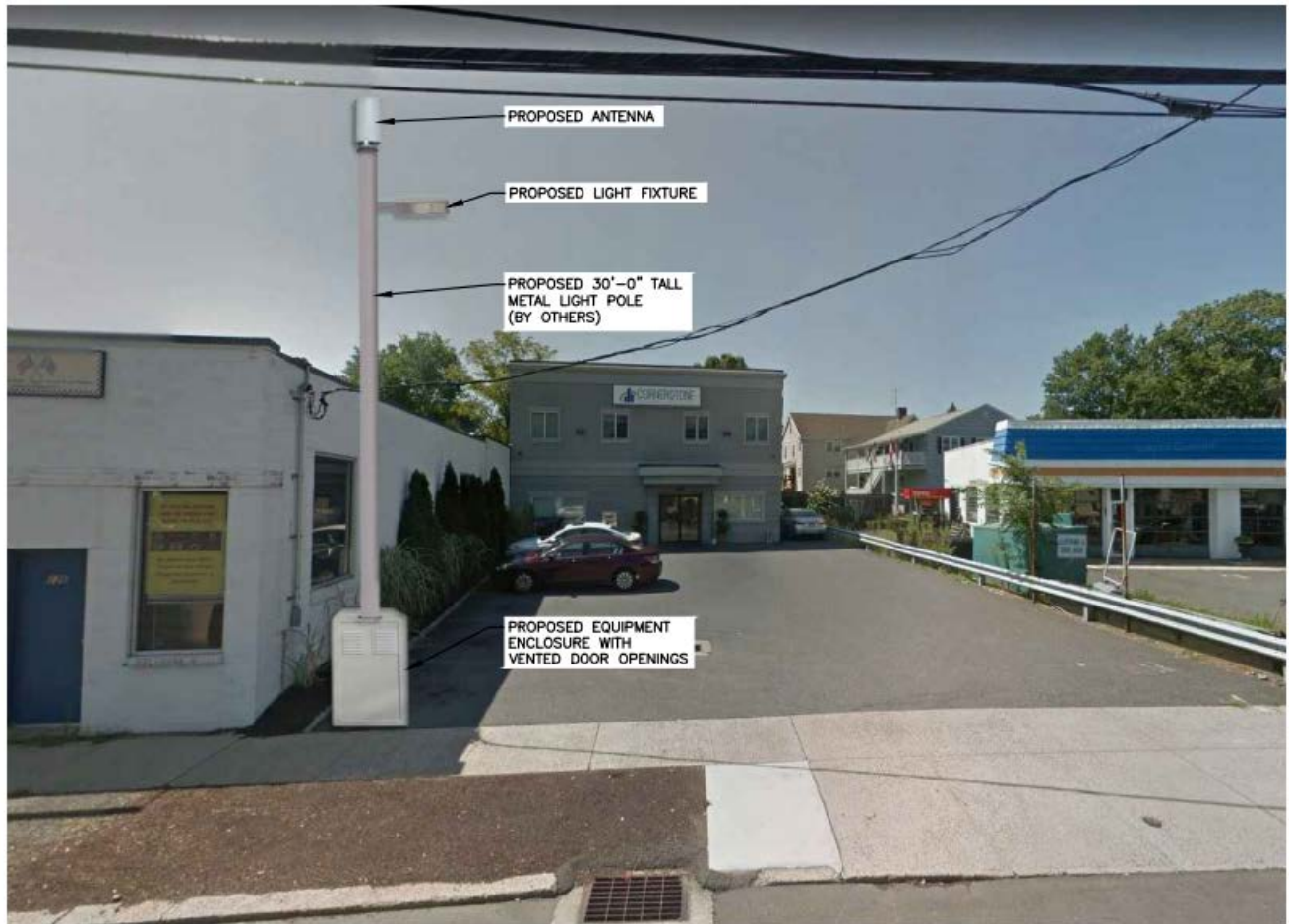
VIEW WEST FROM HOPE STREET