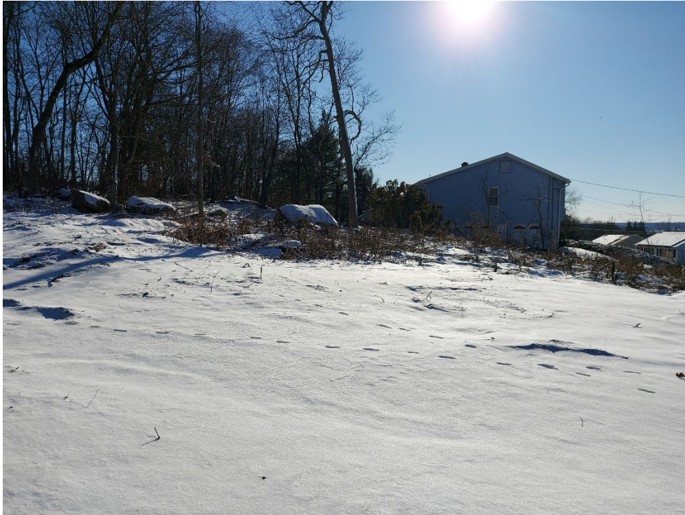
Location 22: Approximate Southeast corner of Array Looking South