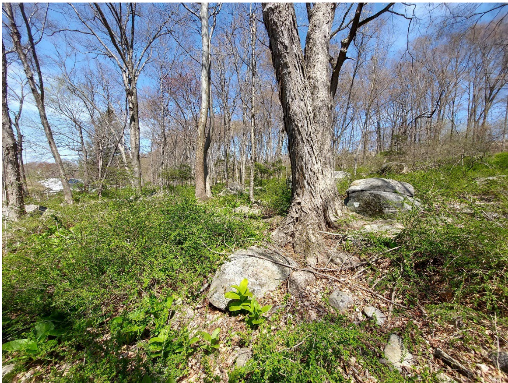
Location 3: Looking Northeasterly From Bottom of Slope