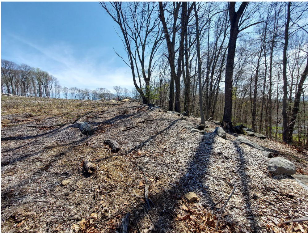
Location 10: Stormwater Management Basin #2 Looking South