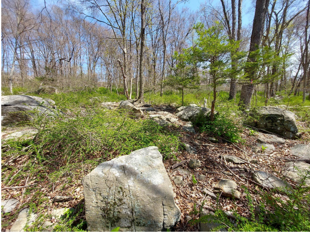
Location 4: Looking East Towards Shortell Drive