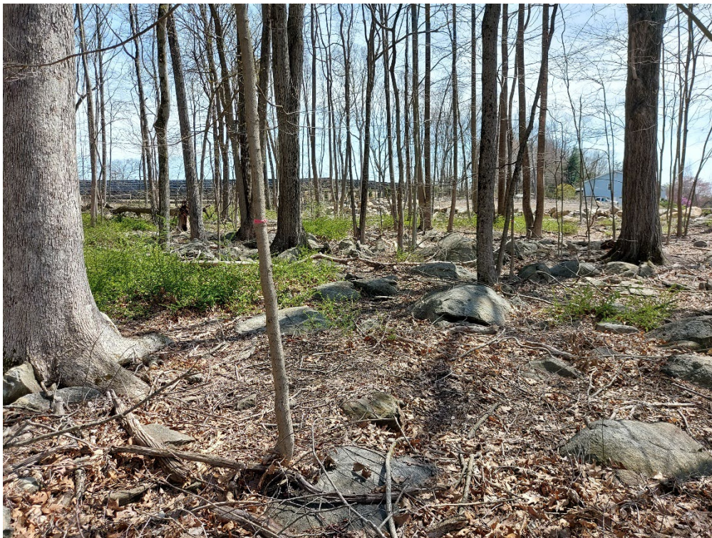
Location 12: Edge of Existing Clearing Limits Looking Southeasterly