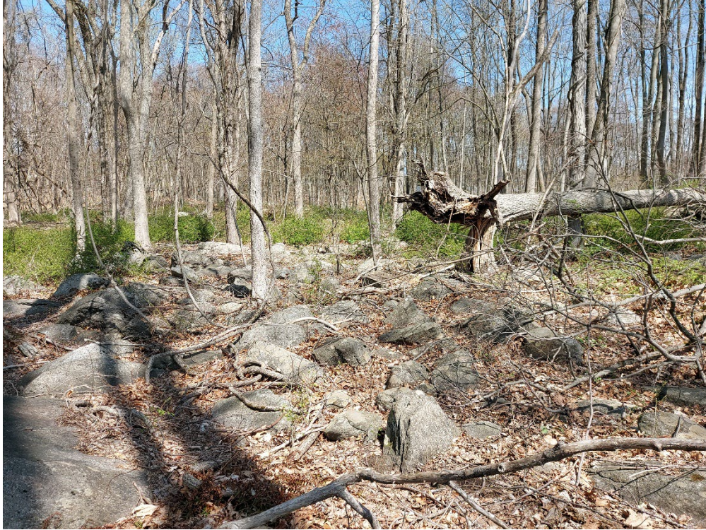
Location 13: Edge of Existing Clearing Limits Looking Northeasterly Toward Wetland