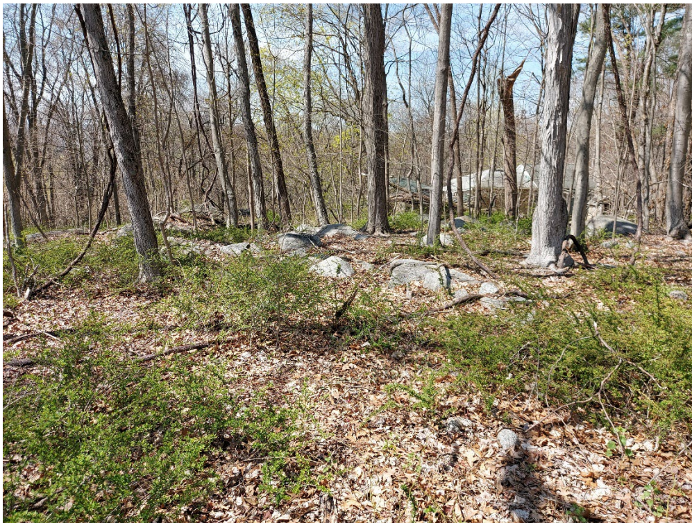
Location 8: Edge of Existing Clearing Limits Looking West