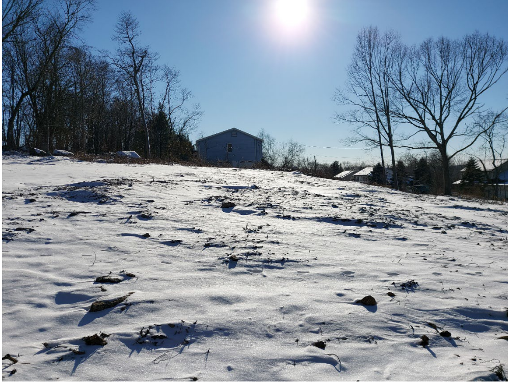
Location 18: Approximate Center of Array Looking South Toward Shortell Drive