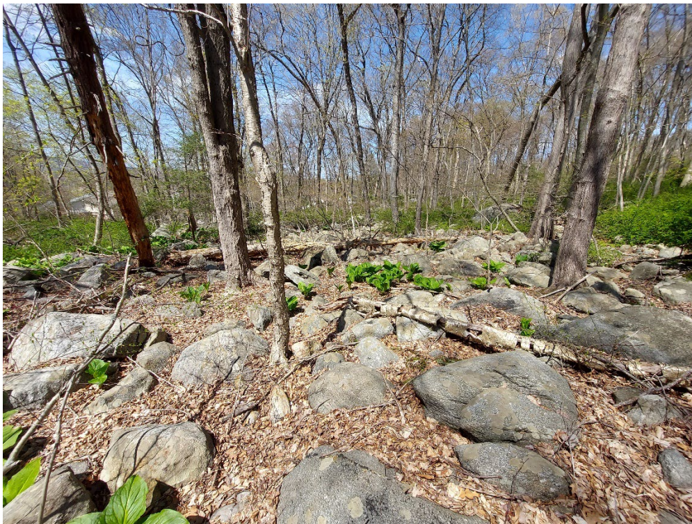
Location 2: Southwest Wetland Looking North