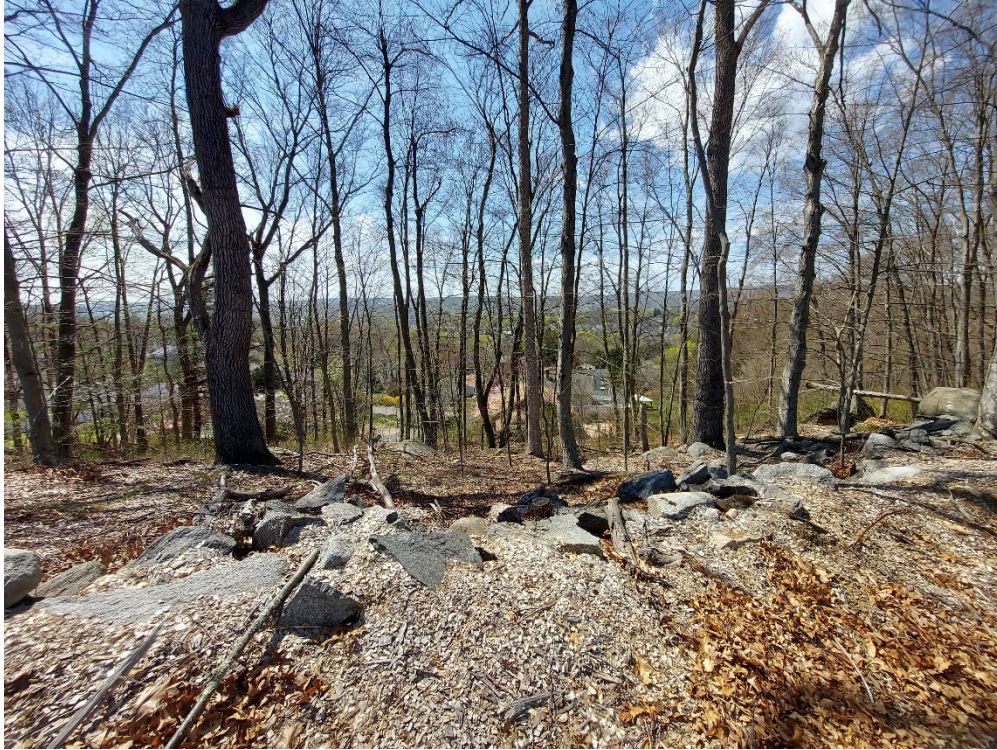
Location 7: Edge of Existing Clearing Limits Looking West Towards Hunters Lane