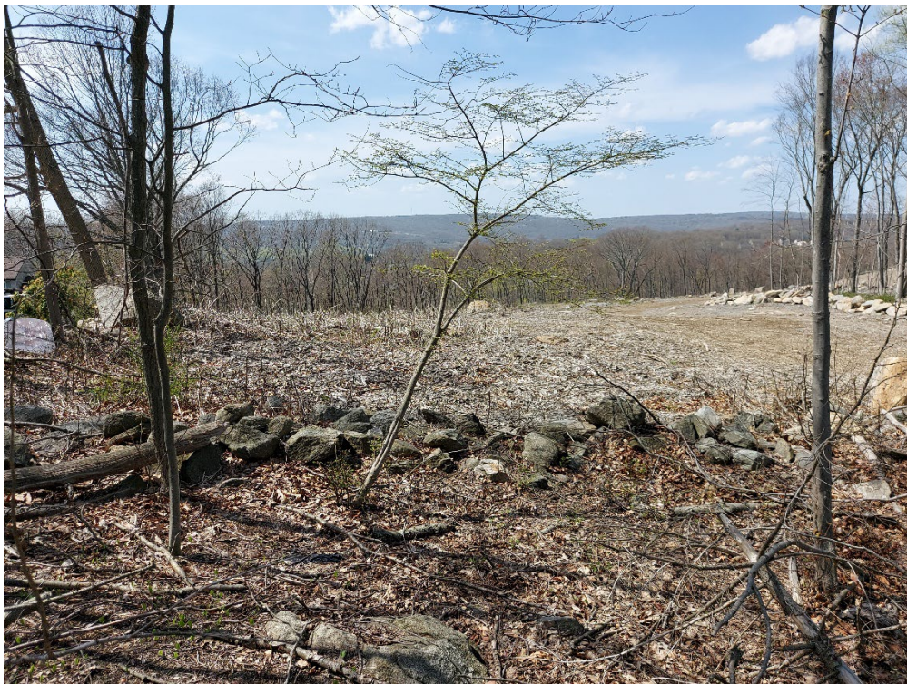
Location 17: Southeast Property Corner Looking West