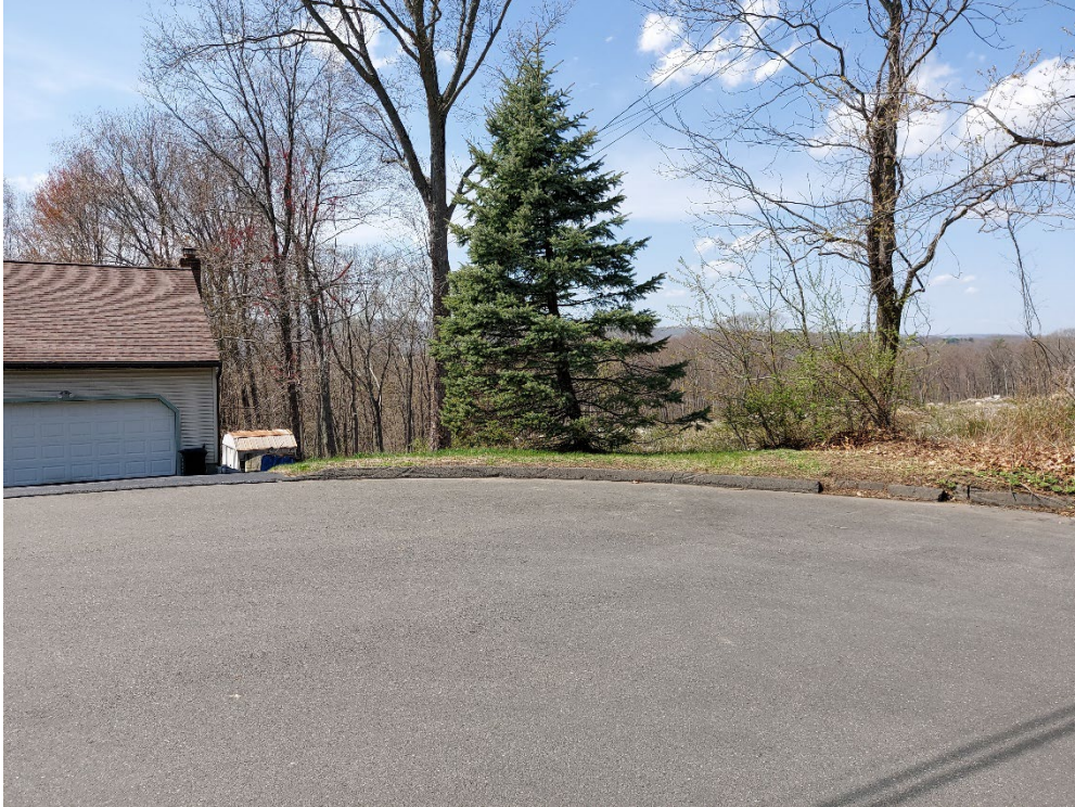
Location 1: Shortell Drive Looking West