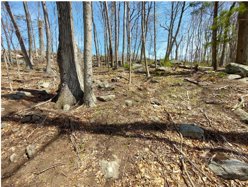
Location 5: Looking East From Bottom of Slope