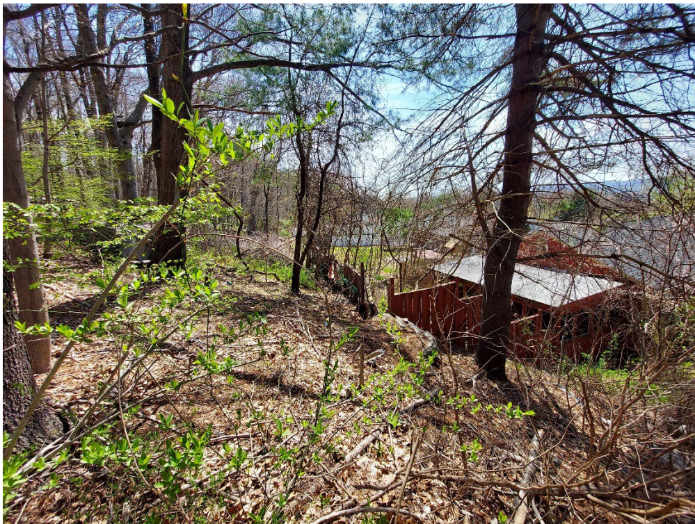
Location 6: Looking West Proximate to End of Hunters Lane