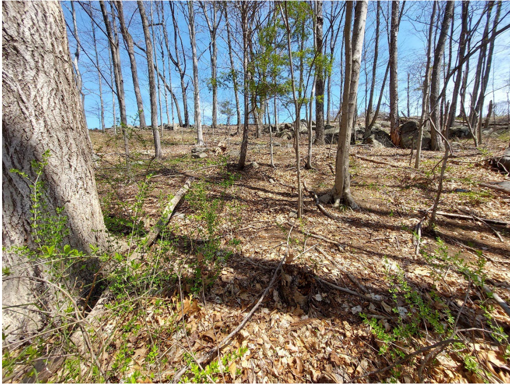
Location 6: Looking East Proximate to End of Hunters Lane