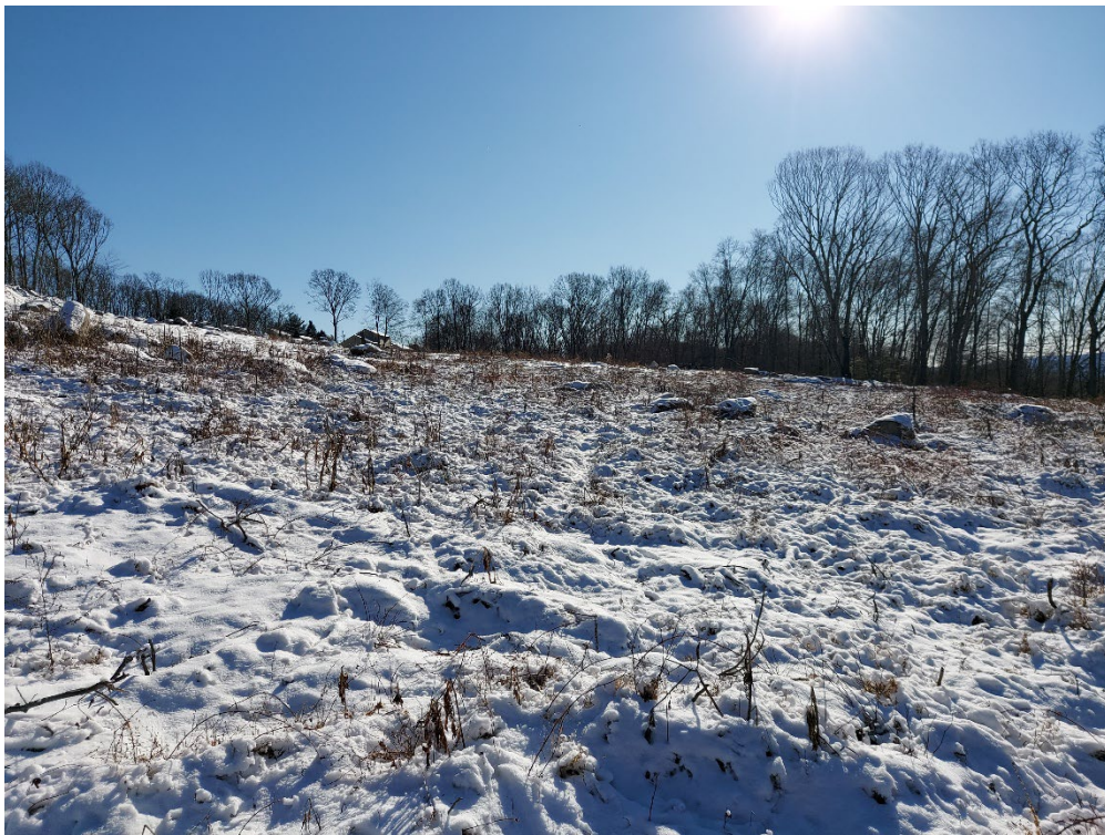
Location 19: Approximate Northwest Coner of Array Looking Toward Shortell Drive