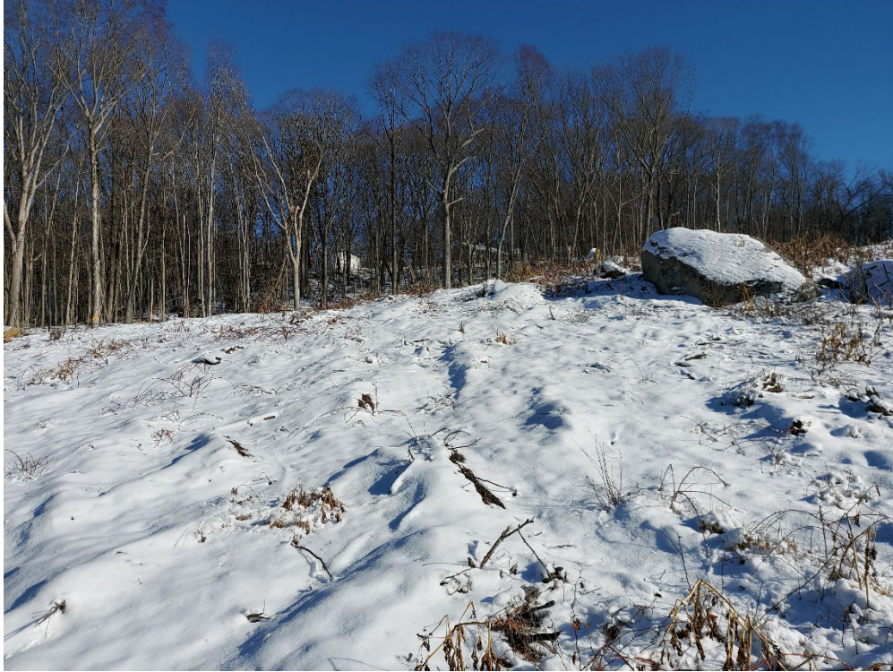
Location 20: Approximate Northeast Corner of Array Looking East