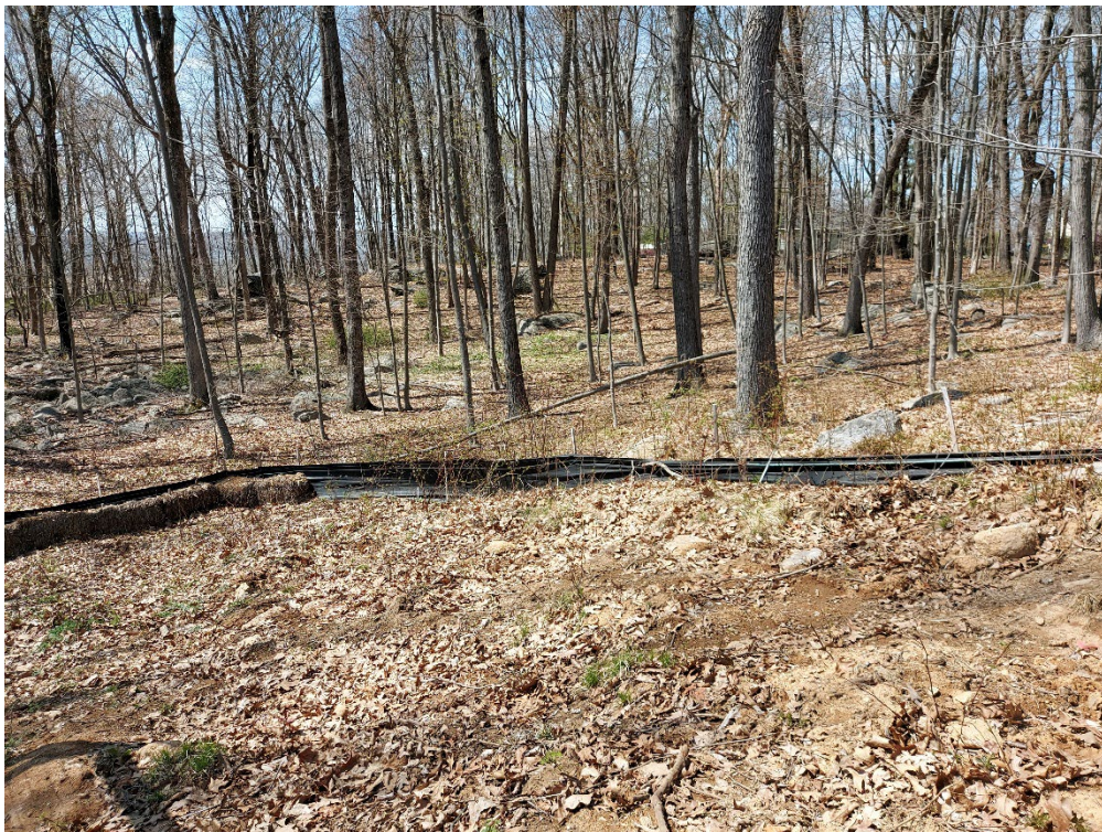
Location 16: Northeast Property Corner Looking West