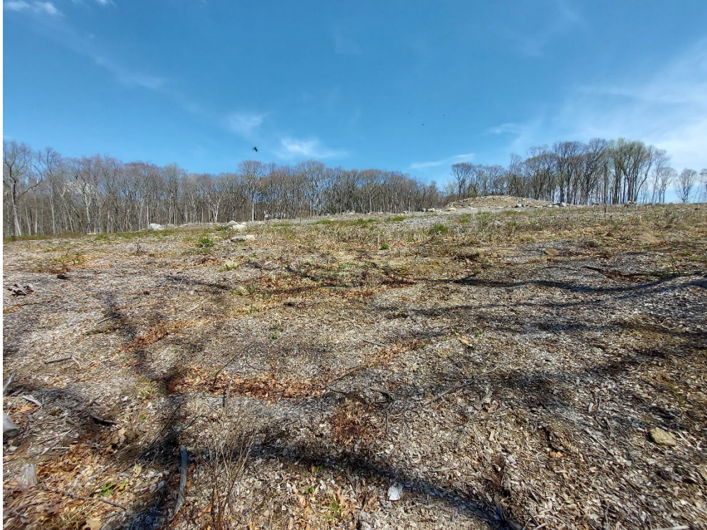
Location 9: Stormwater Management Basin #1 Looking East