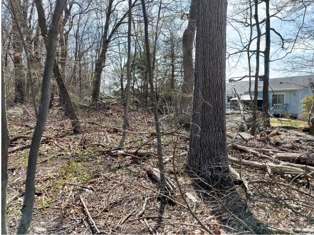
Location 17: Southeast Property Corner Looking South