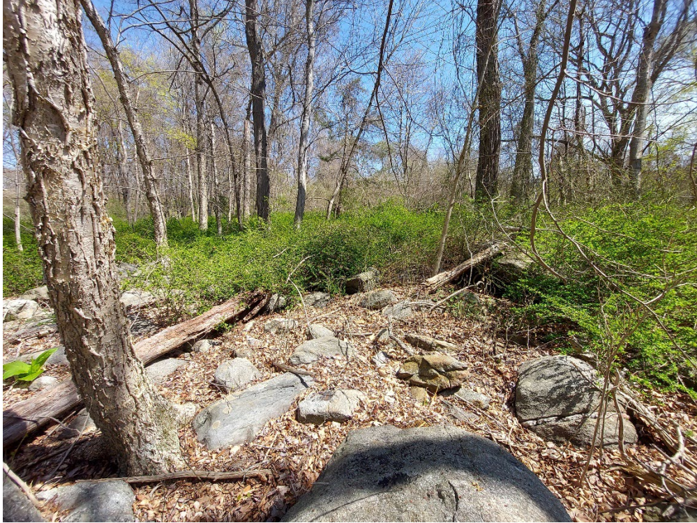
Location 2: Southwest Wetland Looking East