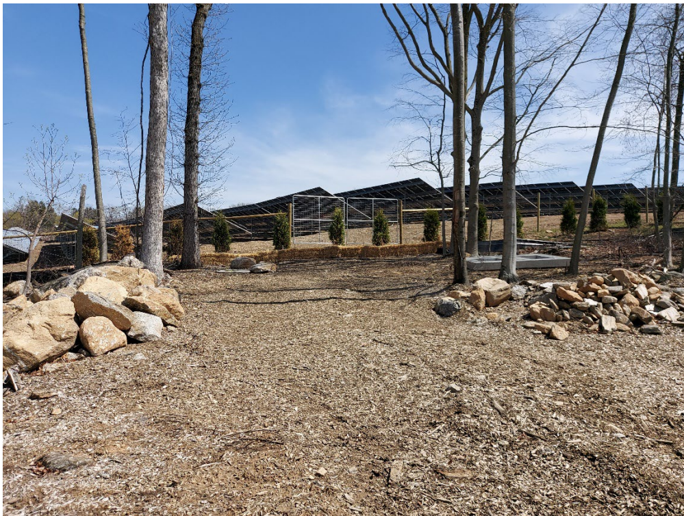
Location 14: Interconnection Route Looking East