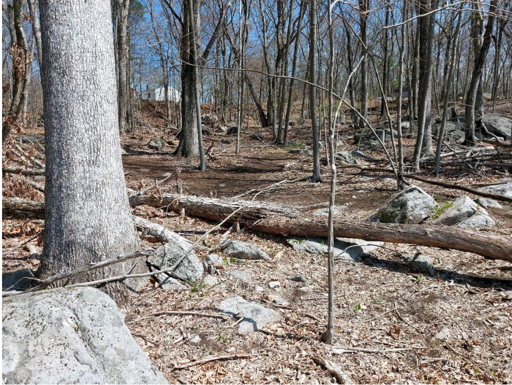
Location 11: Edge of Existing Clearing Limits Looking Southeasterly