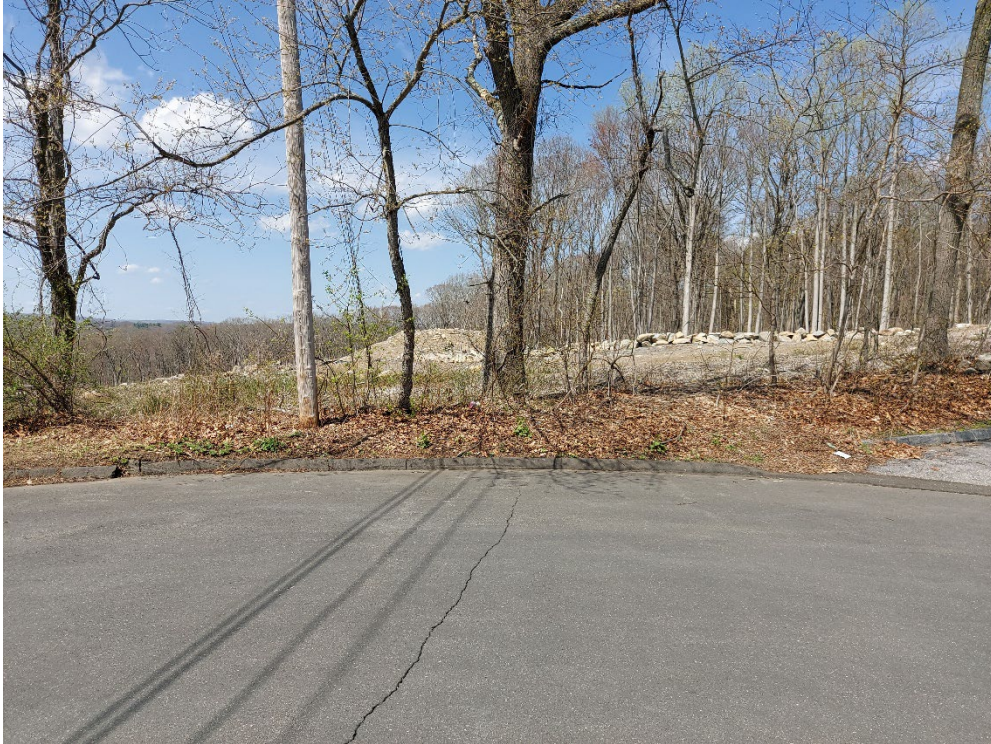
Location 1: Shortell Drive Looking North Into Project Site and Proposed Access Location