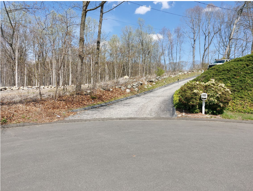
Location 1: Shortell Drive Looking East