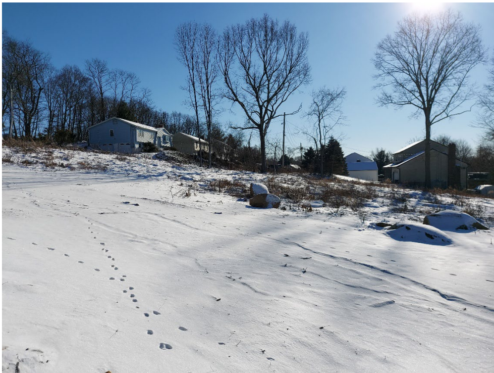
Location 21: Approximate Equipment Pad Location Looking Toward Shortell Drive