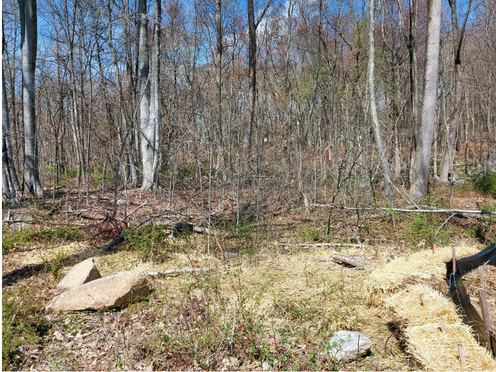
Location 15: Benz Solar Looking Northwesternly