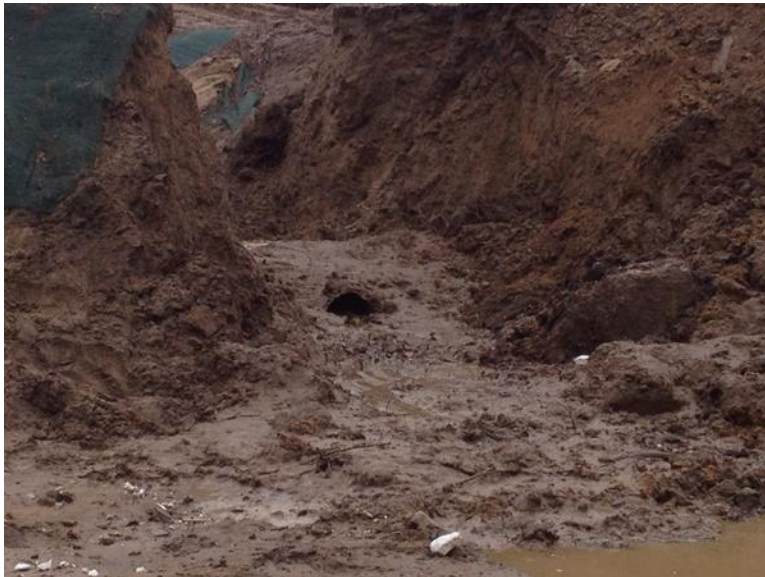
Figure 2 - Failure of Stormwater Basin Berm