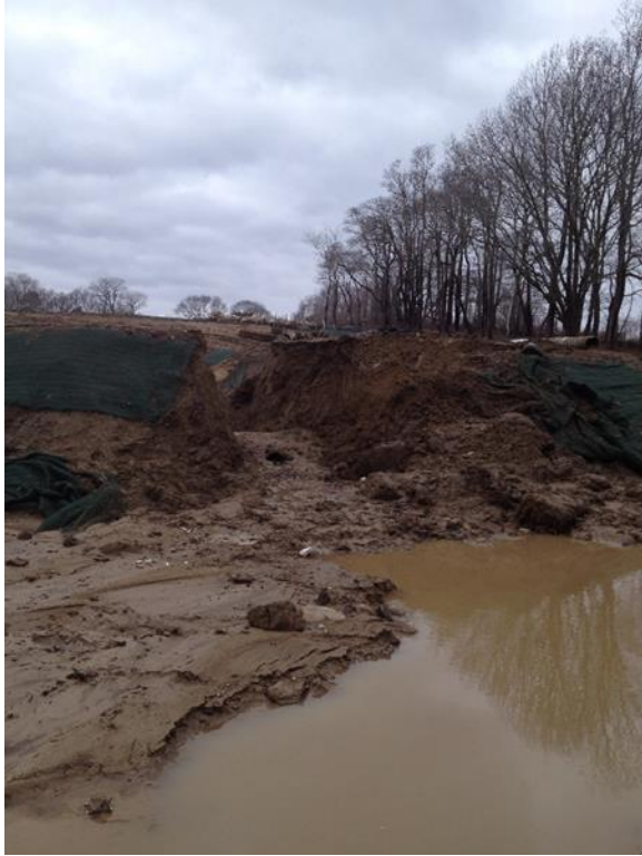
Figure 3 - Failure of Stormwater Basin Berm