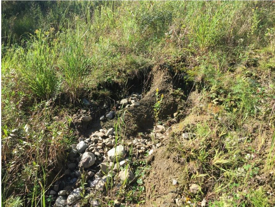
Figure 8 - Erosion of stormwater basin slope from concentrated runoff