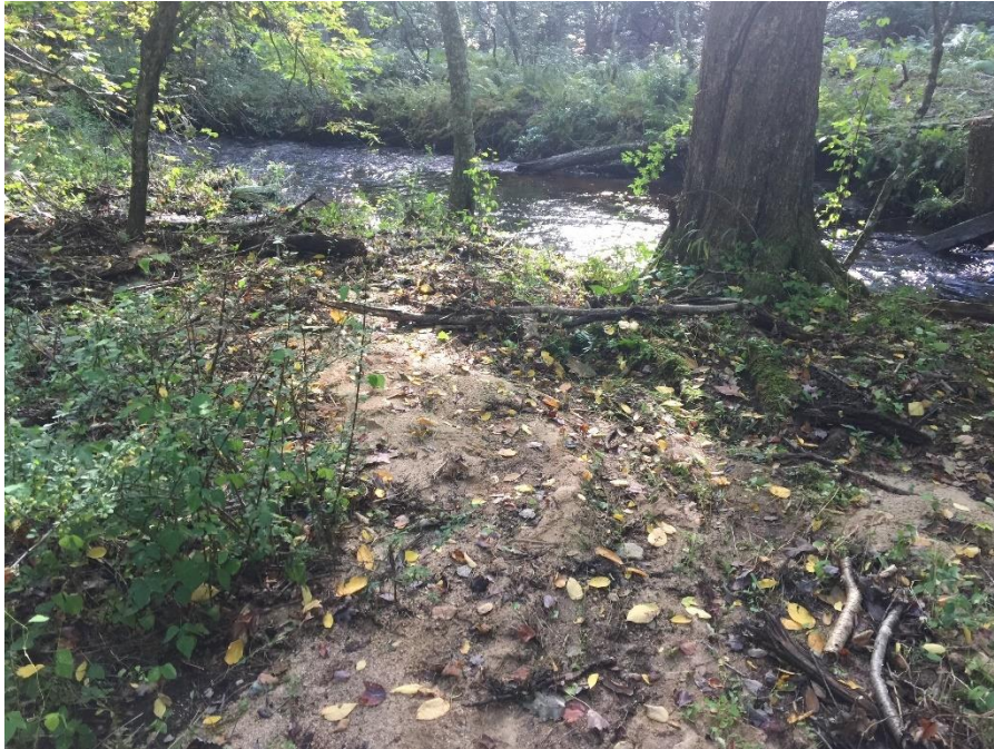
Figure 12 - Eroded material deposited adjacent to Cranberry Meadow Brook on Bialowans Property