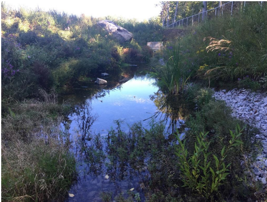
Figure 9 - Wetland Conditions in Bottom of Stormwater Basin