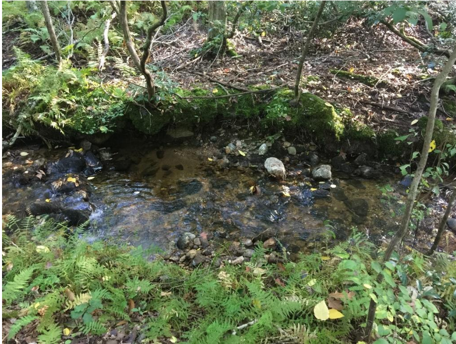
Figure 10 - Undercutting of channel bank of un-named stream on Bialowans Property