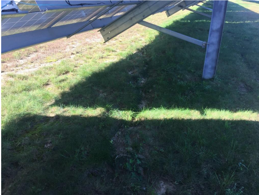
Figure 6 - Concentrated flow from runoff off solar panel