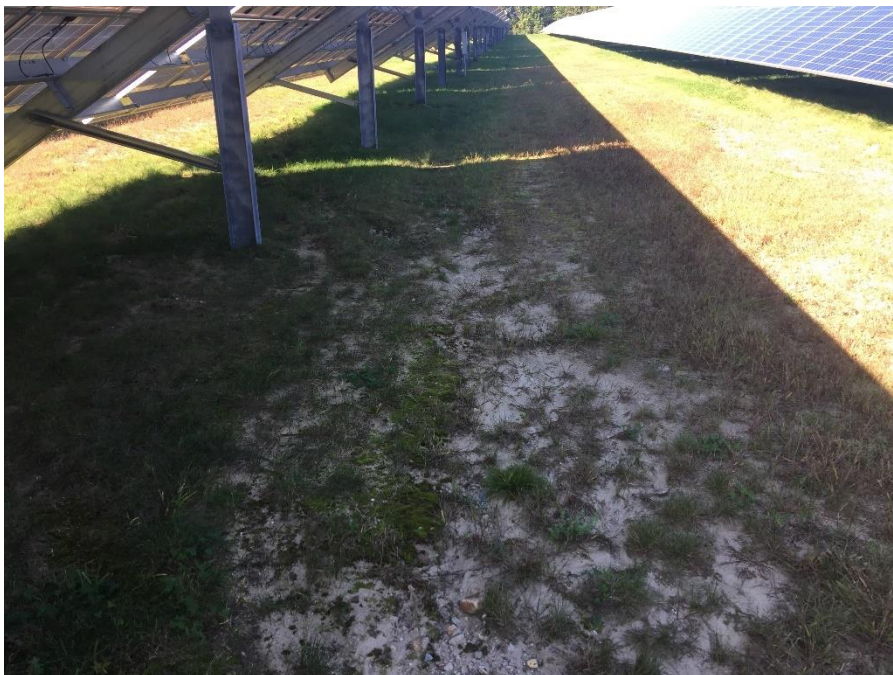
Figure 7 - Erosion & Sedimentation resulting from concentrated flow