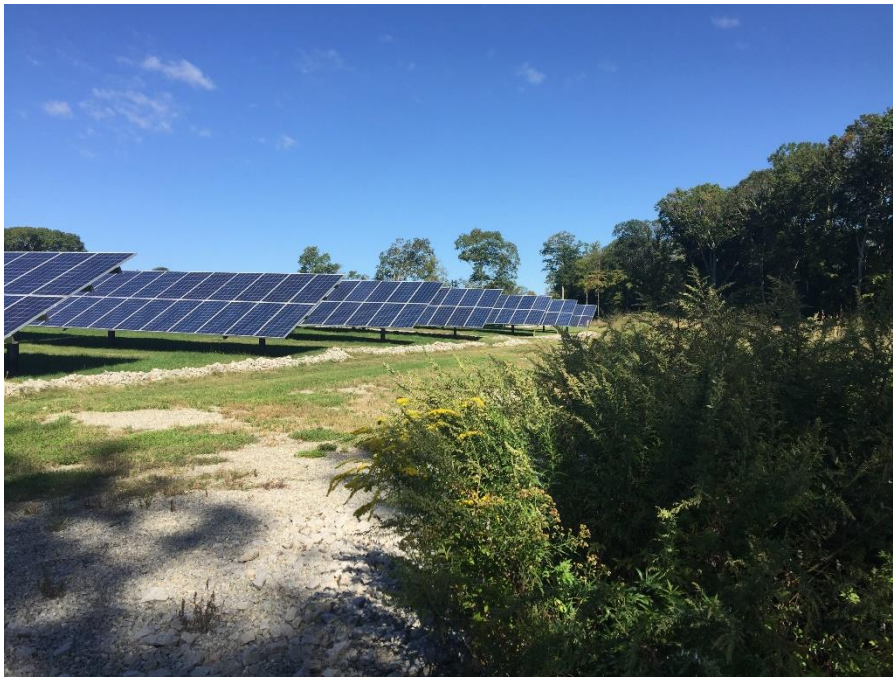
Figure 5 - Stone Berms at downhill end of panel rows