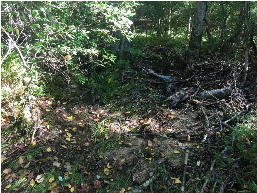
Figure 13 - Eroded material and debris from un-named stream near confluence with Cranberry Meadow Brook on Bialowans Property

My CV is attached to this report. Please feel free to contact my office if you have any questions concerning the information found in this report.