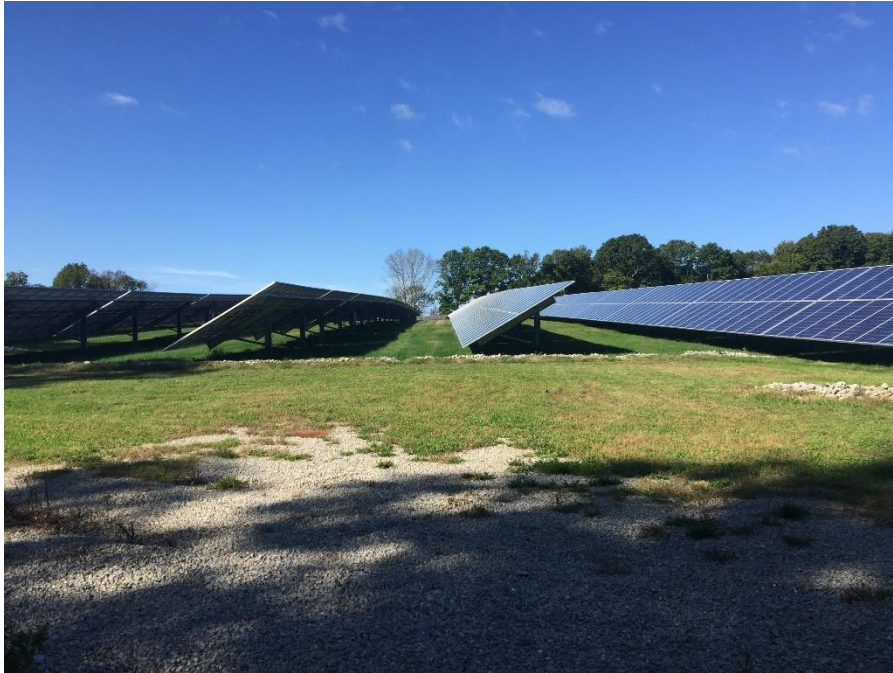
Figure 4 - Grass under and between solar panels