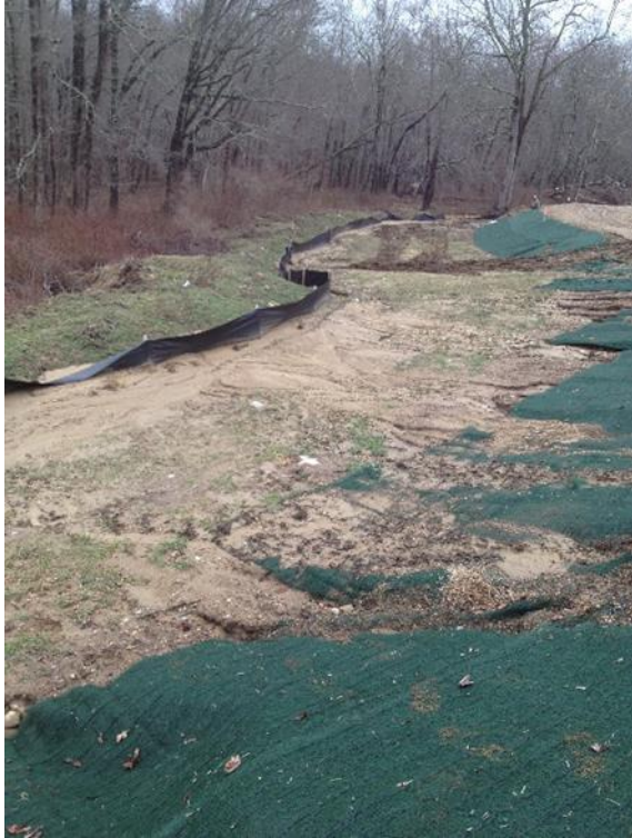
Figure 1 - Erosion Control Blanket (mat)