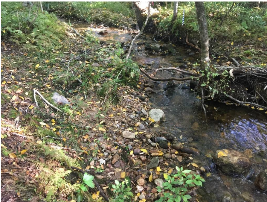
Figure 11 - Erosion and sedimentation in un-named stream on Bialowans Property