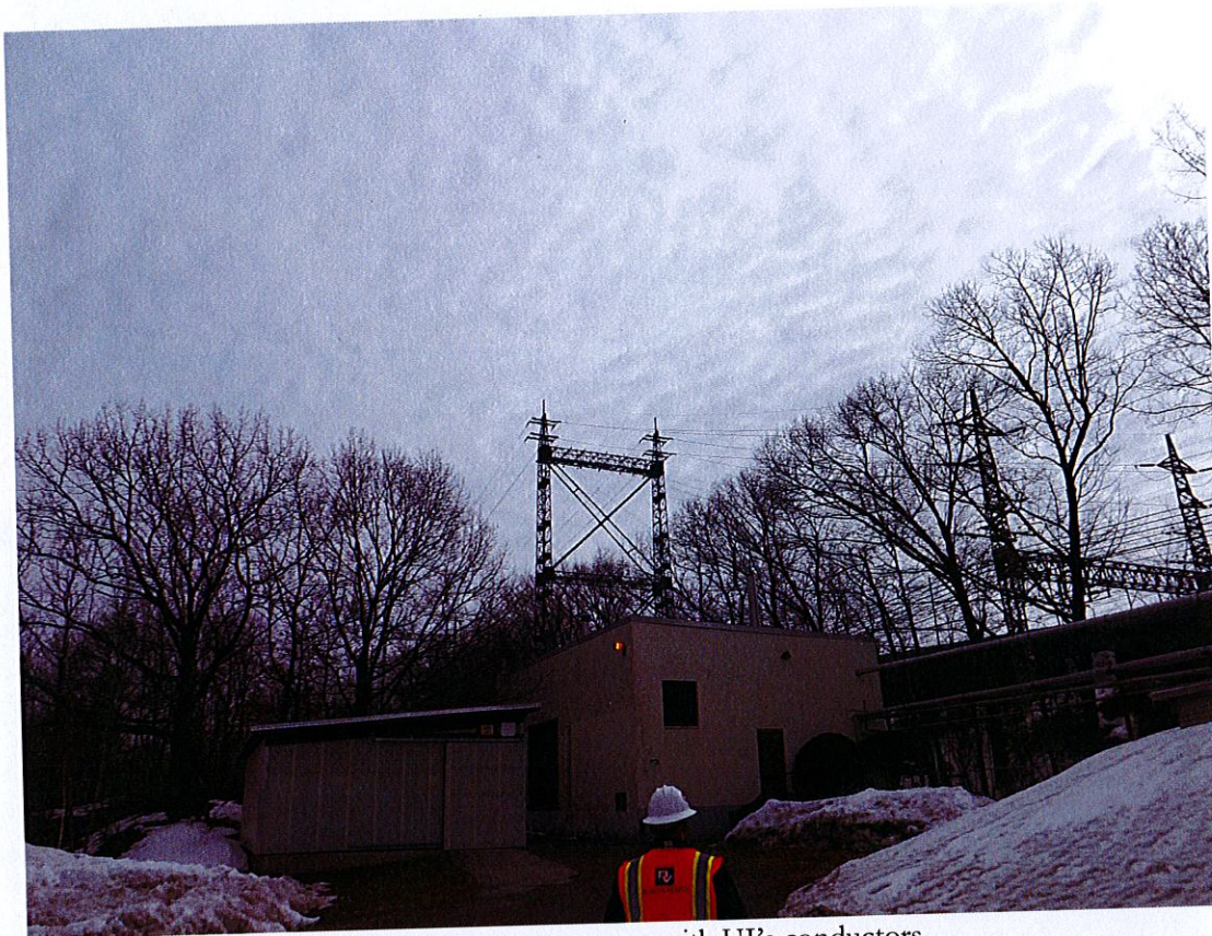
Photograph of existing railroad catenary structures with UI's conductors.