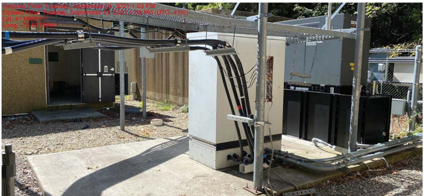
(3) New Signal Cables Run Along Existing Ice Bridge From Existing Cabinet On Existing Concrete Pad Antenna Array