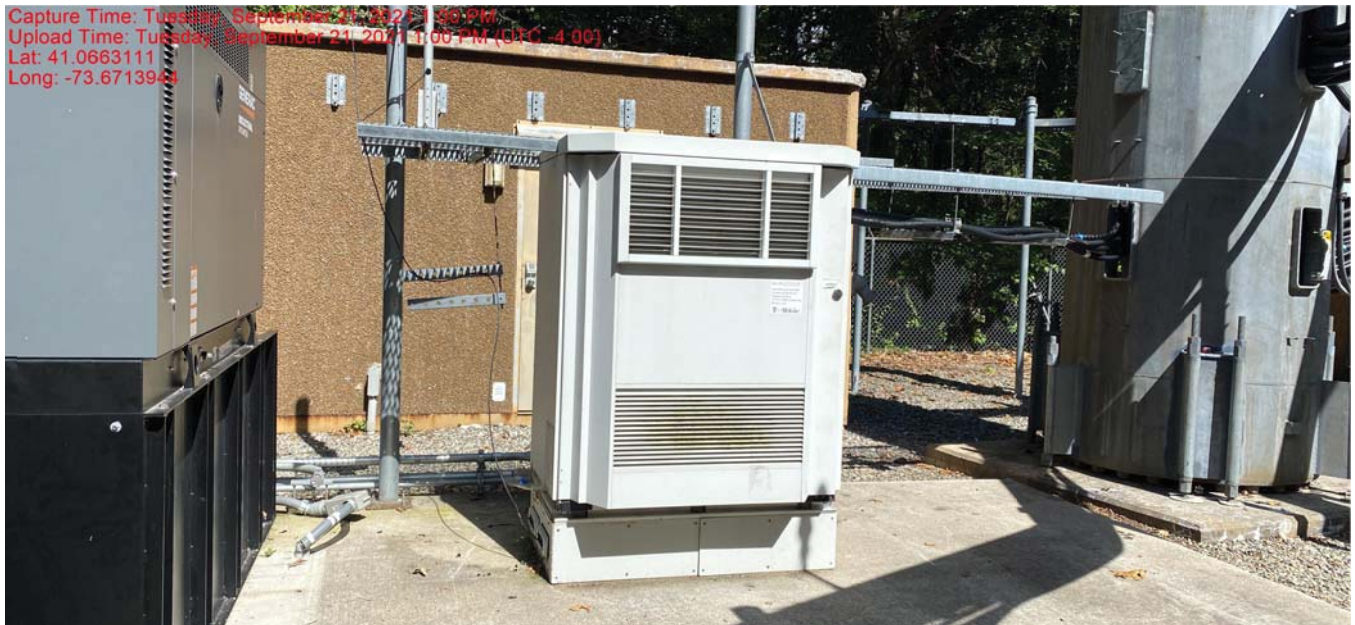
New Radio Equipment Installed Within Existing Cabinet On Existing Concrete Pad (Generator Add Plans Done By Others)