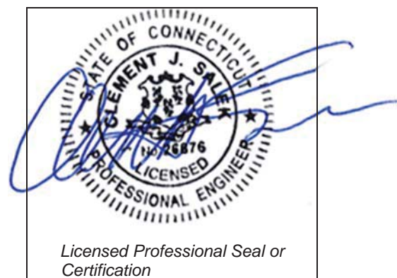
Licensed Professional Seal or Certification