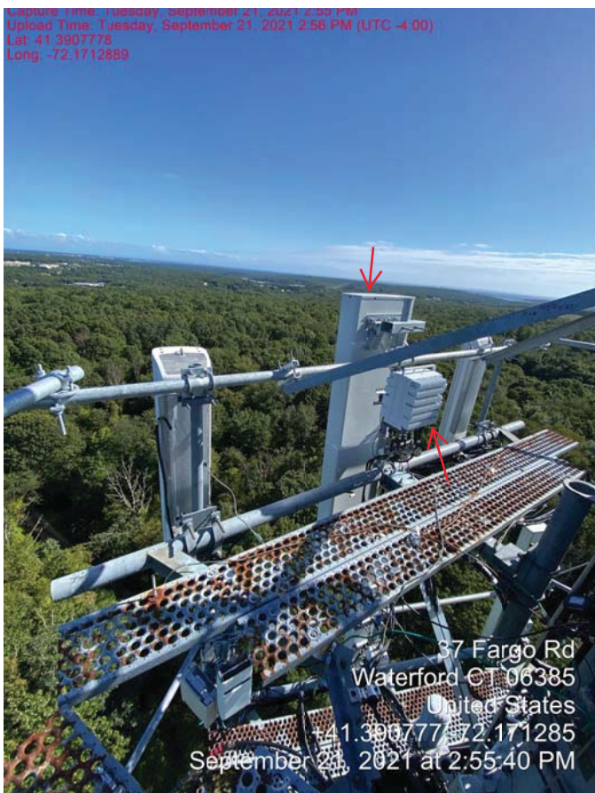
Beta Sector: (1) New Antenna & (1) New RRH Mounted To Existing Frame On Existing Monopole