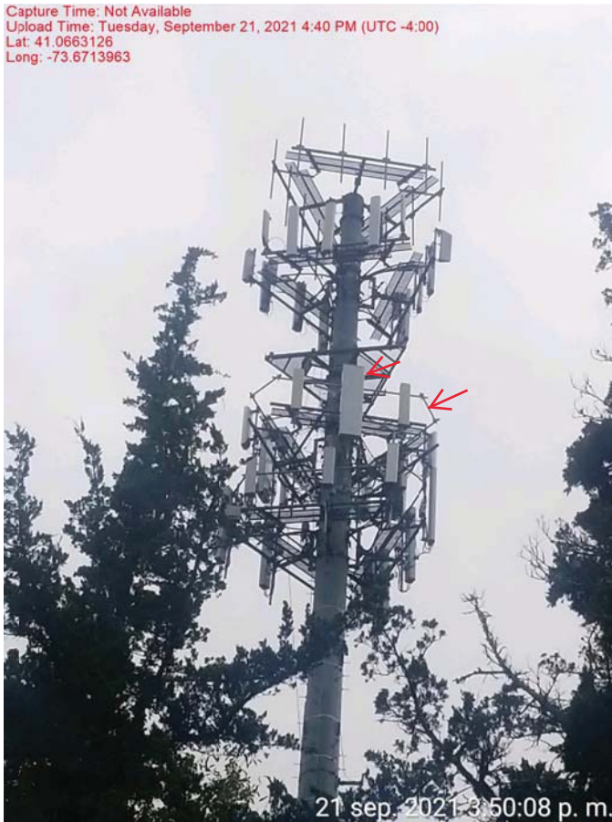
(1) New Handrail Kit, (3) New Antennas & (3) New RRHs Mounted To Existing Frame On Existing Monopole