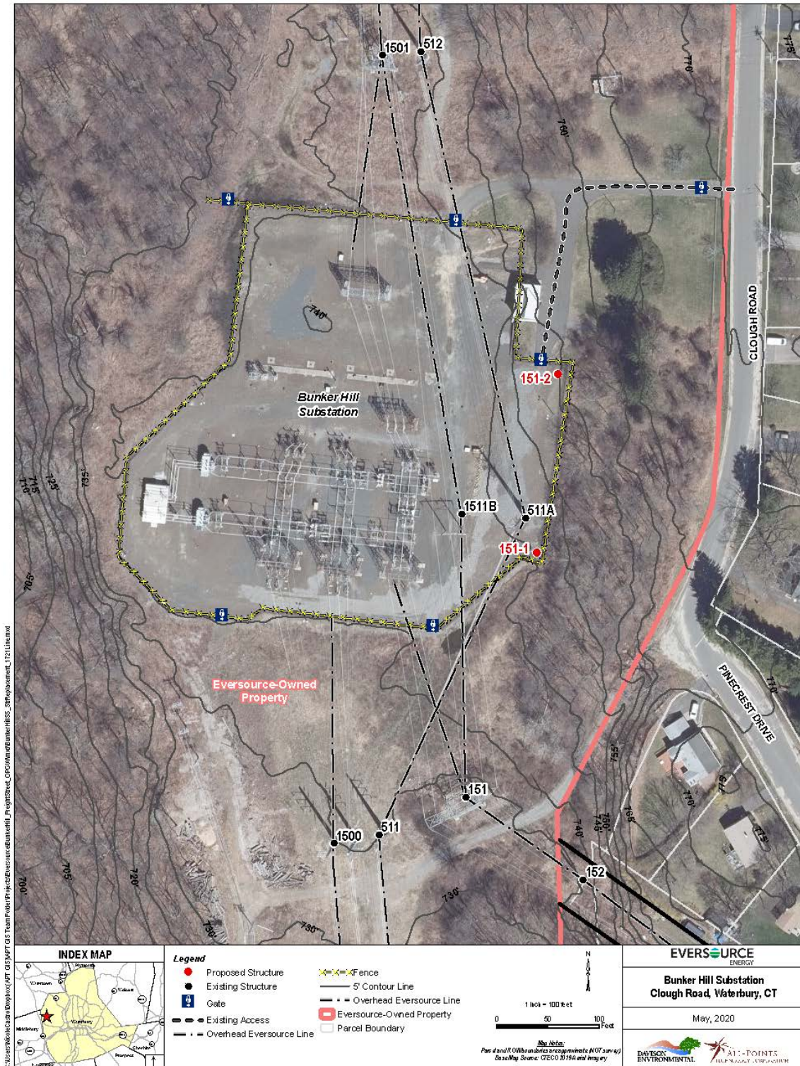
Figure 1 – Bunker Hill Substation Proposed Pole Locations