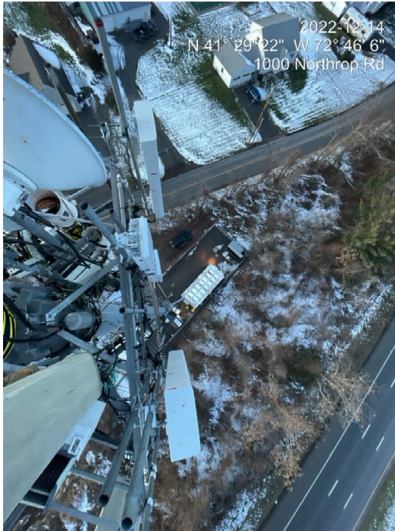
Photo - 1: Installation of antennas and remote radio heads, Alpha Sector