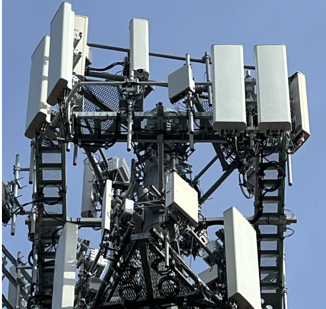
Beta and Gamma sector antennas on new LIFE mount

Apr 25, 2025 at 8:19:41 AM Southbury, CT