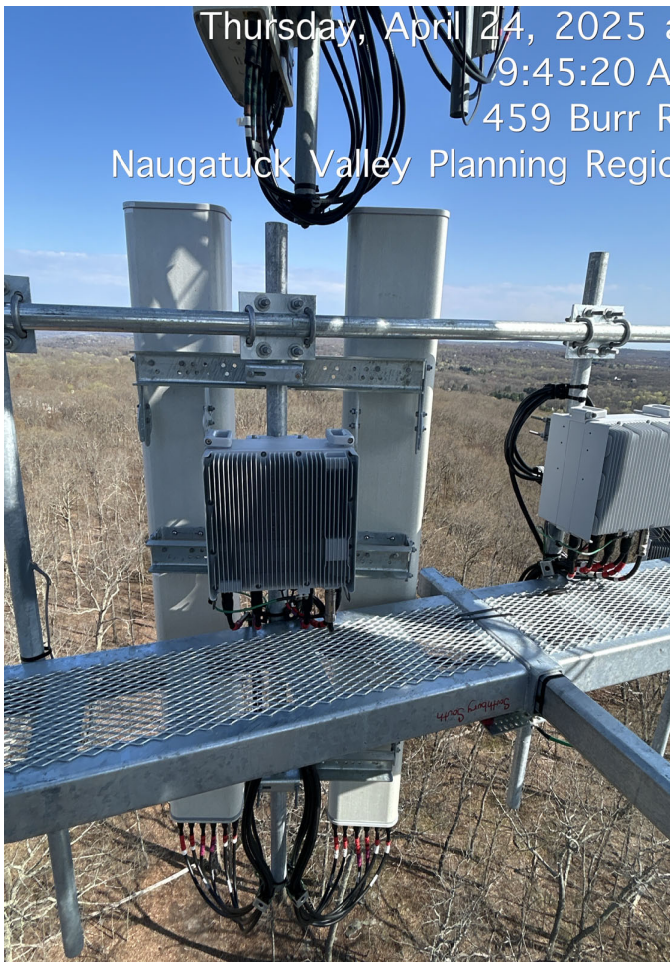
Alpha sector antennas and RRUs on new LIFE mount

Thursday, April 24, 2025 at 9:45:20 AM 459 Burr R Naugatuck Valley Planning Region