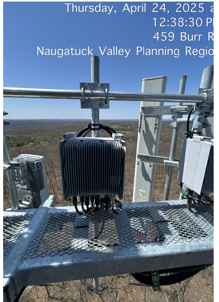
Delta sector antennas and RRUs on new LIFE mount