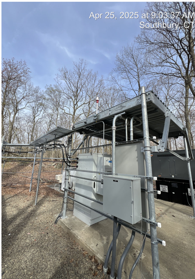
New equipment installation on concrete pad