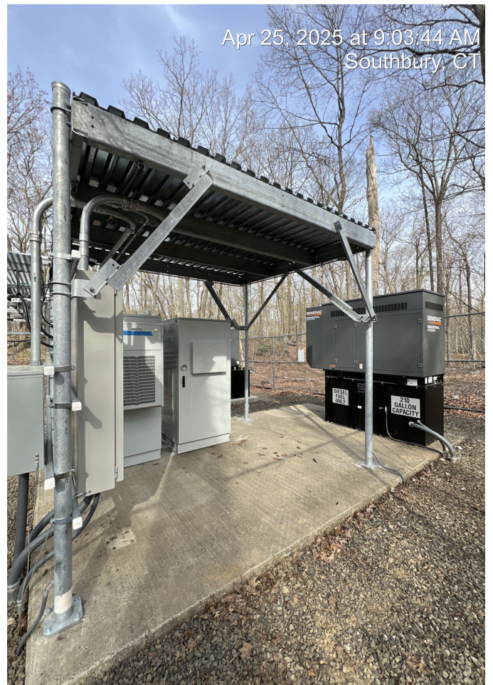
New equipment installation on concrete pad