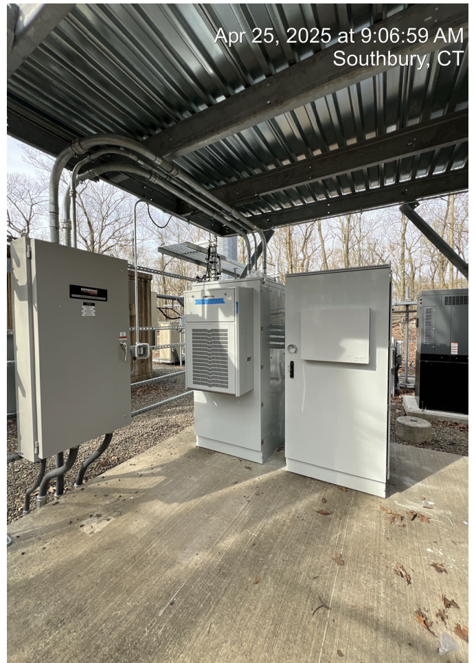
New equipment installation on concrete pad