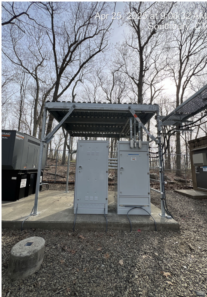
New equipment installation on concrete pad