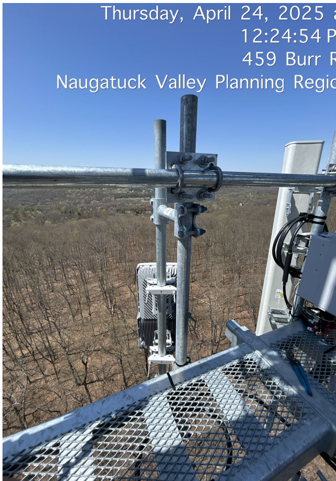
Gamma sector antennas and RRUs on new LIFE mount