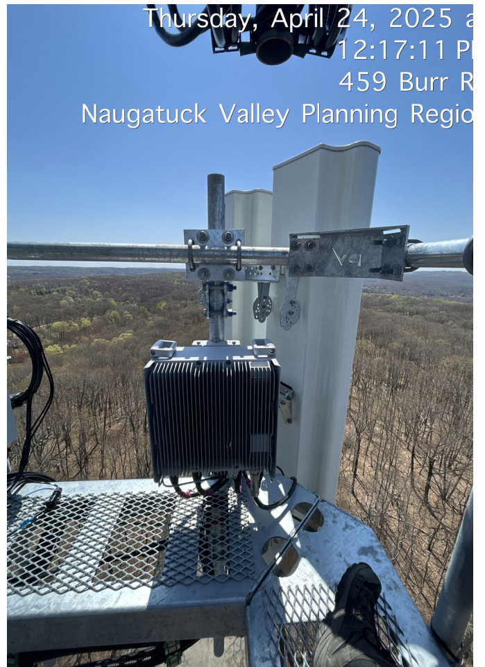
Gamma sector antennas and RRUs on new LIFE mount