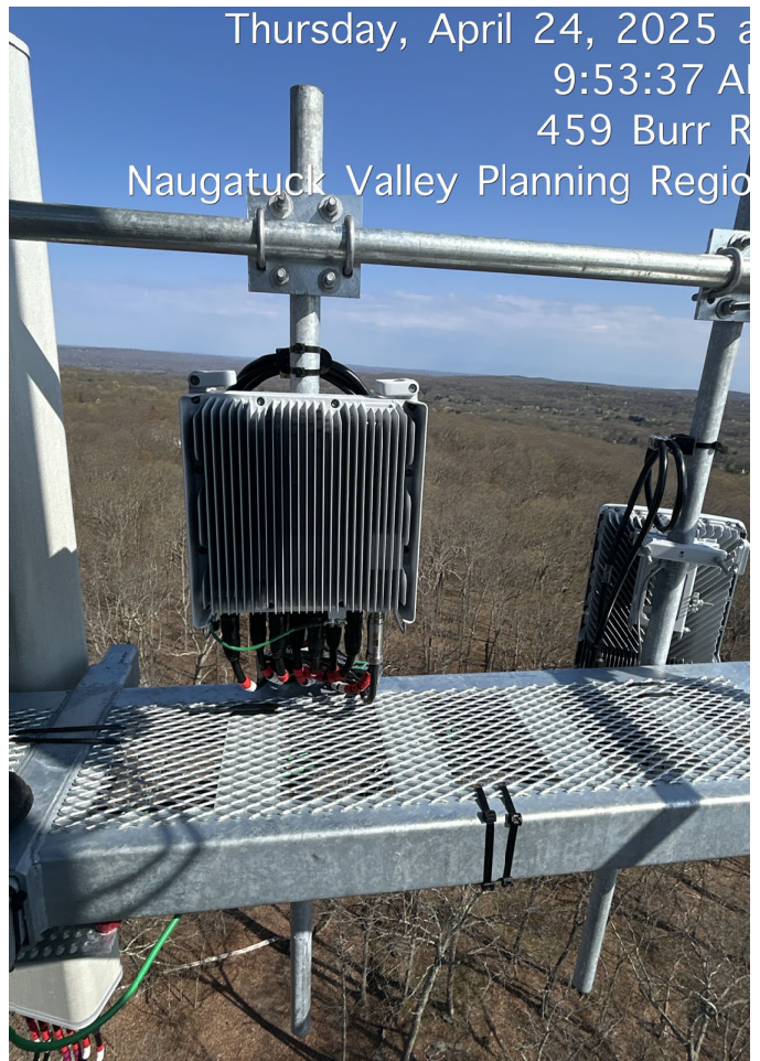
Alpha sector antennas and RRUs on new LIFE mount

Thursday, April 24, 2025 at 9:53:37 AM 459 Burr R Naugatuck Valley Planning Region