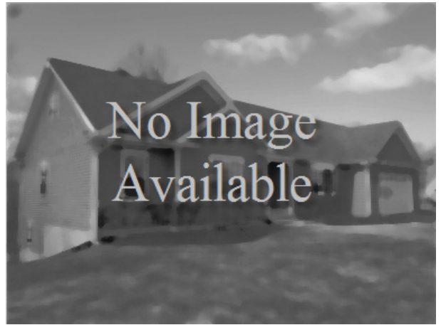
( http://images.vgsi.com/photos/NewtownCTPhotos//default.jpg )