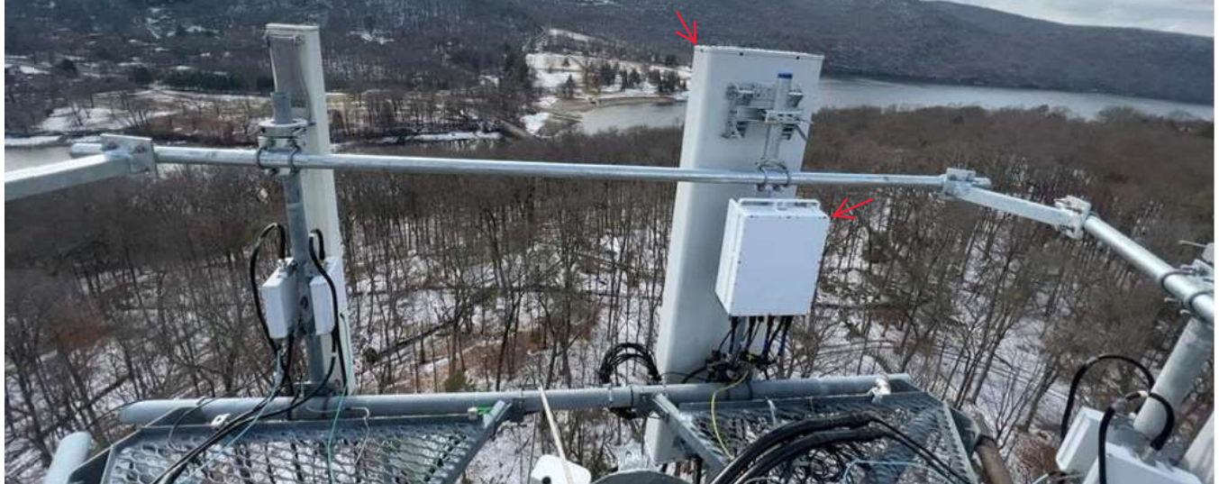
Beta Sector: (1) New Antenna & (1) New RRH Installed On Modified Mounting Platform

mar. 2, 2023, 2:25:39 p.m. 29 Bogus Hill Rd New Fairfield CT 06812 Estados Unidos