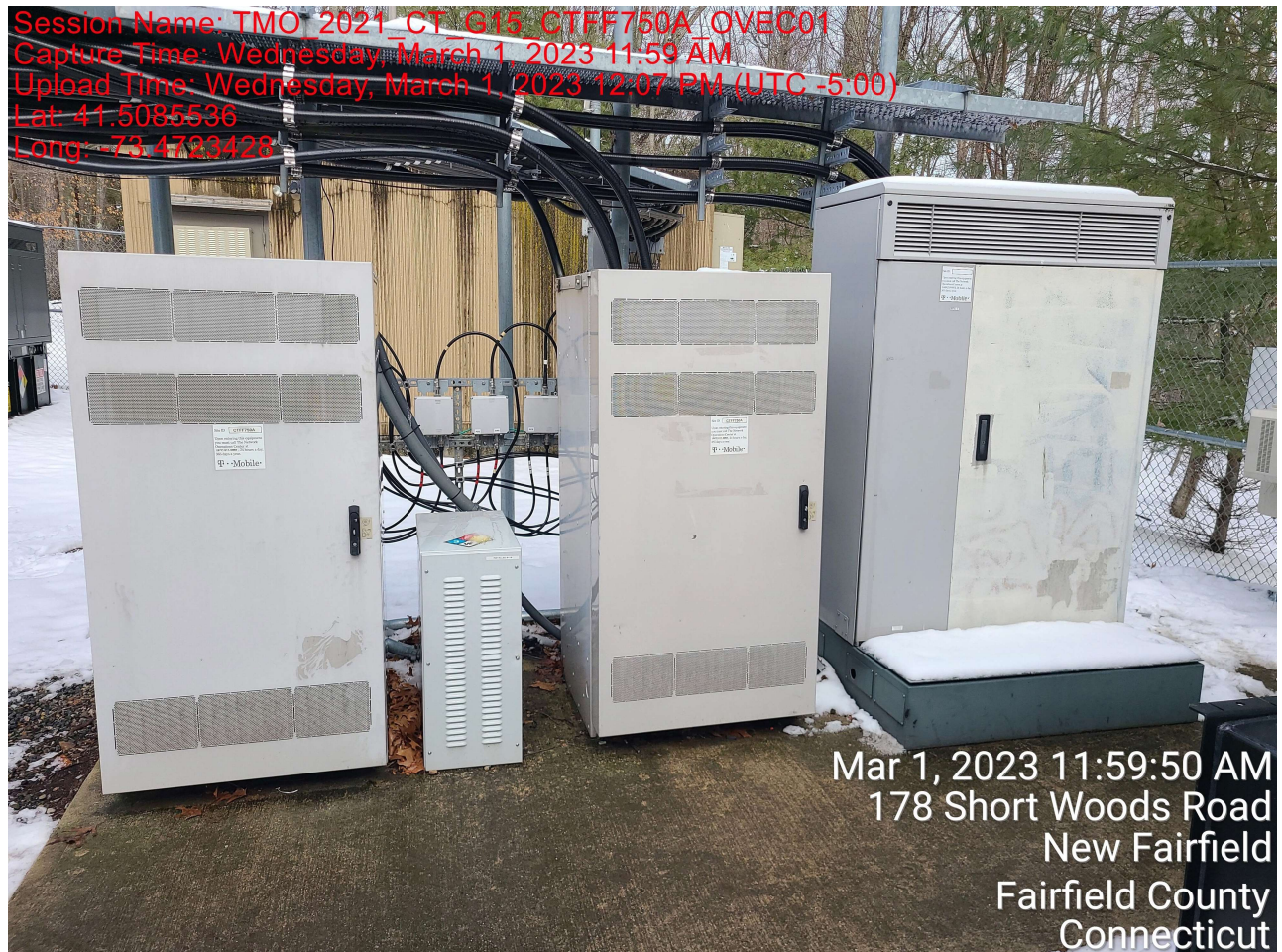
Existing Equipment Cabinets Mounted To Existing Concrete Pad