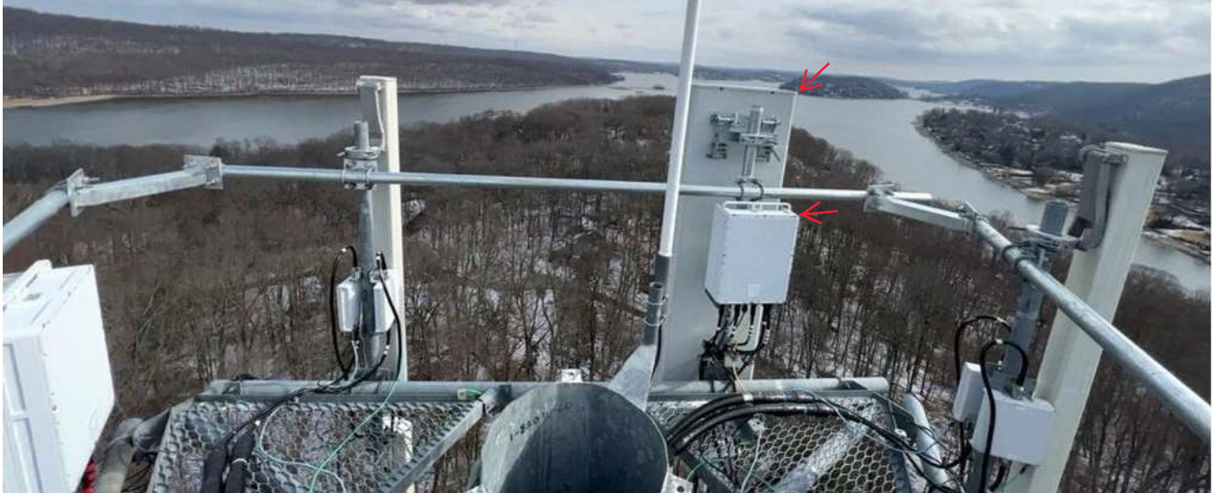
Gamma Sector: (1) New Antenna & (1) New RRH Installed On Modified Mounting Platform

mar. 2, 2023, 2:28:29 p.m. 29 Bogus Hill Rd New Fairfield CT 06812 Estados Unidos