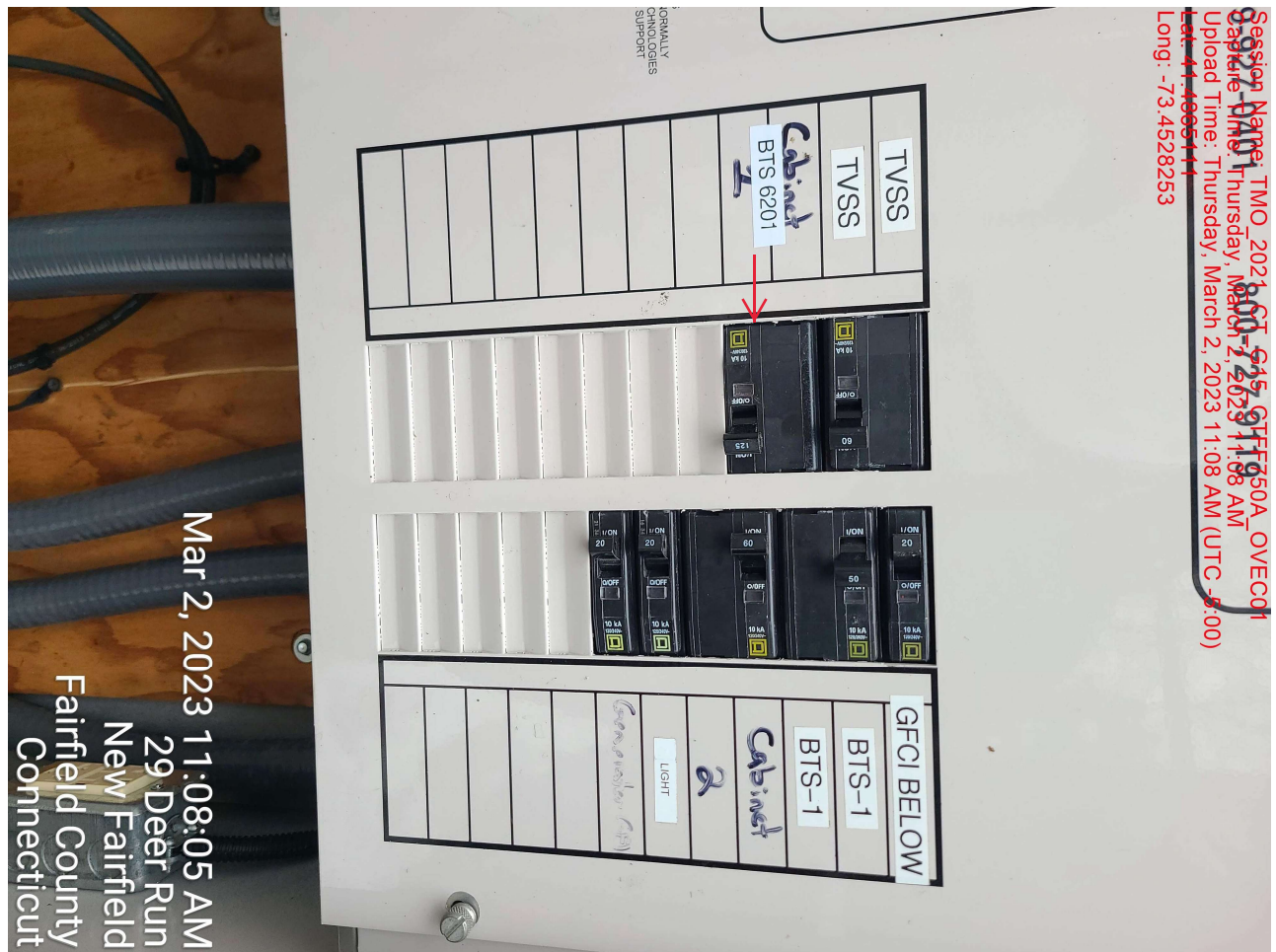
New 125A-2P Breaker Installed In Existing Electric Panel