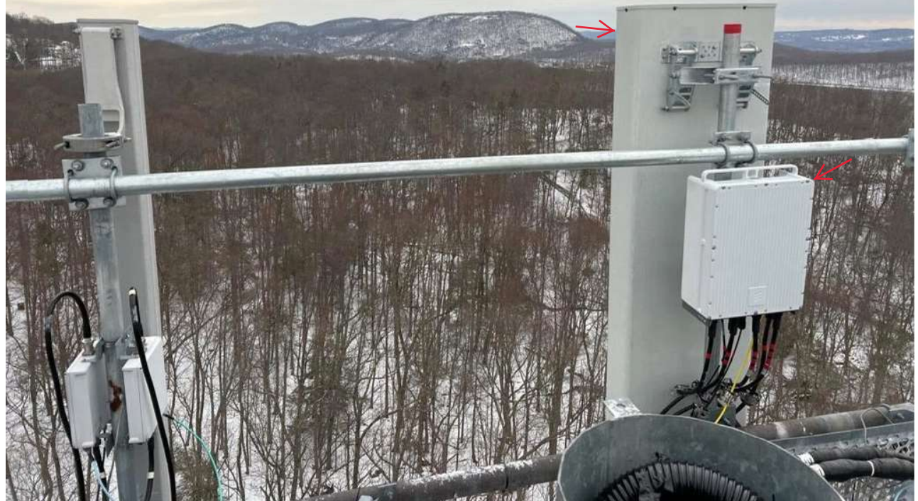
Alpha Sector: (1) New Antenna & (1) New RRH Installed On Modified Mounting Platform

mar. 1, 2023, 3:47:09 p.m. 29 Bogus Hill Rd New Fairfield CT 06812 Estados Unidos