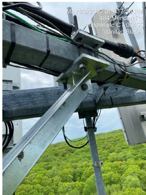
Fig. 4: Mount Modification

2595 North Dallas Parkway Suite 300, Frisco, TX 75034