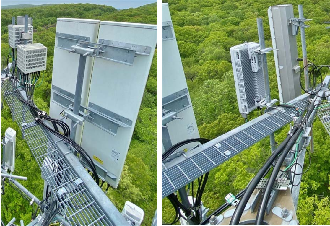
Fig. 3: Overall View of Antennas, RRHs & OVP in Gamma Sector

Accelerating Network and Business Transformation