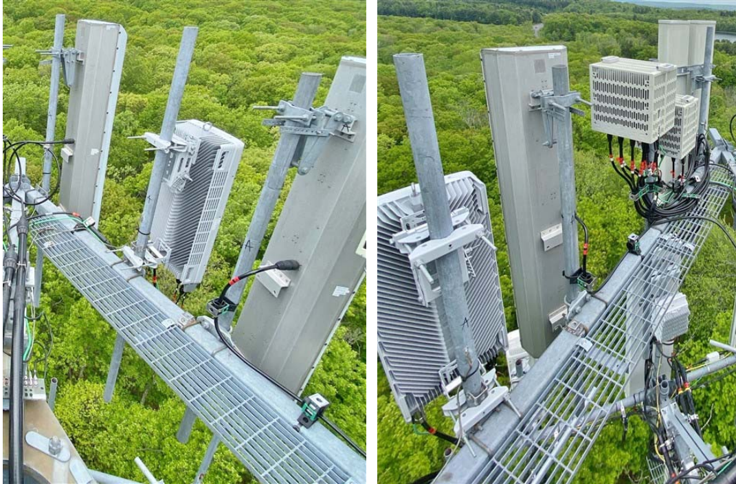
Fig. 1: Overall View of Antennas, RRHs & OVP in Alpha Sector

Accelerating Network and Business Transformation