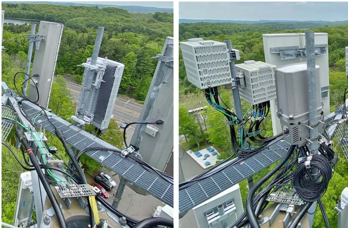
Fig. 2: Overall View of Antennas, RRHs & OVP in Beta Sector

2595 North Dallas Parkway Suite 300, Frisco, TX 75034