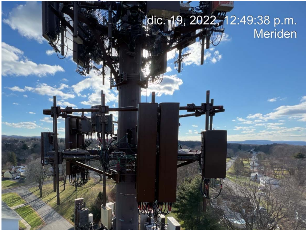
Fig. 1: Overall View of Antennas, RRHs & OVP in Alpha Sector

Accelerating Network and Business Transformation