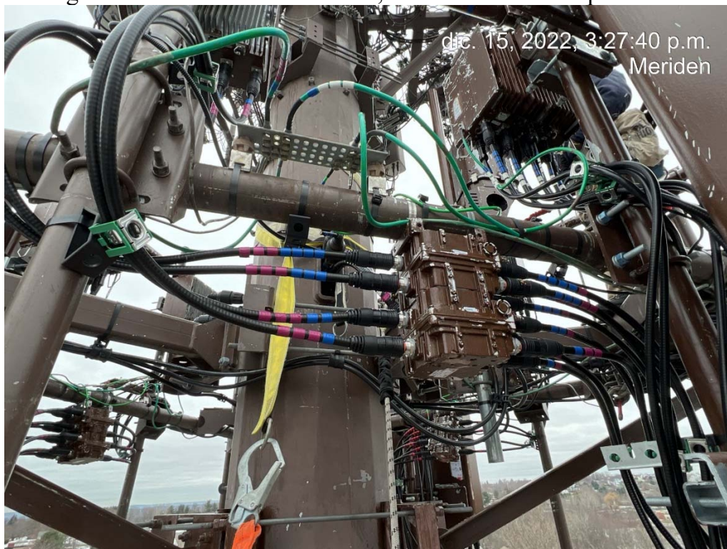
Fig. 2: Overall View of Antennas, RRHs & OVP in Beta Sector

2595 North Dallas Parkway Suite 300, Frisco, TX 75034