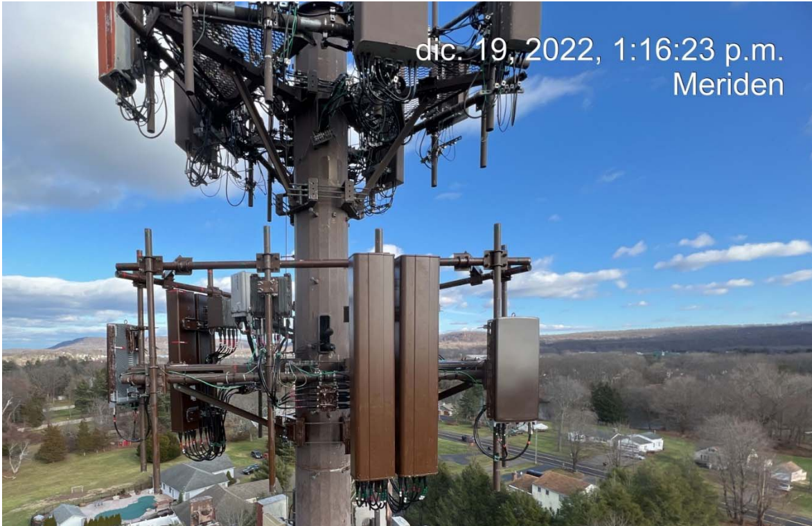
Fig. 3: Overall View of Antennas, RRHs & OVP in Gamma Sector

Accelerating Network and Business Transformation