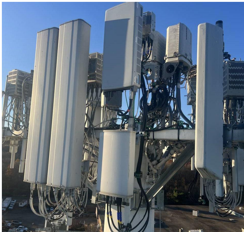
Fig. 2: Overall View of Antennas & Equipment (Beta Sector)