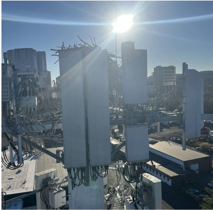
Fig. 1: Overall View of Antennas & Equipment (Alpha Sector)