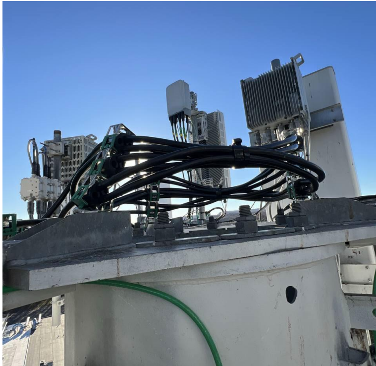
Fig. 3: Overall View of Antennas & Equipment (Gamma Sector)