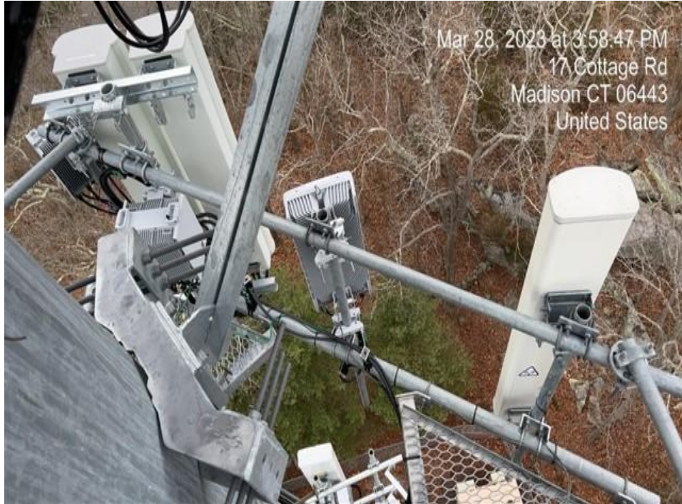
Fig. 3: Overall View of Antennas & RRHs in Gamma Sector