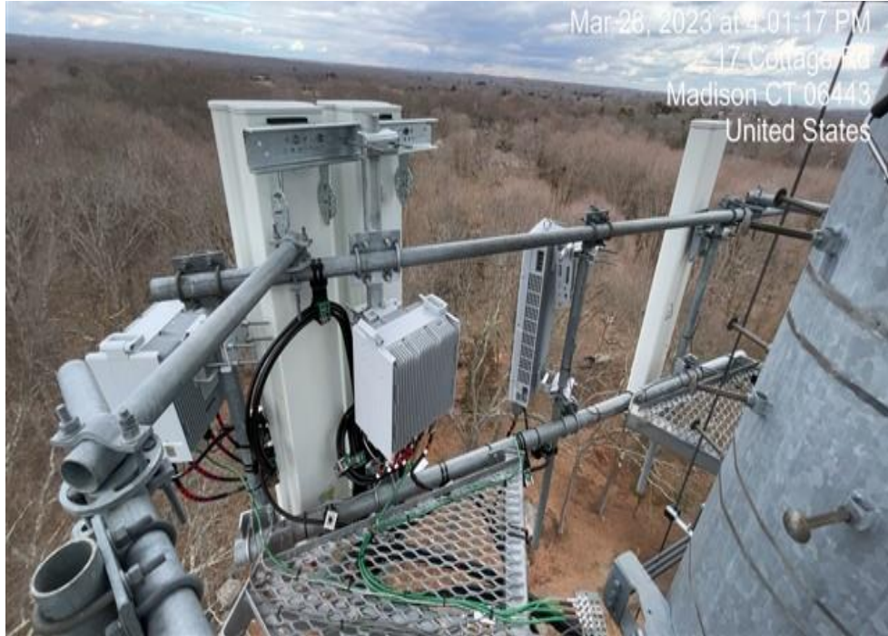
Fig. 1: Overall View of Antennas & RRHs in Alpha Sector