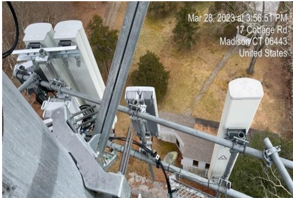
Fig. 2: Overall View of Antennas & RRHs in Beta Sector