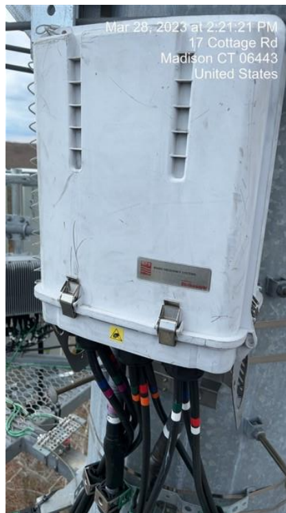
Fig. 4: Overall View of OVP Box