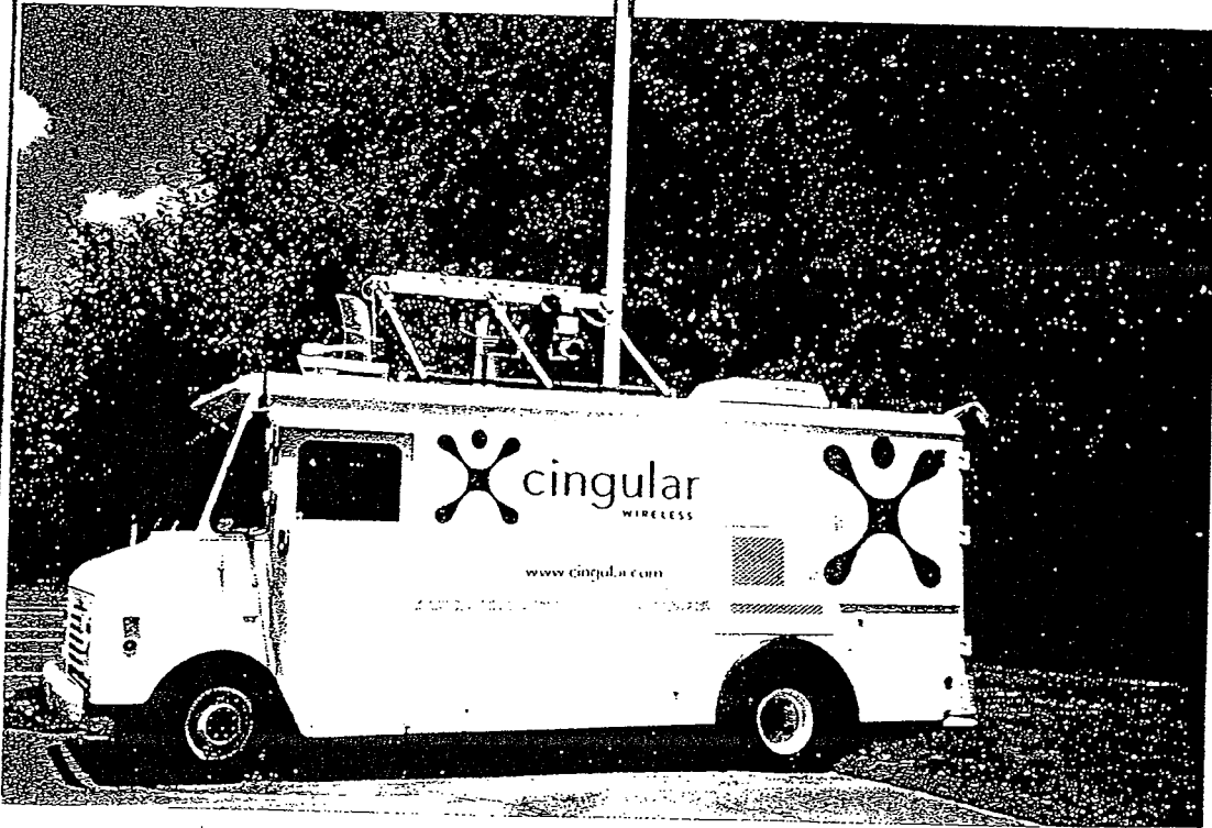
CINGULAR "COW" (CELL ON WHEELS)