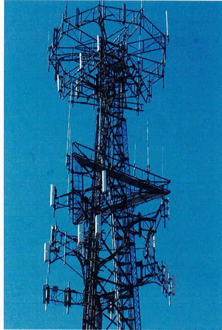
170' TOWER & ARRAYS