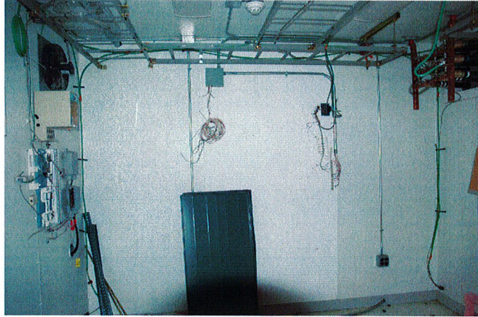
INSIDE OF FORMER AT&T SHELTER USED FOR BASE STATION & ASSOCIATED EQUIPMENT