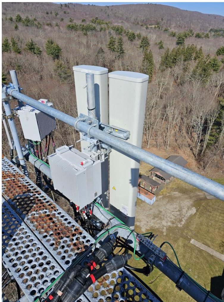
Photo 53: Position 1 radio installed in front of the mount pipe instead of behind.