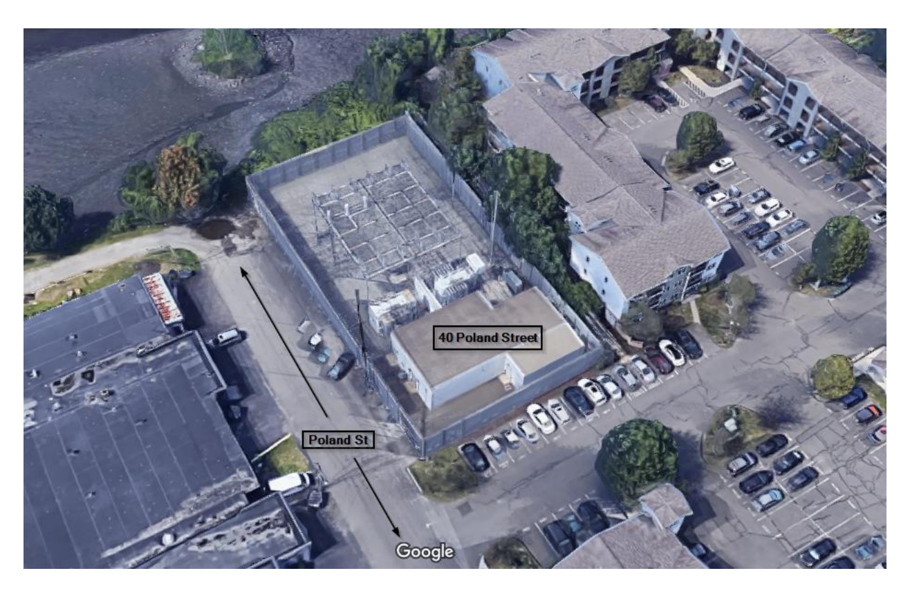
Ash Creek Substation 40 Poland Street, Bridgeport CT 06605