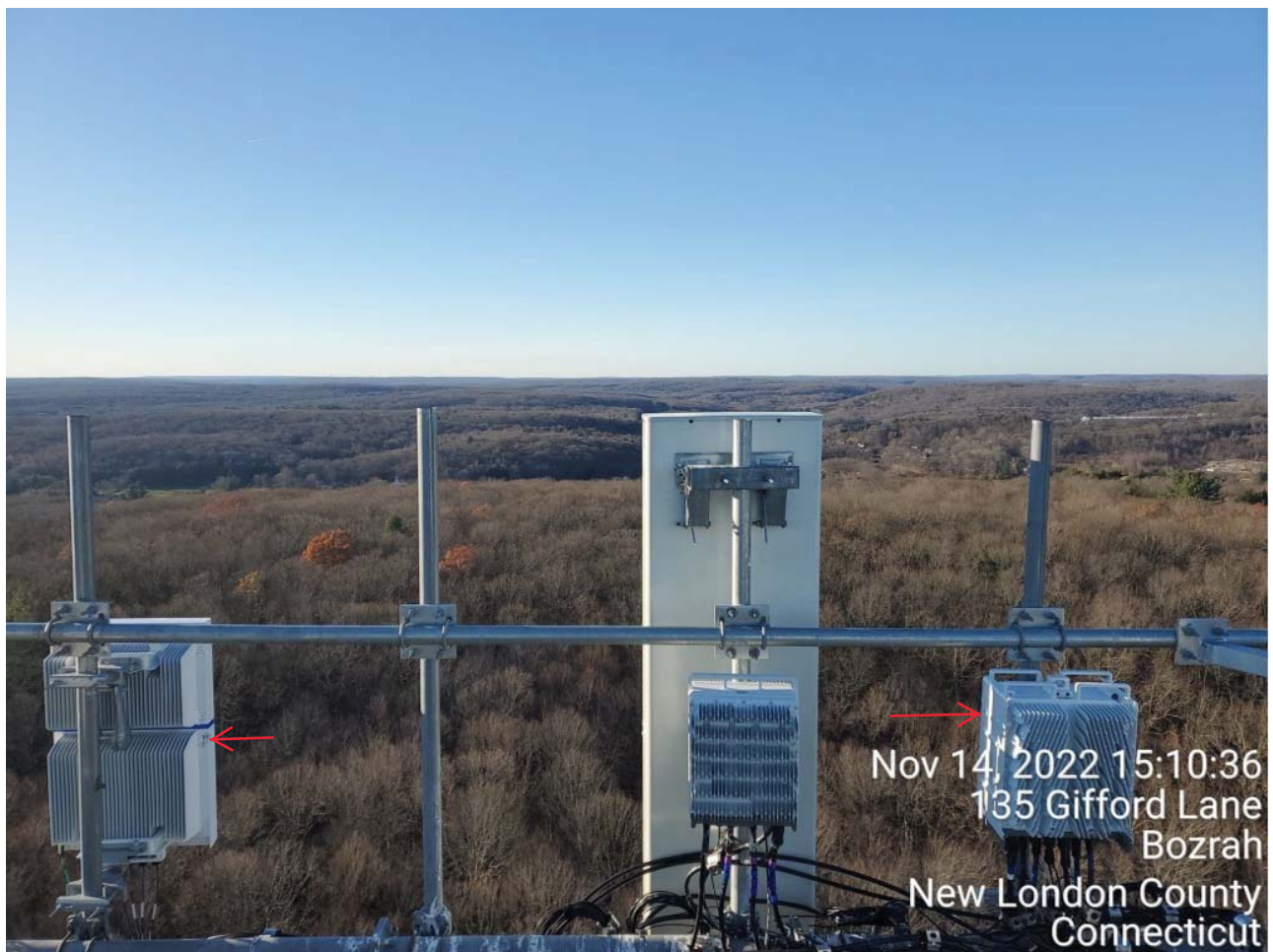
Beta Sector: (1) New Antenna & (1) New RRH Installed On Existing Mounting Platform

Nov 14, 2022 15:10:36 135 Gifford Lane Bozrah New London County Connecticut