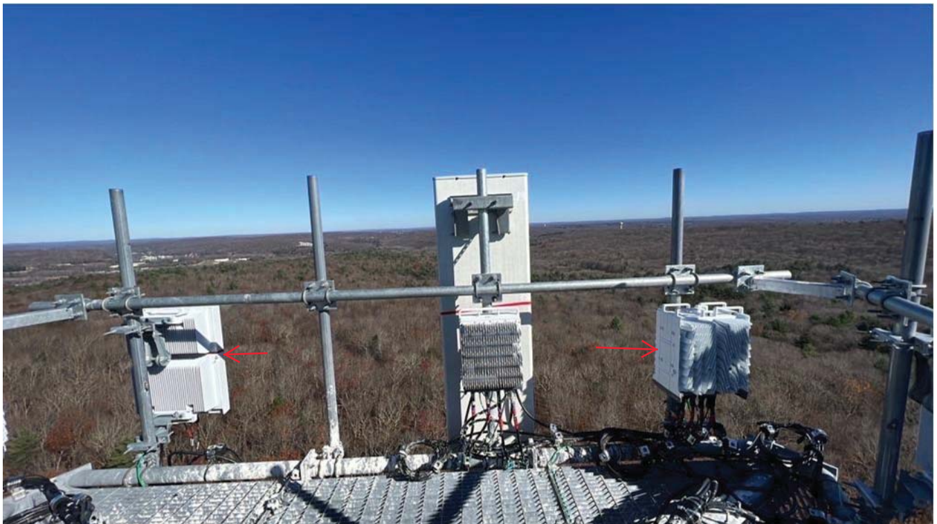
Alpha Sector: (1) New Antenna & (1) New RRH Installed On Existing Mounting Platform