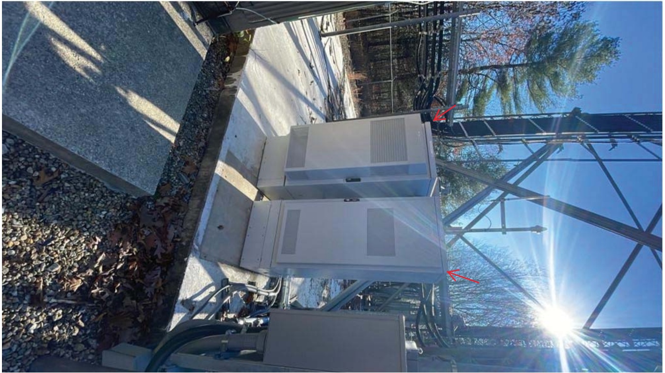
Existing Ground Level Equipment Mounted To Existing Concrete Foundation