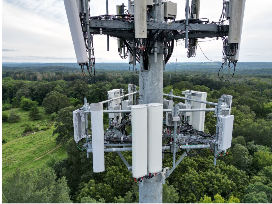
Fig. 1: Overall View of Antennas & RRHs