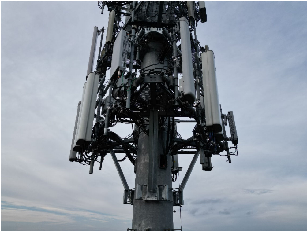
Fig. 4: Overall View of Antennas & Modifications