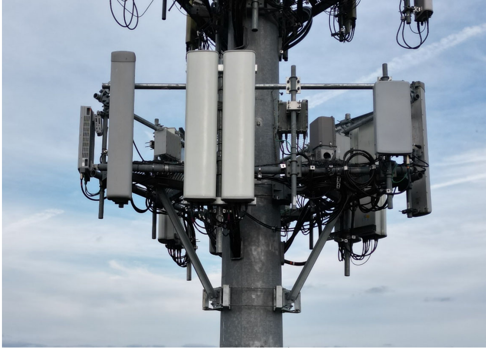
Fig. 3: Overall View of Antennas & Modifications