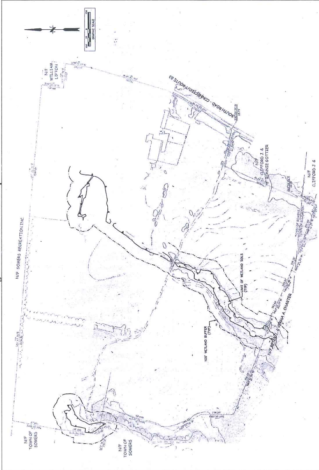
(SSC 1, Attachment I – Wetland Map)