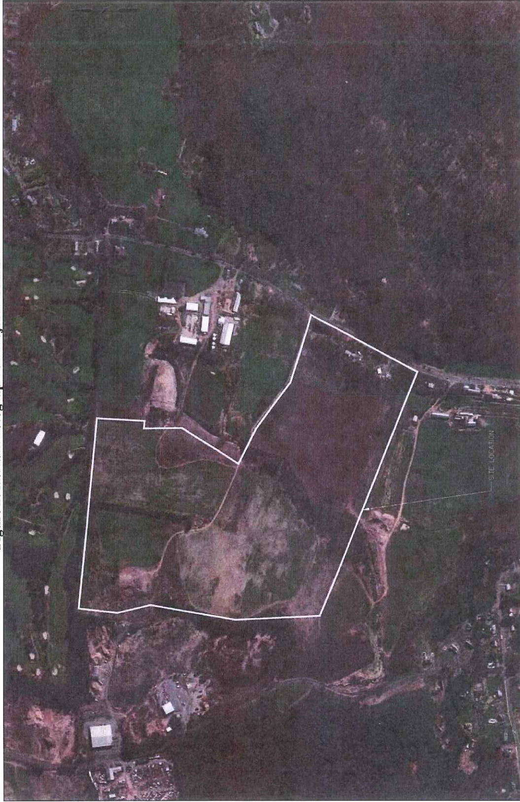
Figure 2: Aerial Photograph of Project Location

(SSC 1, Attachment F – Request for Natural Diversity Base Review)