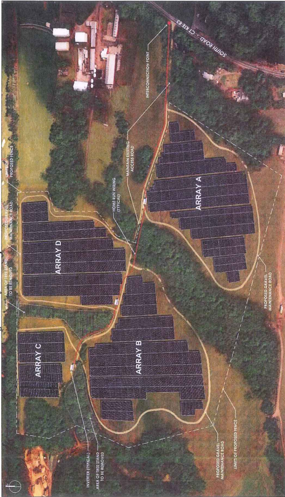
Figure 3: Layout of Proposed Solar Panel Arrays

(SSC 1, Attachment E – Fuss & O’Neill Request for Archaeological Review, Figure 2)