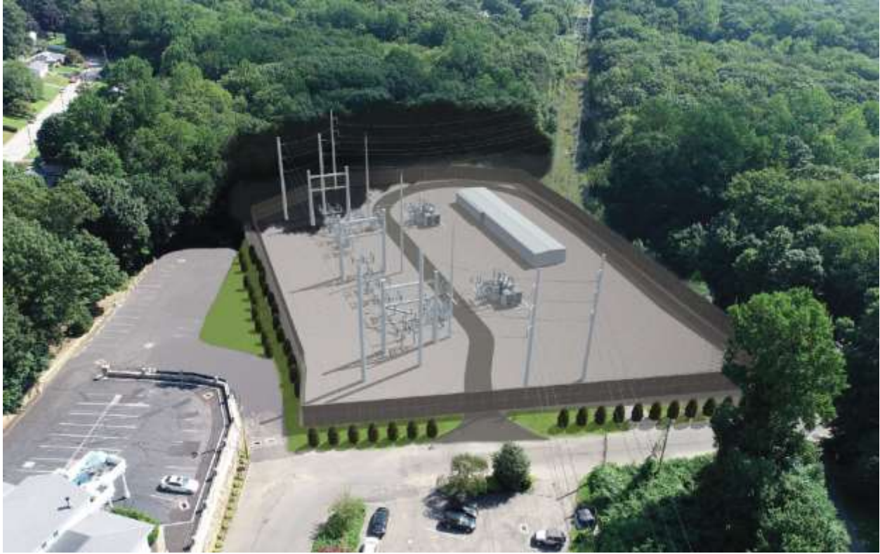
Figure 4 – Aerial View and Simulation of Proposed Project

(UI 1, Appendix D – Visual Assessment and Photo-Simulations, Proposed Conditions)