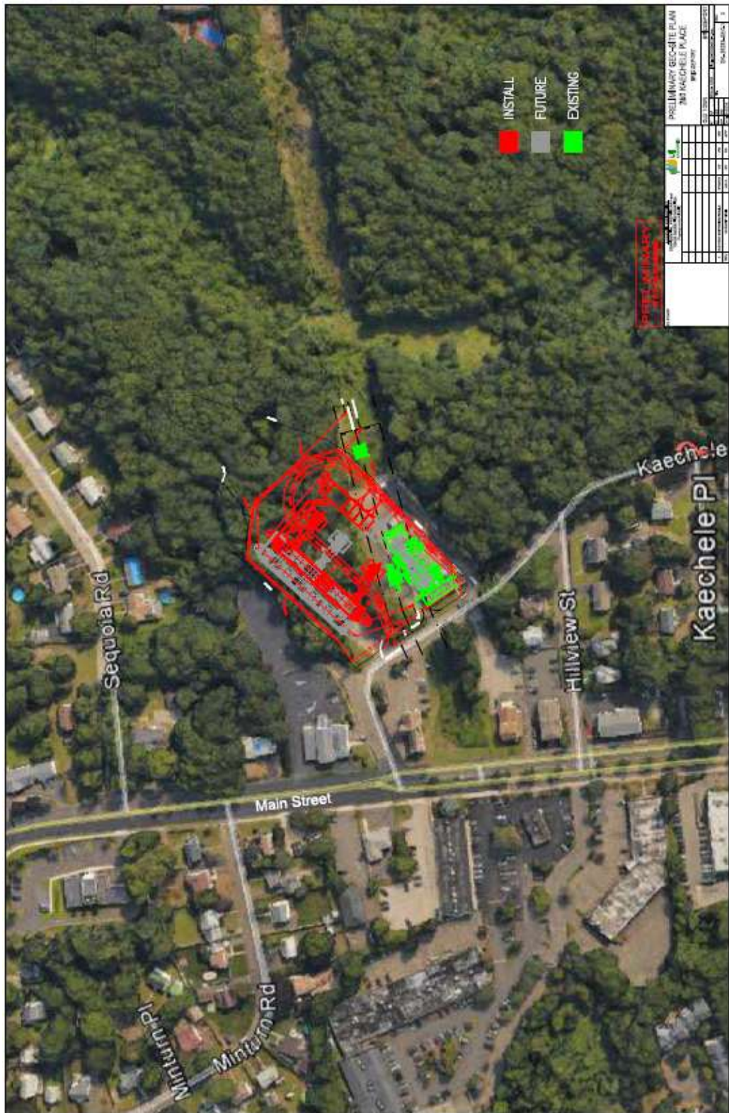
(UI 1, Appendix A)