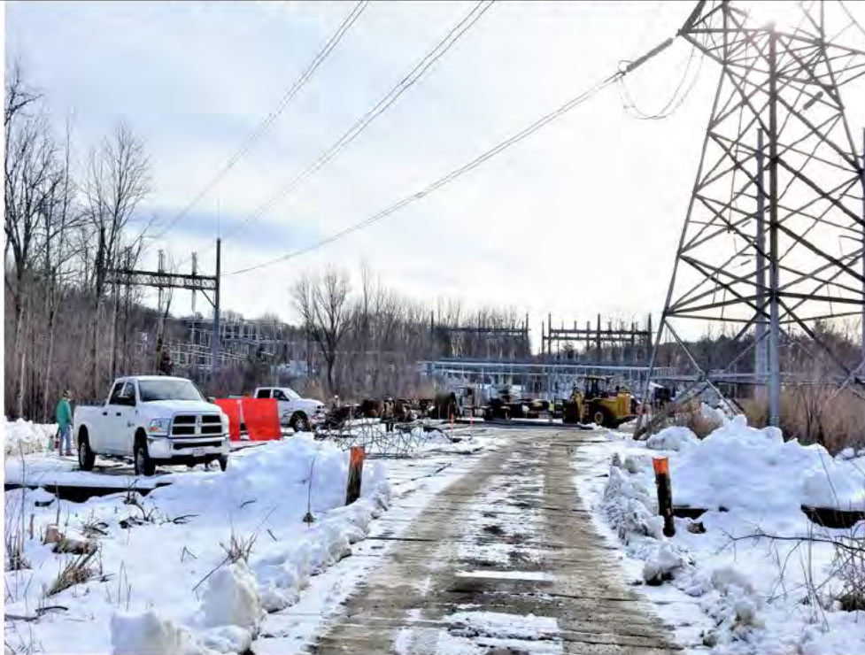
Photo 1: 03/15/2018, Bethel: Map 01, setting up equipment at Str1000 to start drilling structure base foundation hole. Photo taken facing east towards Str1000 and the Plumtree Substation.