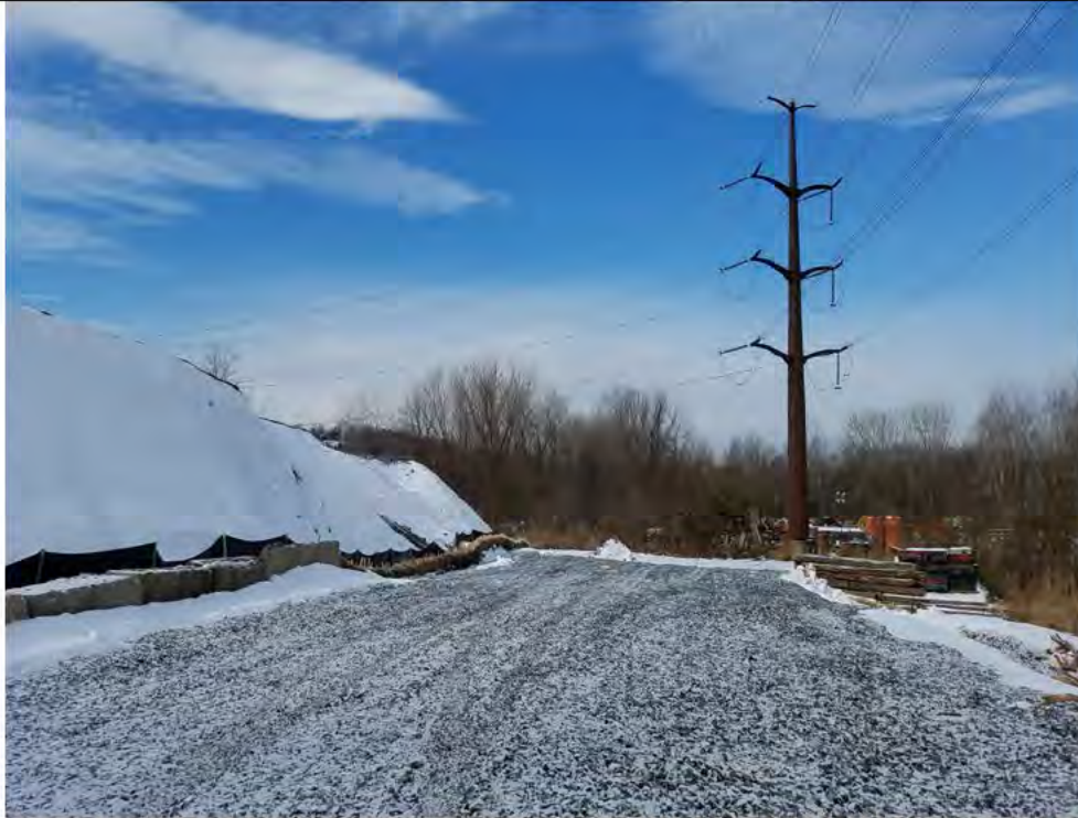
Photo 3: 03/15/2018, Danbury: Map 06, pull pad construction completed east of Str1012, area graded and stone base material placed to final grade. Photo taken facing west towards Str1012.