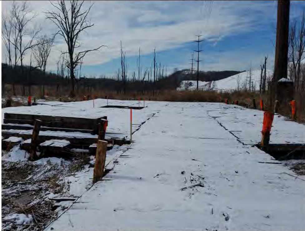
Photo 5: 03/15/2018, Danbury: Map 06, timber mat constructed work pad at Str1011. Photo taken facing south towards Str1011.