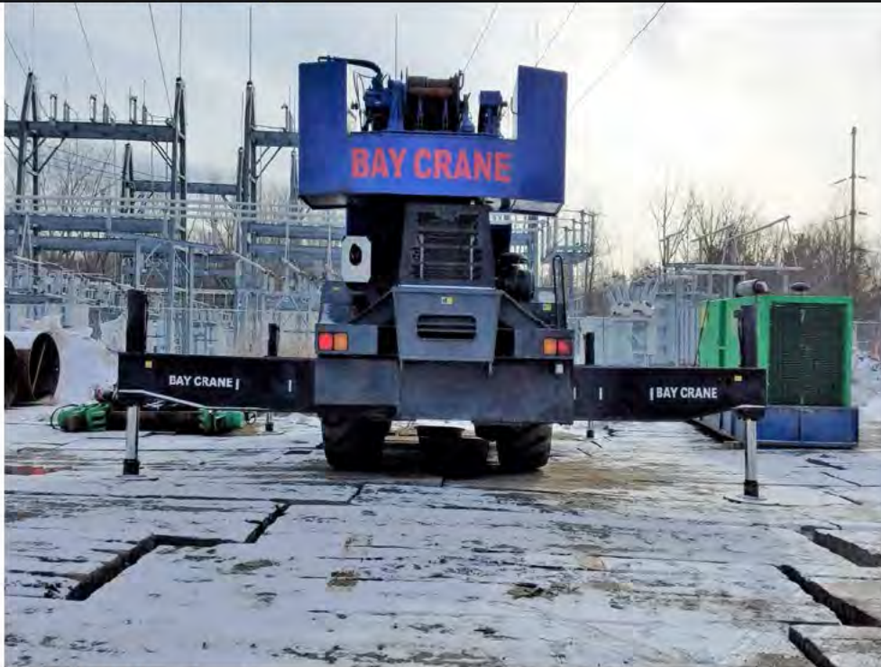
Photo 2: 03/15/2018, Bethel: Map 01, setting up equipment at Str1000 to start drilling structure base foundation hole. Photo taken facing east towards Str1000 and the Plumtree Substation. Photo Credit: Marleigh Sullivan (BSC Group).

Photo Credit: Marleigh Sullivan (BSC Group).