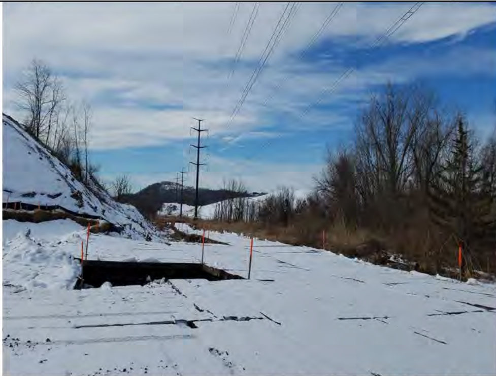
Photo 4: 03/15/2018, Danbury: Map 06, timber mat constructed pads and access road from Str1012 south to Str1011 through Wetland W1. Photo taken facing South from Str1012 to Str1011 in the distance.